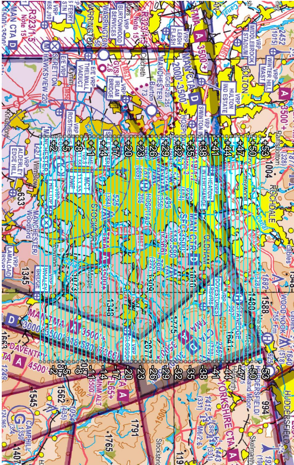
Chart 1 – Area of operation

The chart highlighting the area of operation are shown below. These are for illustrative purposes only and not for operational planning. Runs shown do not include procedural ~5nm turn to position for each survey leg.