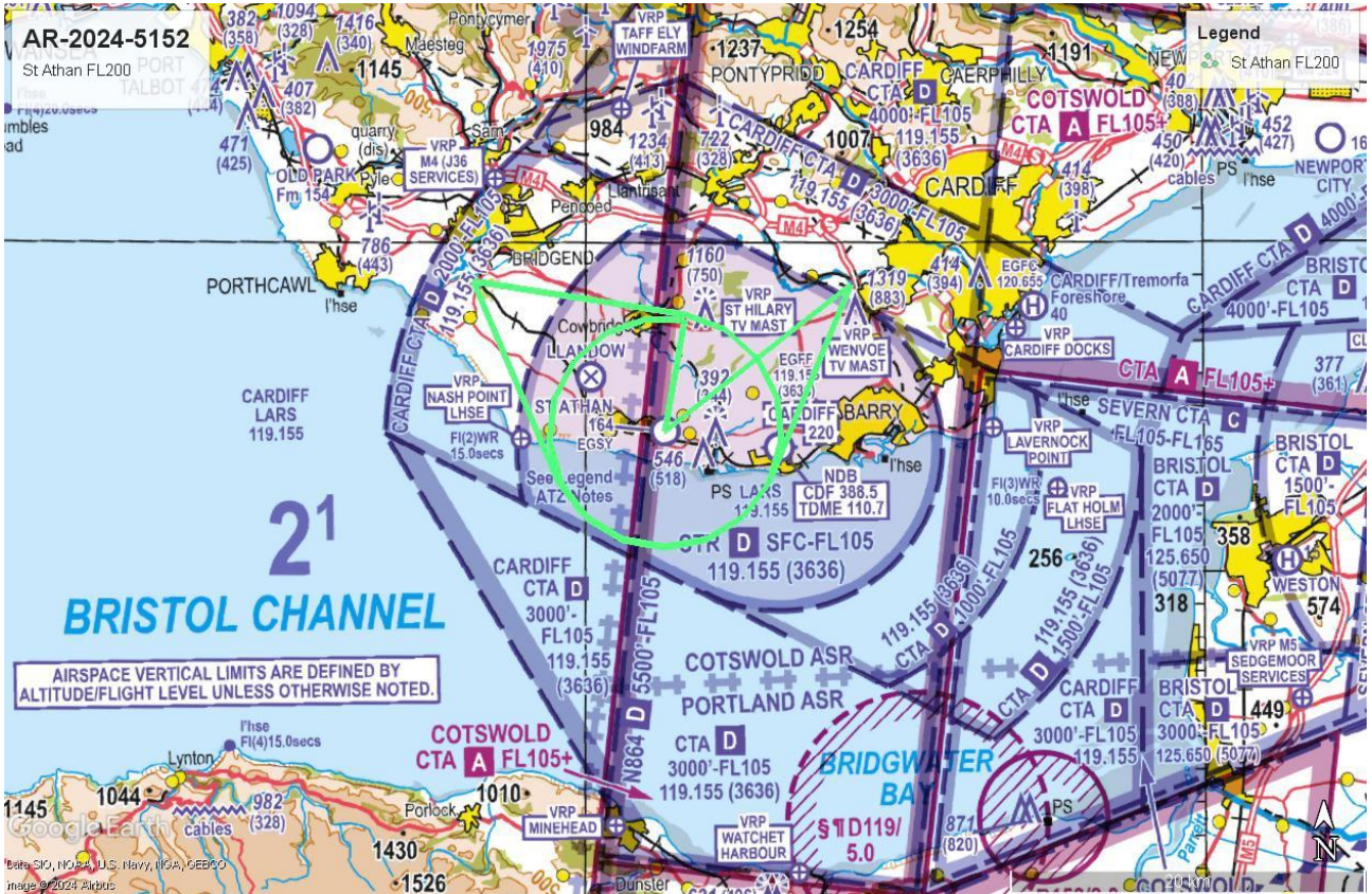
Chart – 3 (St Athan FL100)