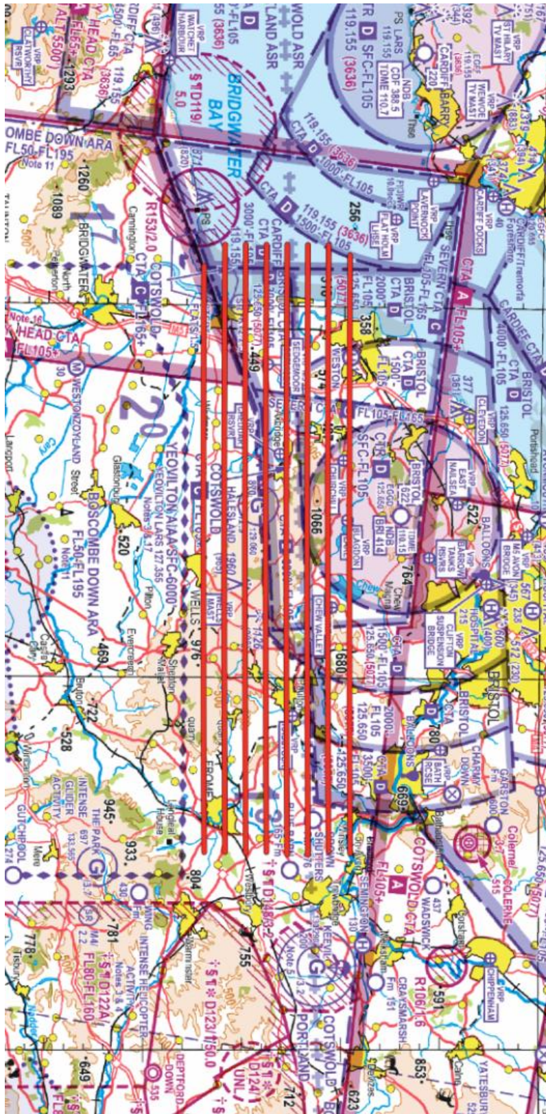
Chart 1 – Overview Bristol Area

27. Charts highlighting the area of operation are shown below. These are for illustrative purposes only and not for operational planning. Flightlines do not display a teardrop turn extending 5nm after flightline.