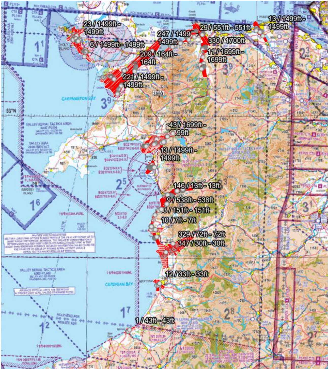
Chart 1 - Overview

29. Charts highlighting the area of operation are shown below. These are for illustrative purposes only and not for operational planning. Flight lines do not include 5km procedural teardrop turn at end of runs.