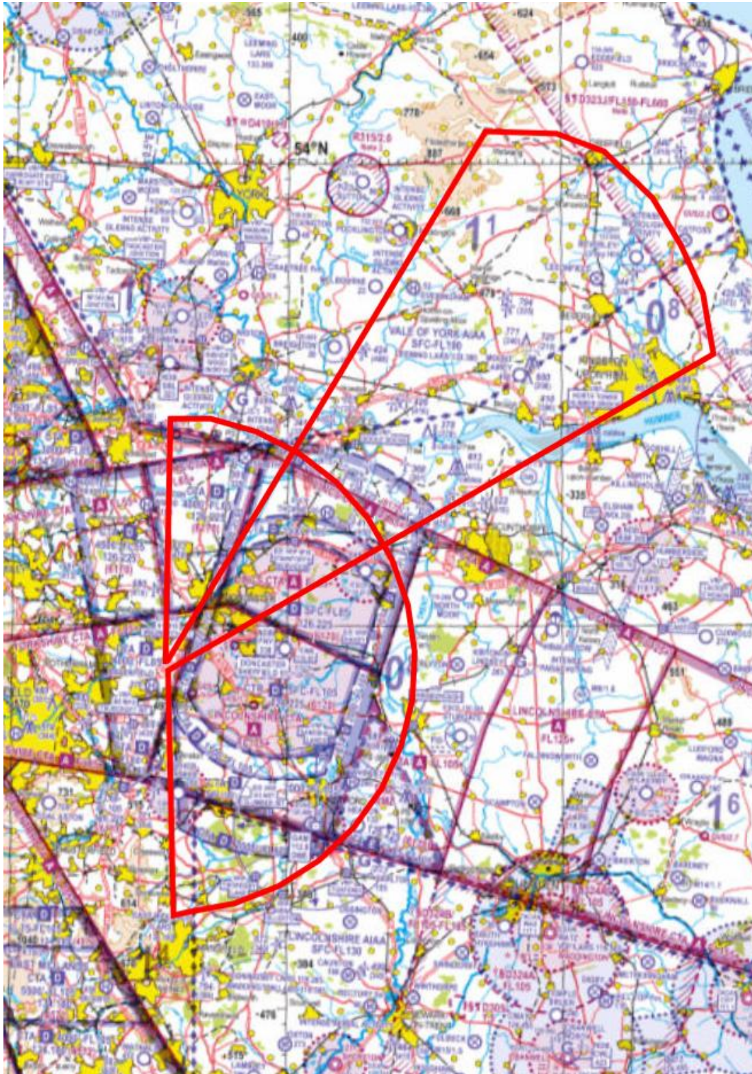
Chart 1 – Area of operation

The chart highlighting the area of operation are shown below. These are for illustrative purposes only and not for operational planning. Runs shown do not include procedural ~5nm turn to position for each survey leg.