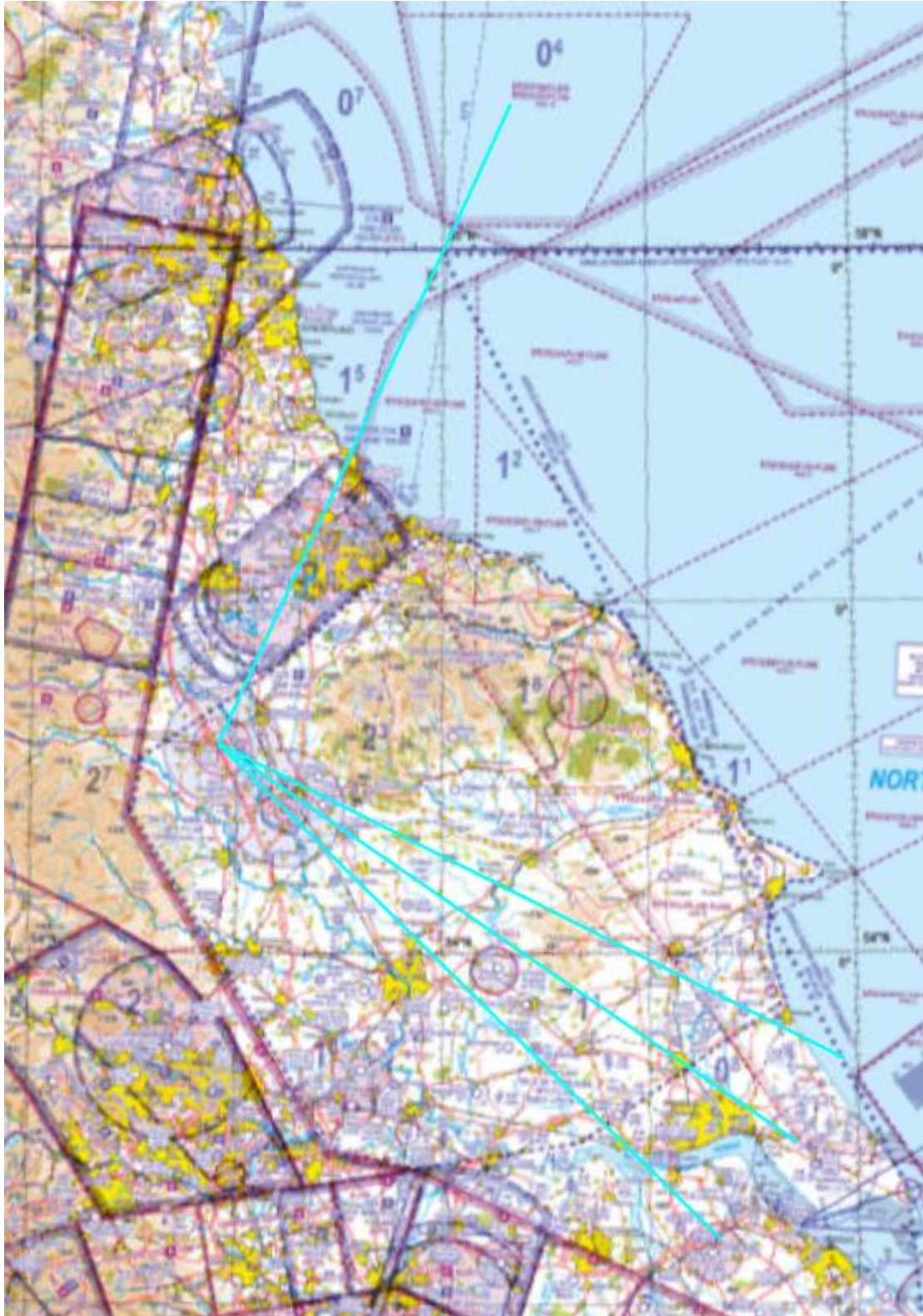
Chart 1 – Overview

30. Charts highlighting the area of operation are shown below. These are for illustrative purposes only and not for operational planning.