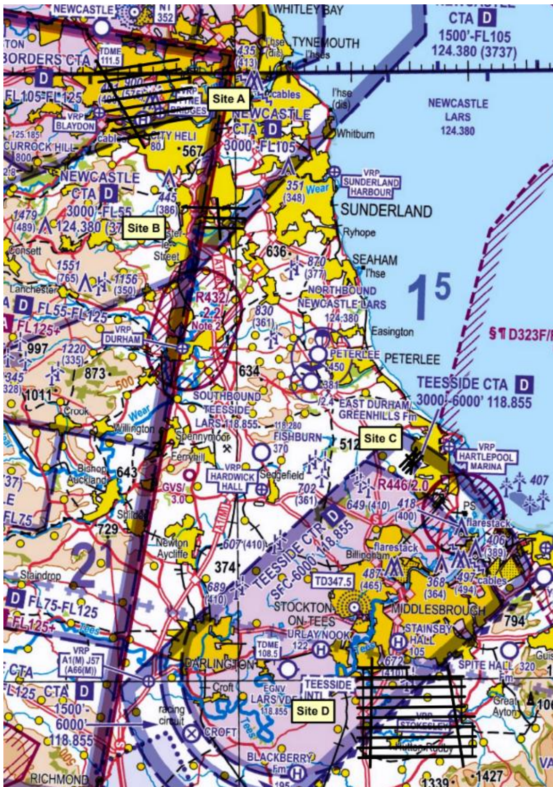
Chart 1 – Area Overview – Areas A-D – 3000 – 6000ft

24. Charts highlighting the area of operation are shown below. These are for illustrative purposes only and not for operational planning. Flight lines do not include a 5km procedural teardrop turn at the end of each run.