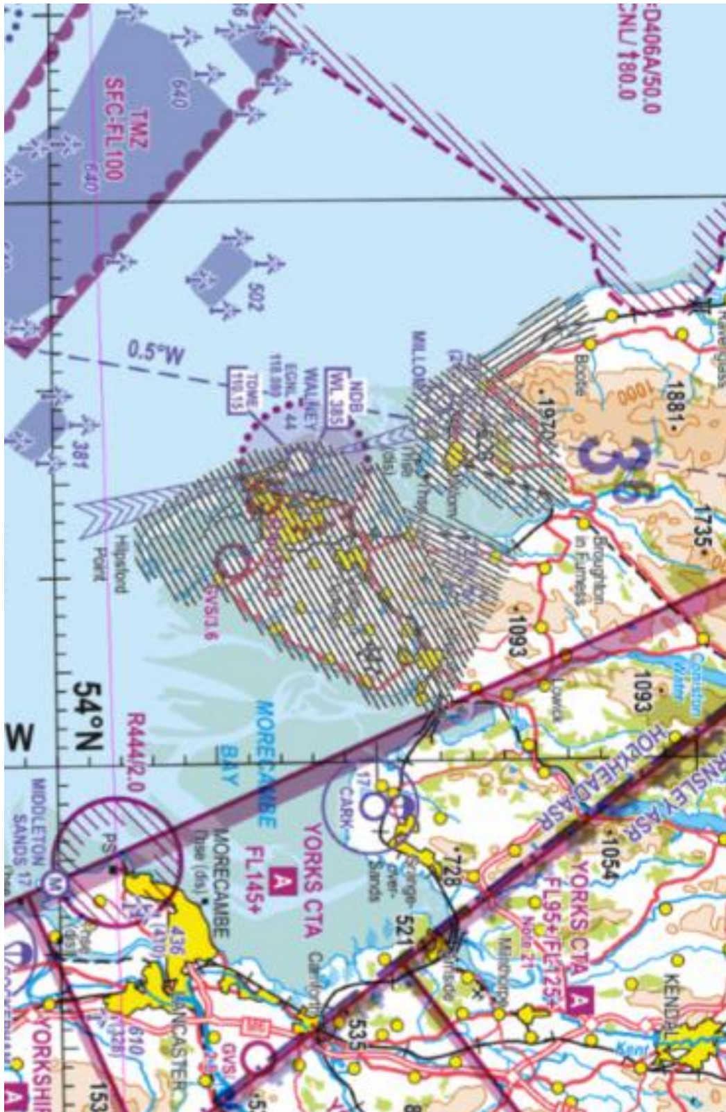
Chart 1 – Overview

24. Charts highlighting the area of operation are shown below. These are for illustrative purposes only and not for operational planning.