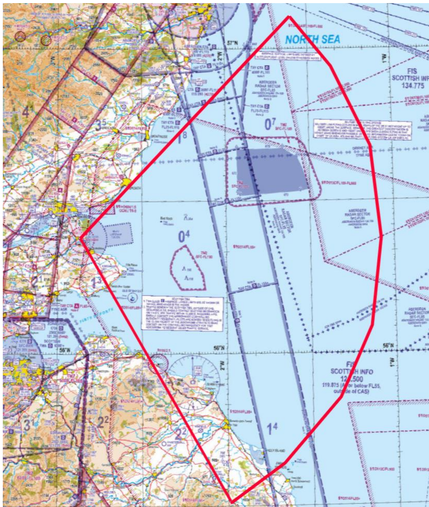
Chart 1 – Overview

33. Charts highlighting the area of operation are shown below. These are for illustrative purposes only and not for operational planning.