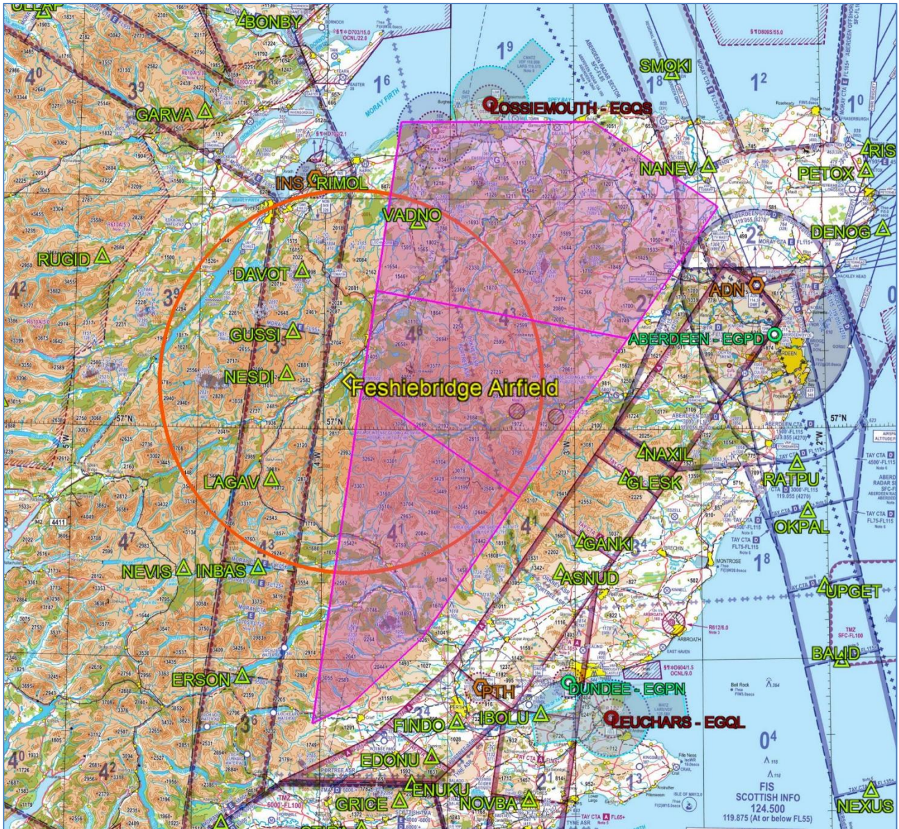
Chart 1 – Overview

21. Charts highlighting the area of operation are shown below. These are for illustrative purposes only and not for operational planning.