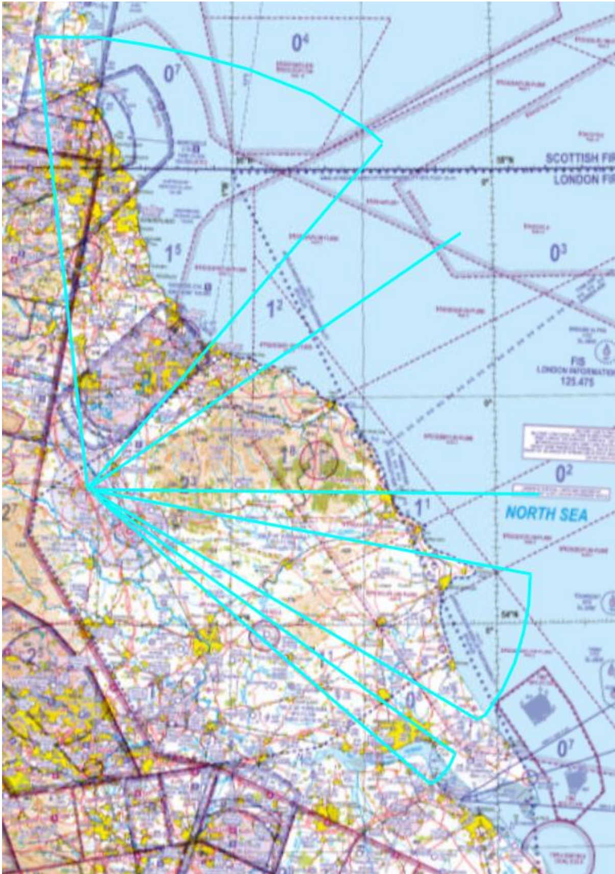
Chart 1 – Overview

33. Charts highlighting the area of operation are shown below. These are for illustrative purposes only and not for operational planning.