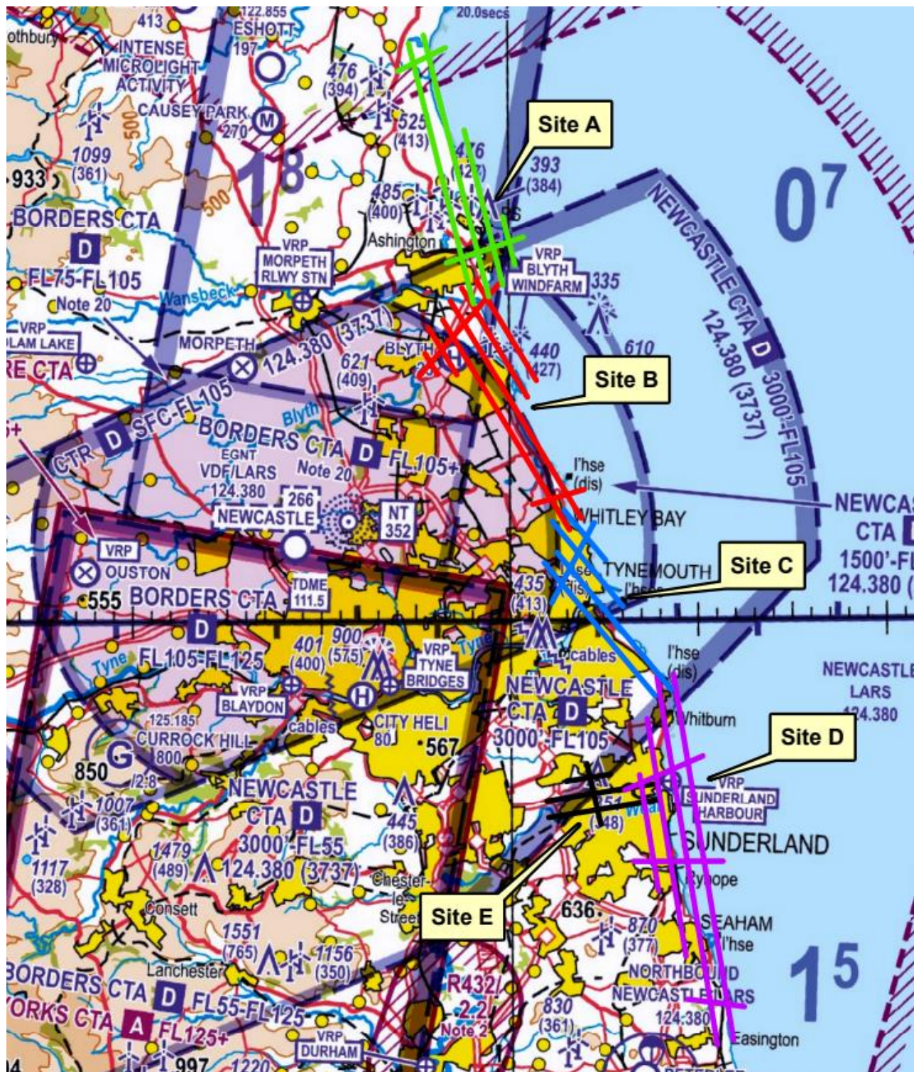
Chart 1 – Area Overview - Newcastle

24. Charts highlighting the area of operation are shown below. These are for illustrative purposes only and not for operational planning. Flight lines do not include a 5km procedural teardrop turn at the end of each run.