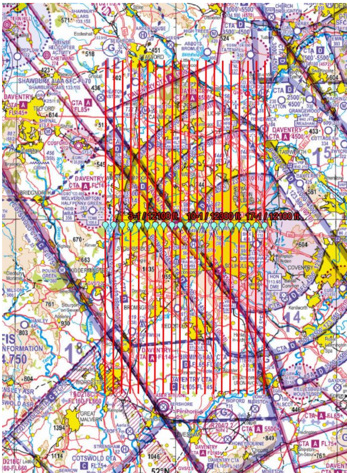
Chart 1 – Area of operation

The chart highlighting the area of operation are shown below. These are for illustrative purposes only and not for operational planning. Runs shown do not include procedural ~5nmi turn to position for each survey leg.