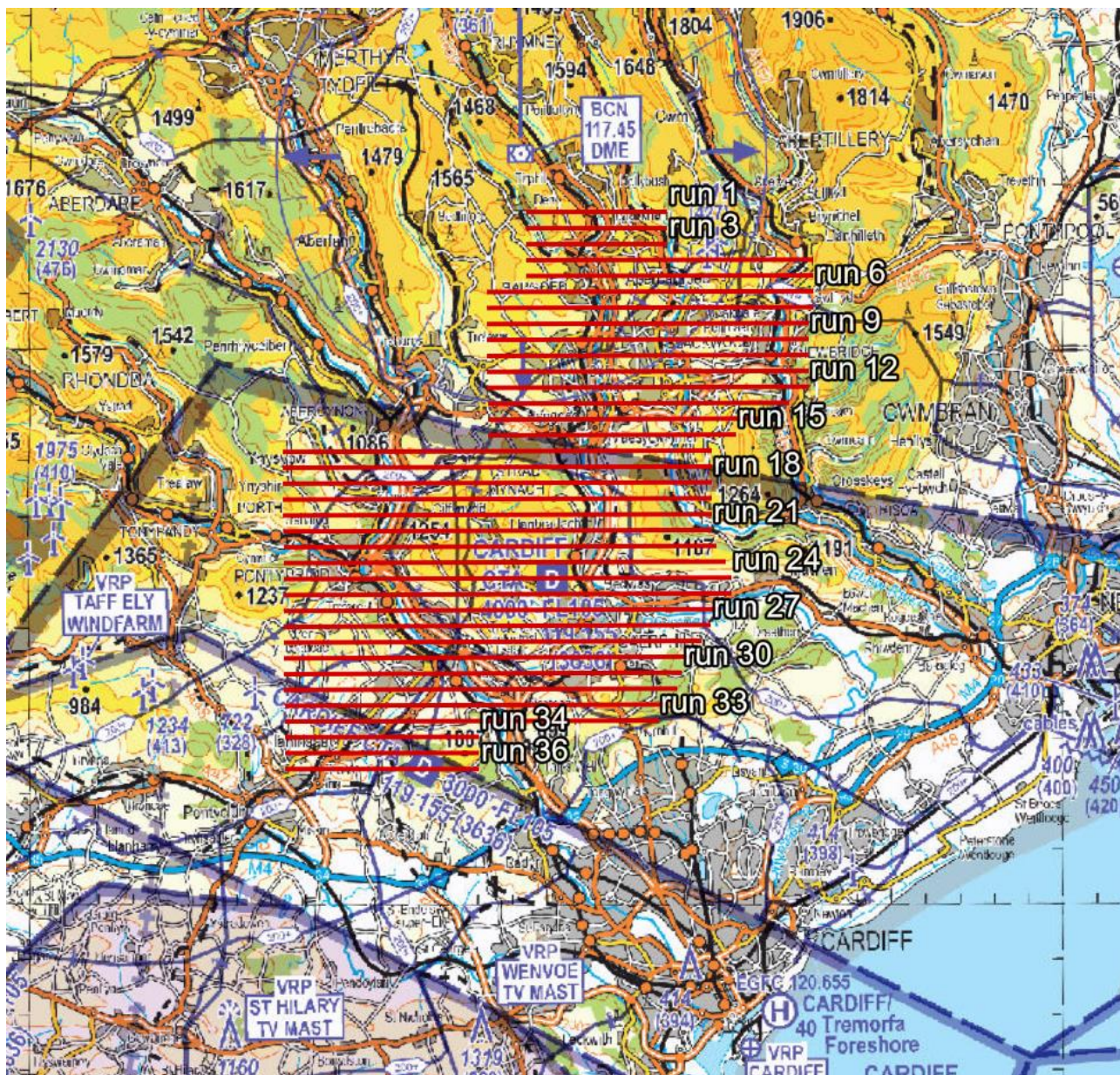
Chart 1 – Overview

29. Charts highlighting the area of operation are shown below. These are for illustrative purposes only and not for operational planning.