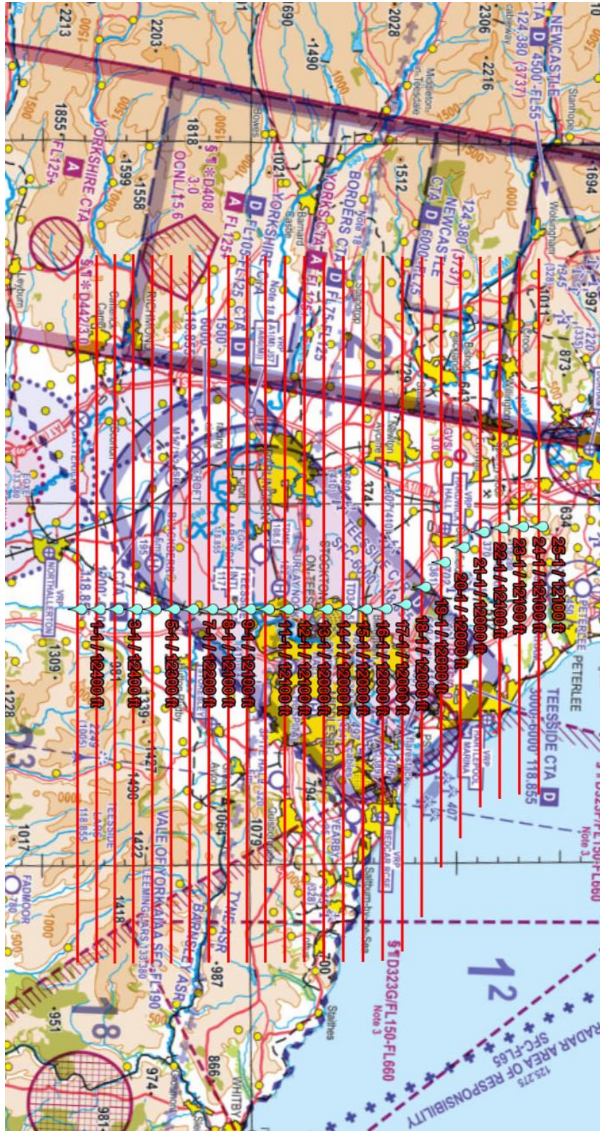
Chart 1 – Overview

Charts highlighting the area of operation are shown below. These are for illustrative purposes only and not for operational planning.