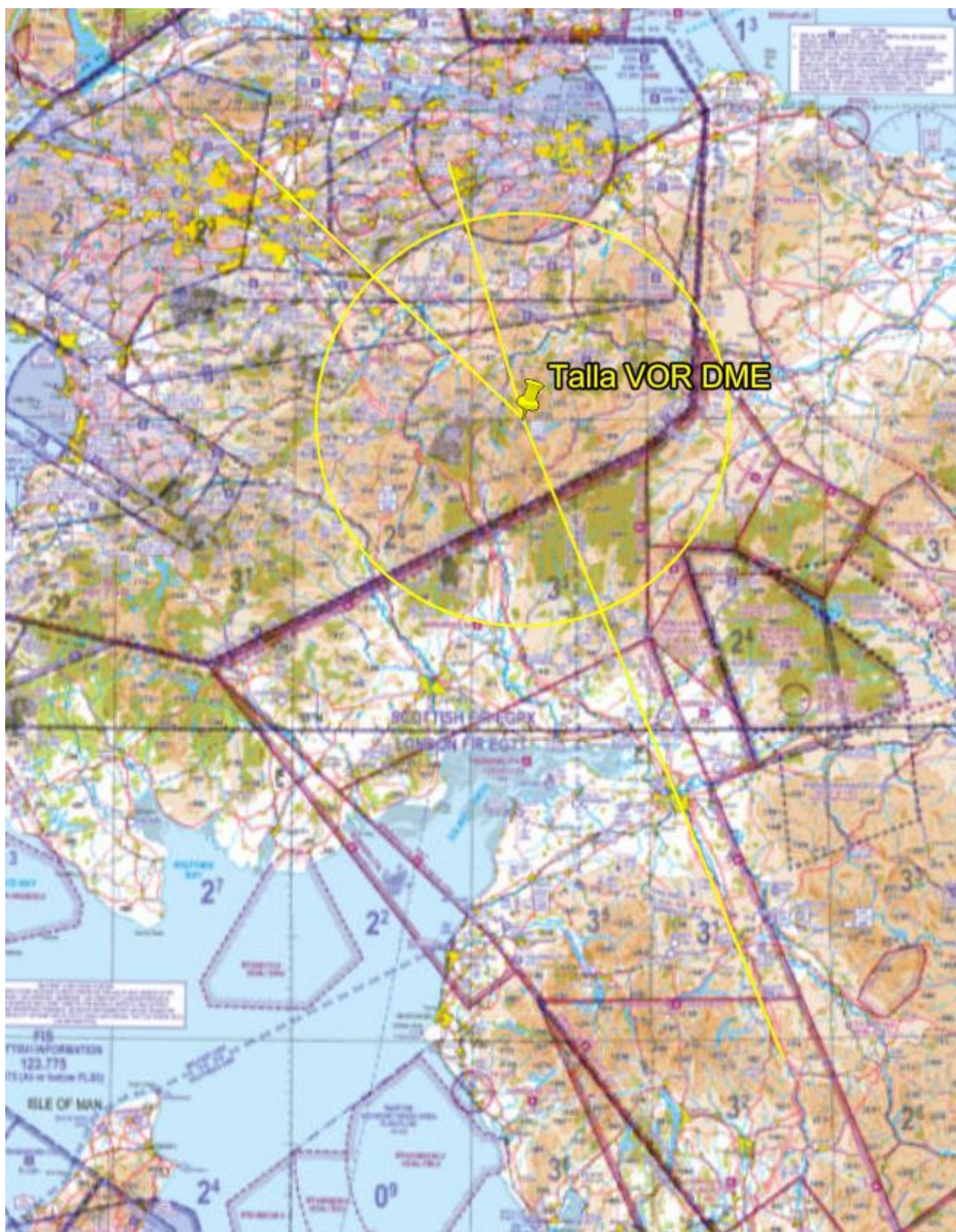
Chart 1 – Overview

22. Charts highlighting the area of operation are shown below. This is for illustrative purposes only and not for operational planning.