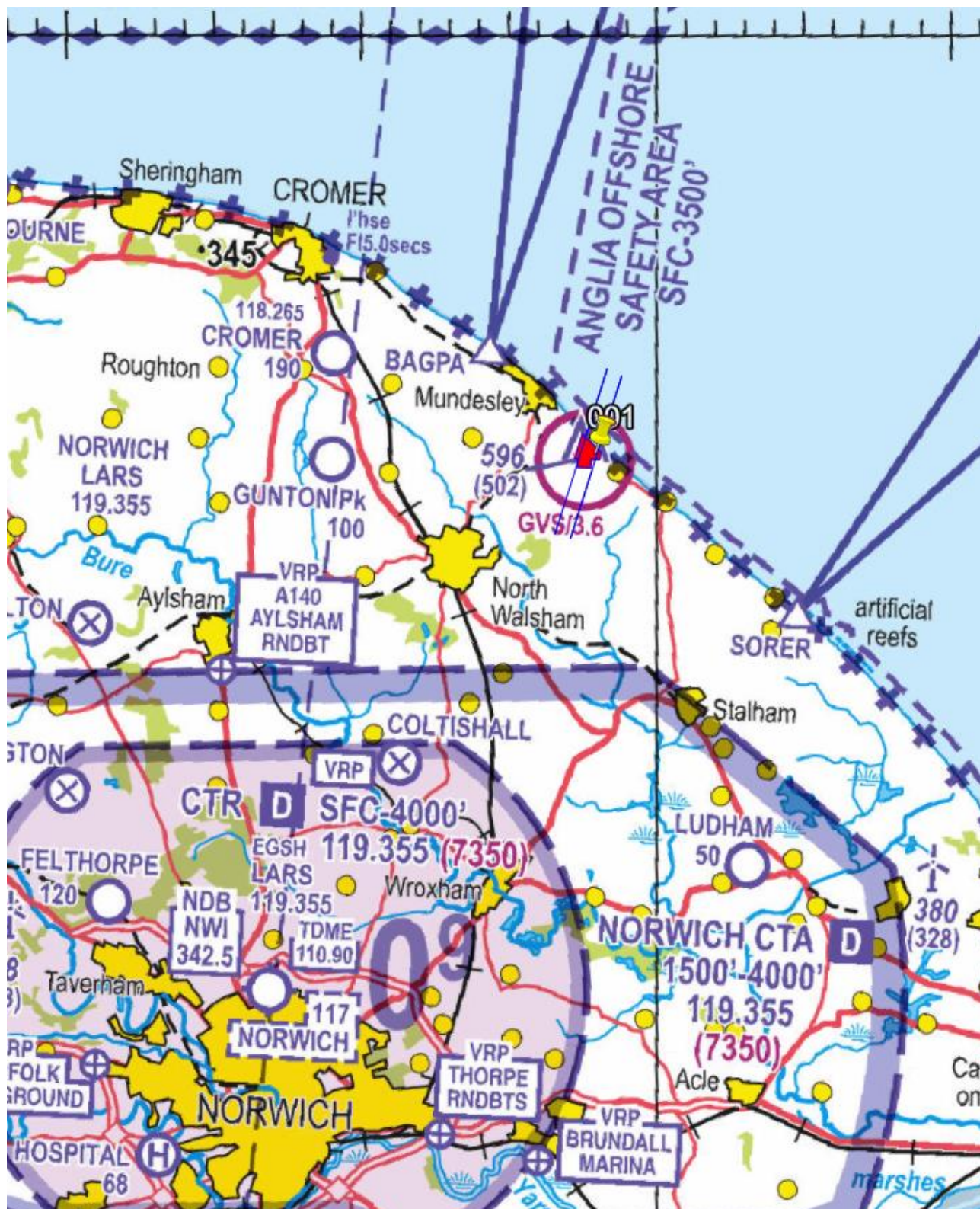
Chart 2 – Overview