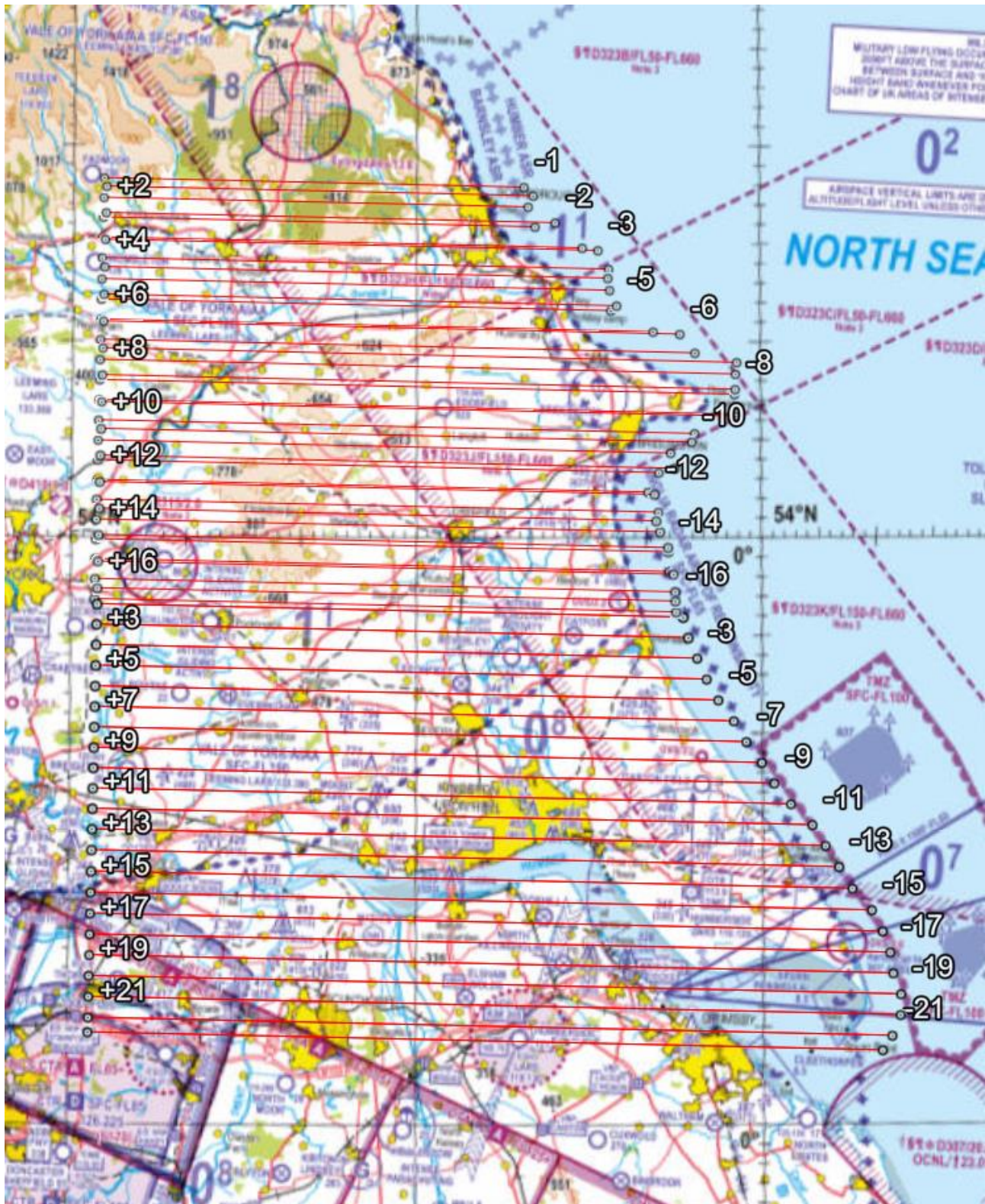
Chart 1 – Overview

27. Charts highlighting the area of operation are shown below. These are for illustrative purposes only and not for operational planning.