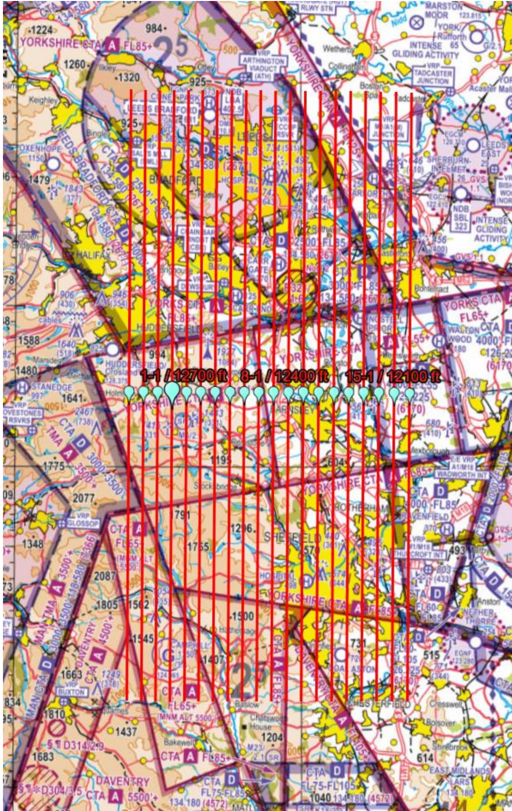
Chart 1 – Overview

29. Charts highlighting the area of operation are shown below. These are for illustrative purposes only and not for operational planning.