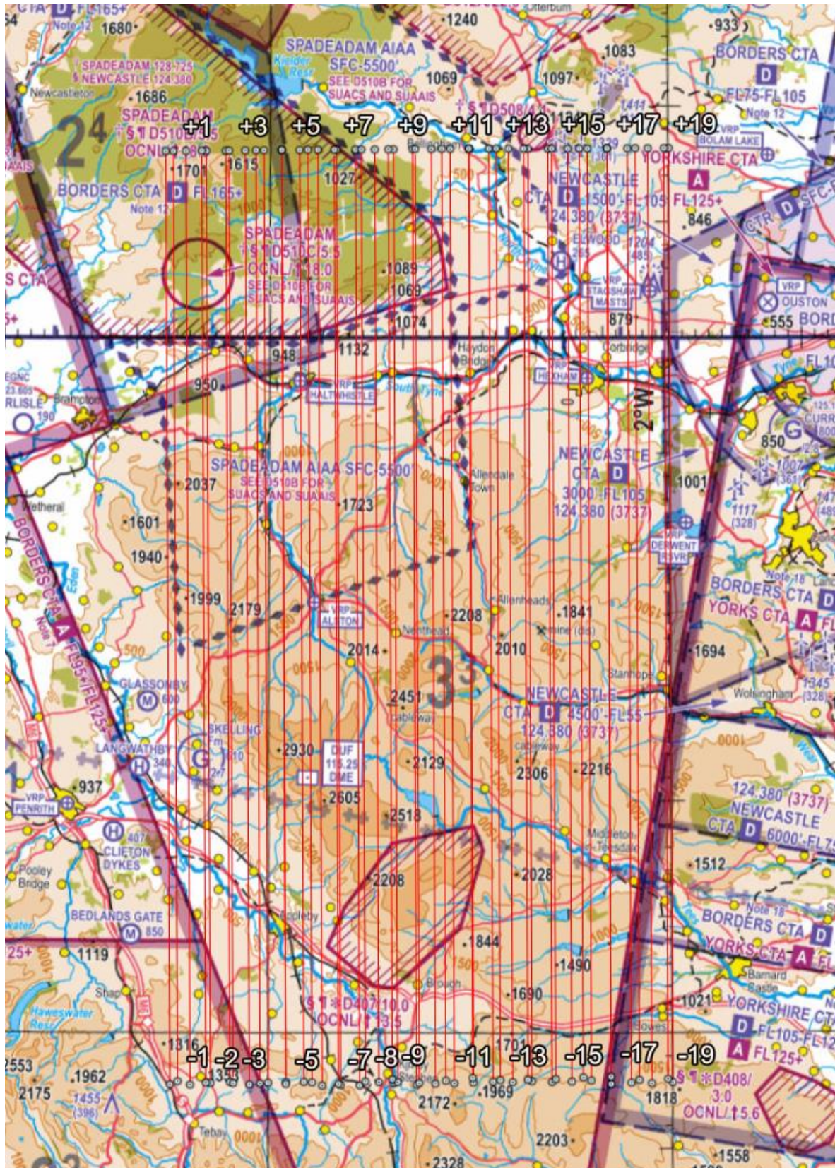
Chart 1 - Overview

27. Charts highlighting the area of operation are shown below. These are for illustrative purposes only and not for operational planning.