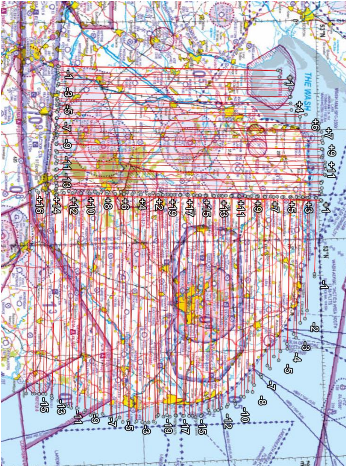
Chart 1 – Overview

27. Charts highlighting the area of operation are shown below. These are for illustrative purposes only and not for operational planning.