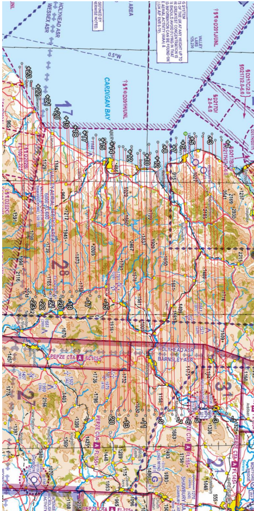
Chart 1 – Overview

27. Charts highlighting the area of operation are shown below. These are for illustrative purposes only and not for operational planning.