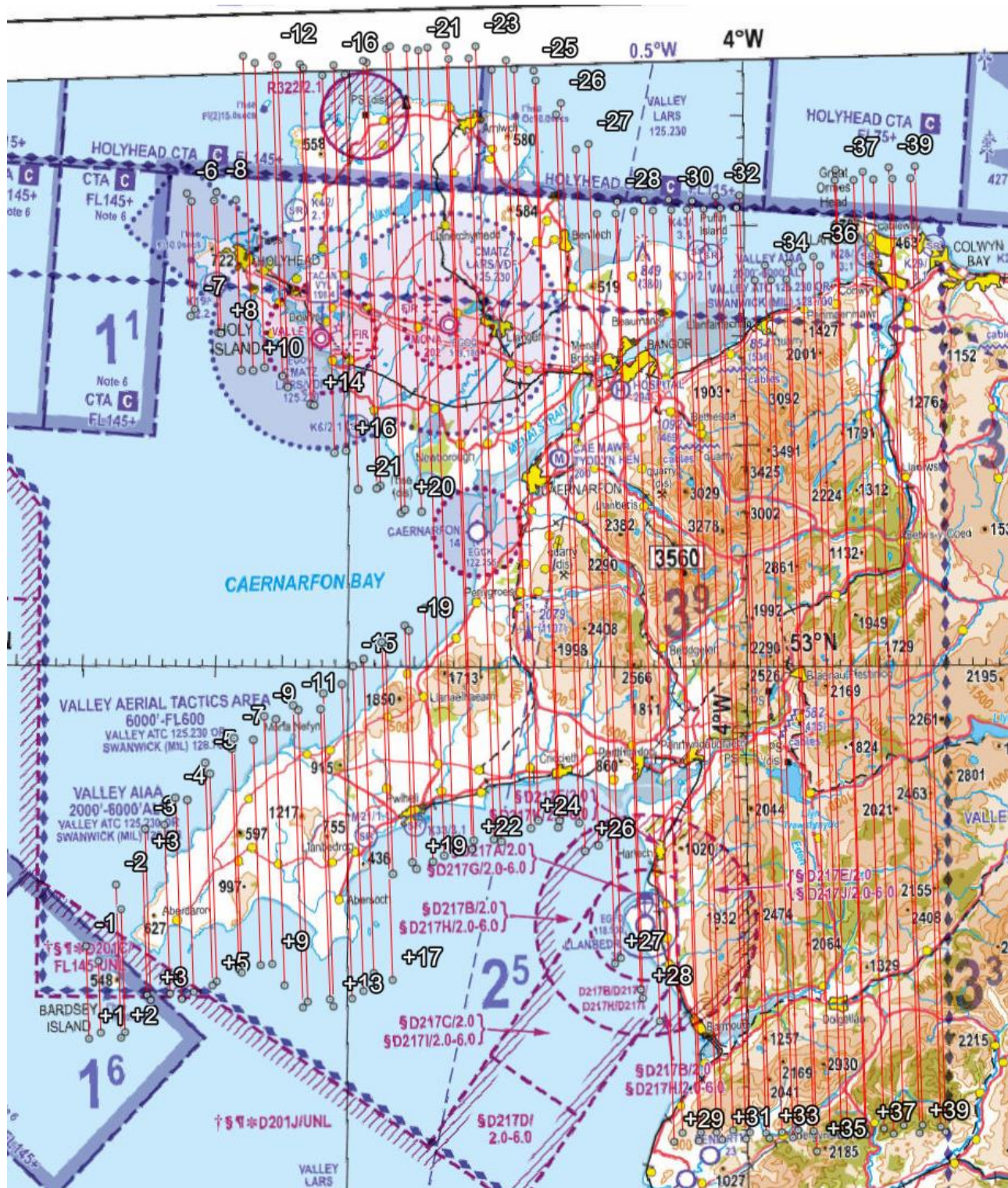
Chart 1 – Overview

27. Charts highlighting the area of operation are shown below. These are for illustrative purposes only and not for operational planning.