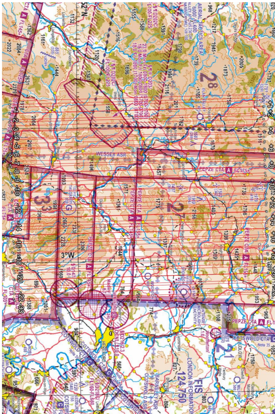
Chart 1 – Overview

27. Charts highlighting the area of operation are shown below. These are for illustrative purposes only and not for operational planning.