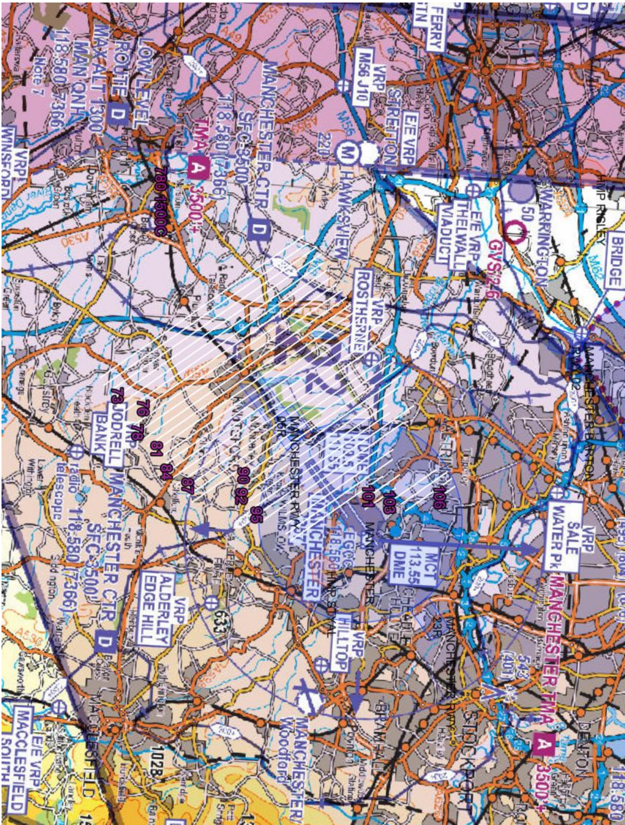
Chart 1 - Overview

Charts highlighting the area of operation are shown below. These are for illustrative purposes only and not for operational planning. Flight lines shown on charts below do not display c.5 nm