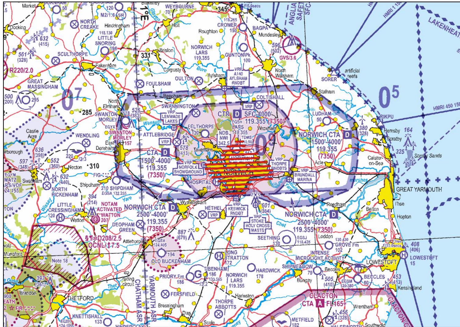
Chart 1 – Overview