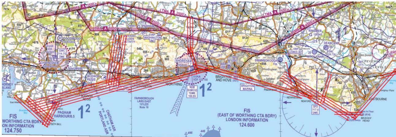
Chart 1 – Selsey Bill to Beachy Head

28. Charts highlighting the area of operation are shown below. These are for illustrative purposes only and not for operational planning. Flightlines do not include a 5km procedural teardrop turn at the end of each run.