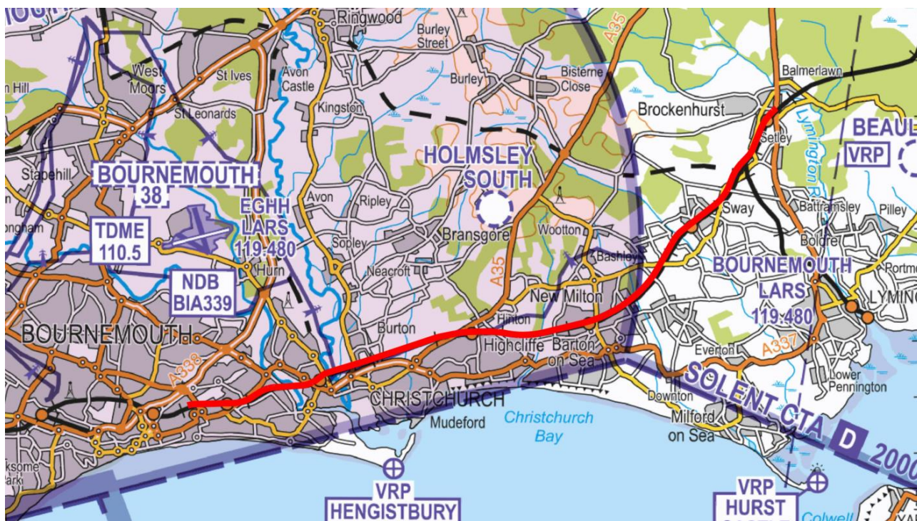
Chart 2 – Route LSEC