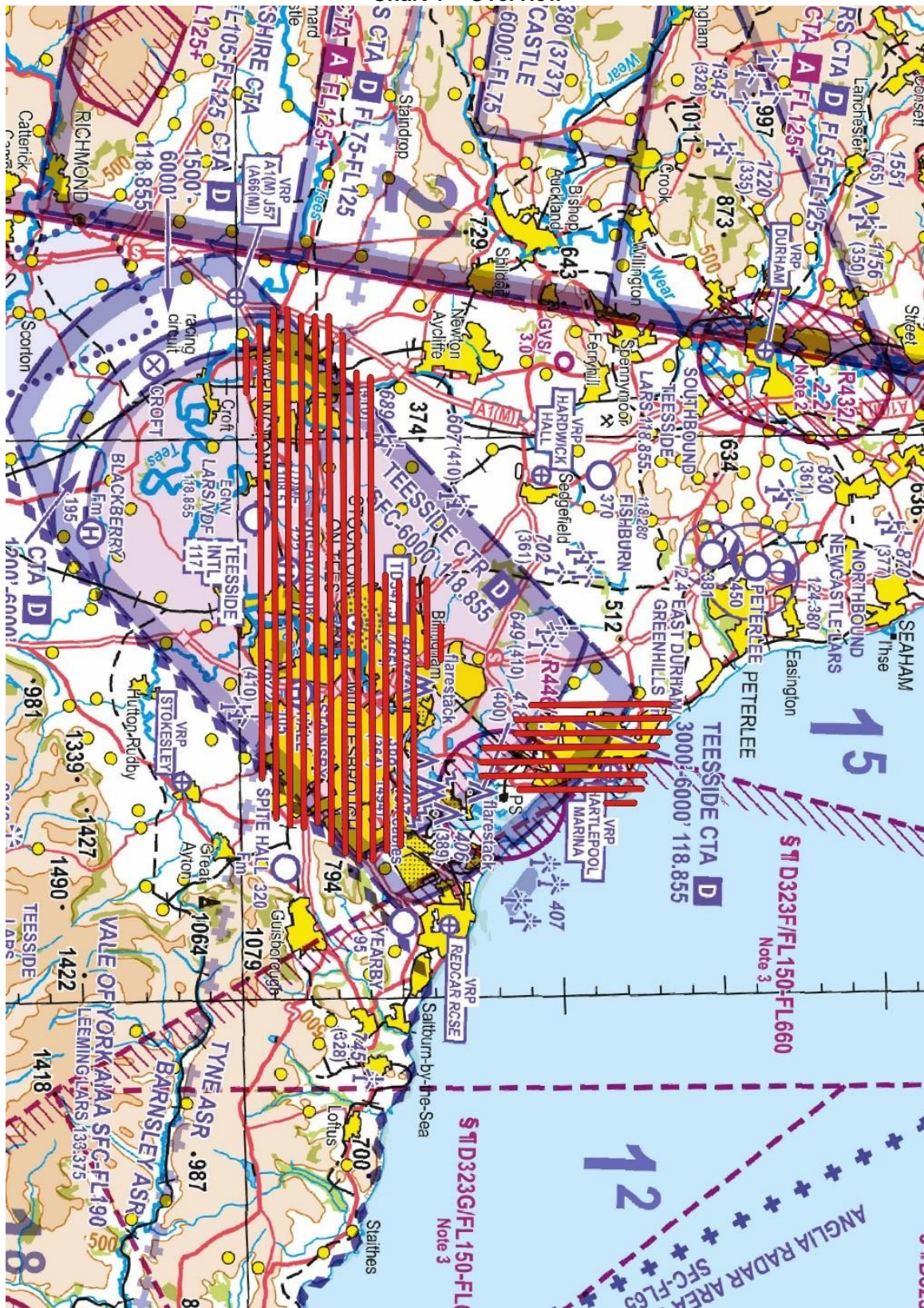
Chart 1 – Overview

25. Charts highlighting the area of operation are shown below. These are for illustrative purposes only and not for operational planning. Flight lines do not include a 5nm procedural teardrop turn at the end of each run.