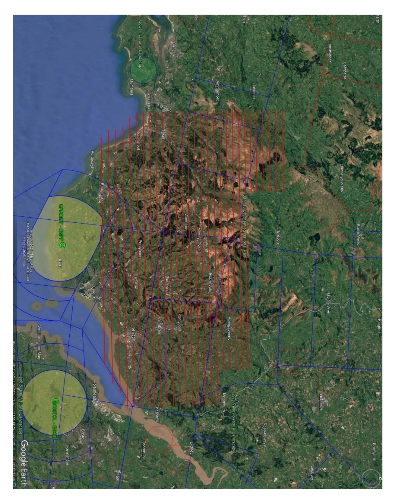
Chart 2 – Airspace Overview