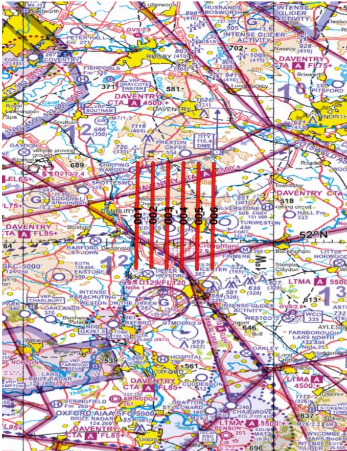
Chart 1 – Revised area of operation

The chart highlighting the area of operation are shown below. These are for illustrative purposes only and not for operational planning. Runs shown do not include procedural ~5nmi turn to position for each survey leg.