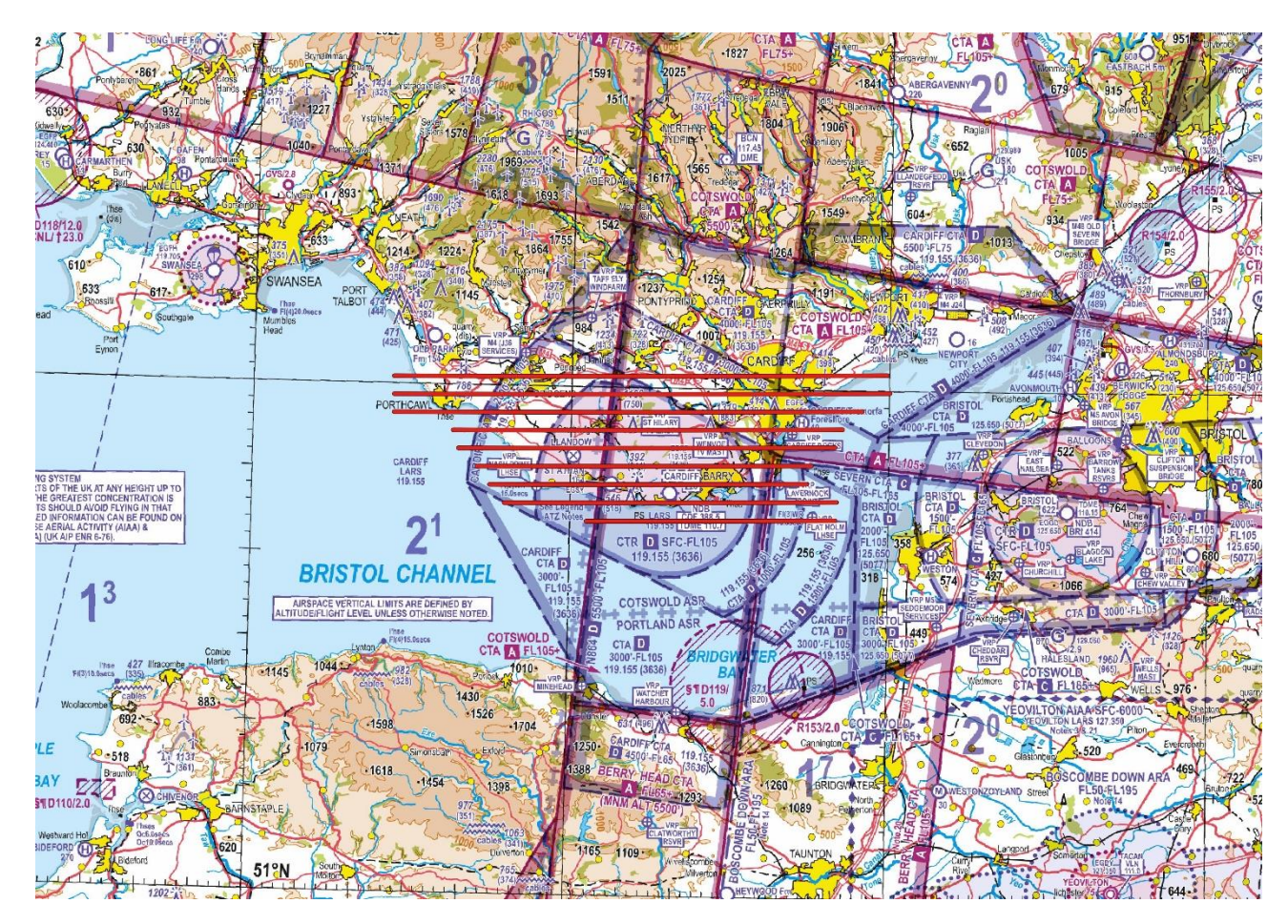
Chart 1 – Area of operation

The chart highlighting the area of operation are shown below. These are for illustrative purposes only and not for operational planning. Runs shown do not include procedural ~5nmi turn to position for each survey leg.