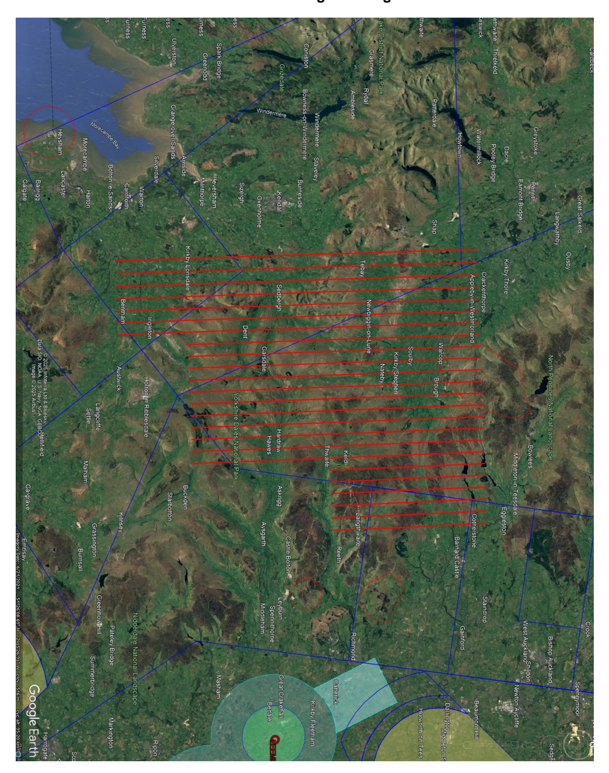
Chart 2 – Satellite image with flight lines