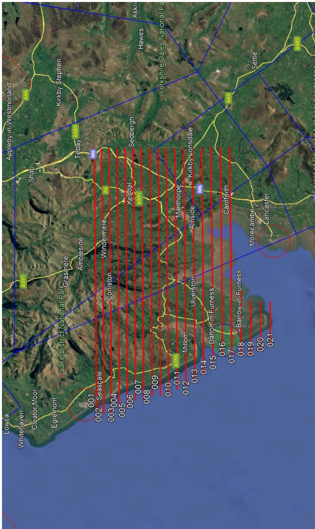
Chart 2 – Satellite image with flight lines