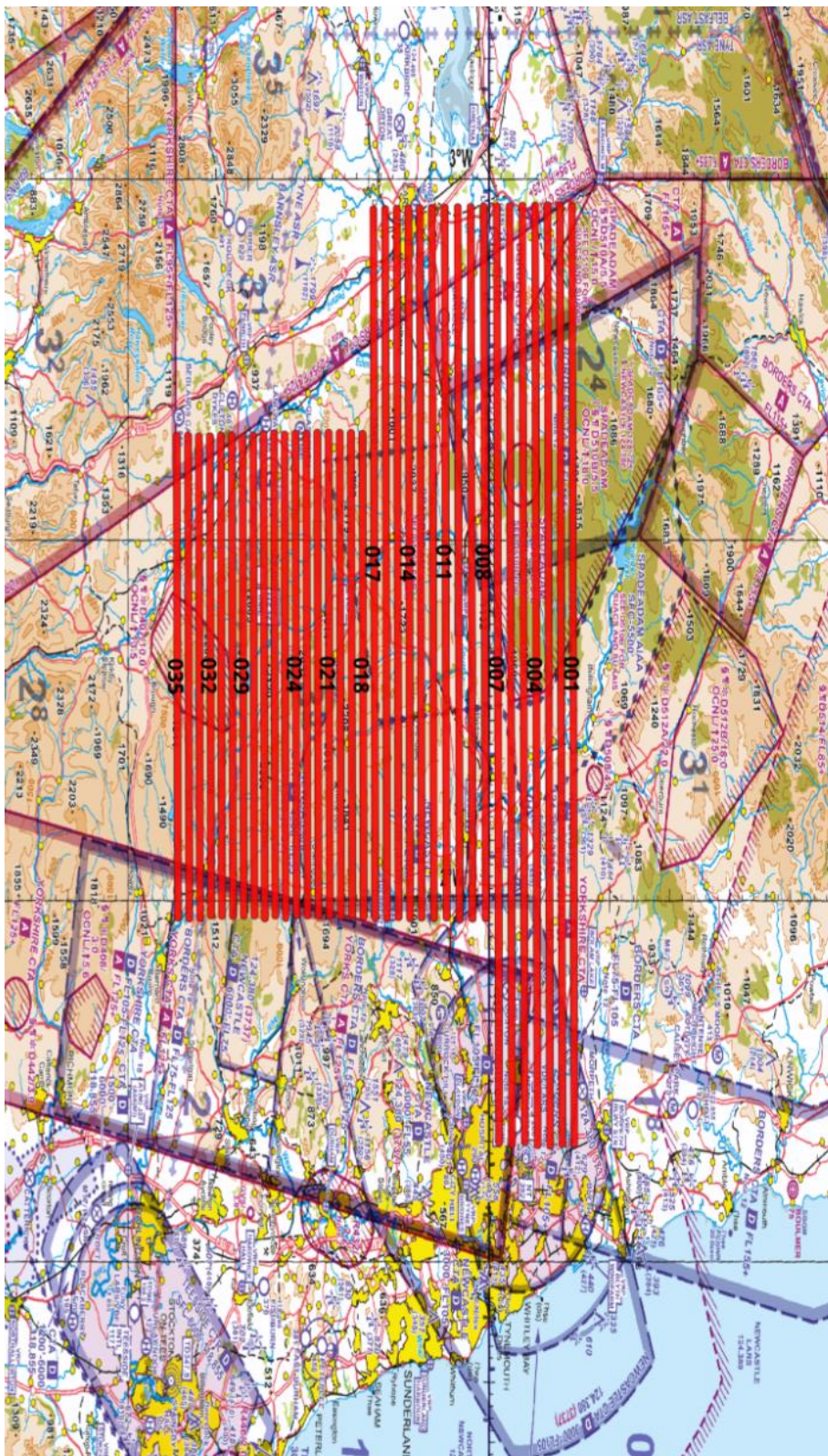
Chart 1 – Revised area of operation

The chart highlighting the area of operation are shown below. These are for illustrative purposes only and not for operational planning. Runs shown do not include procedural ~5nm turn to position for each survey leg.