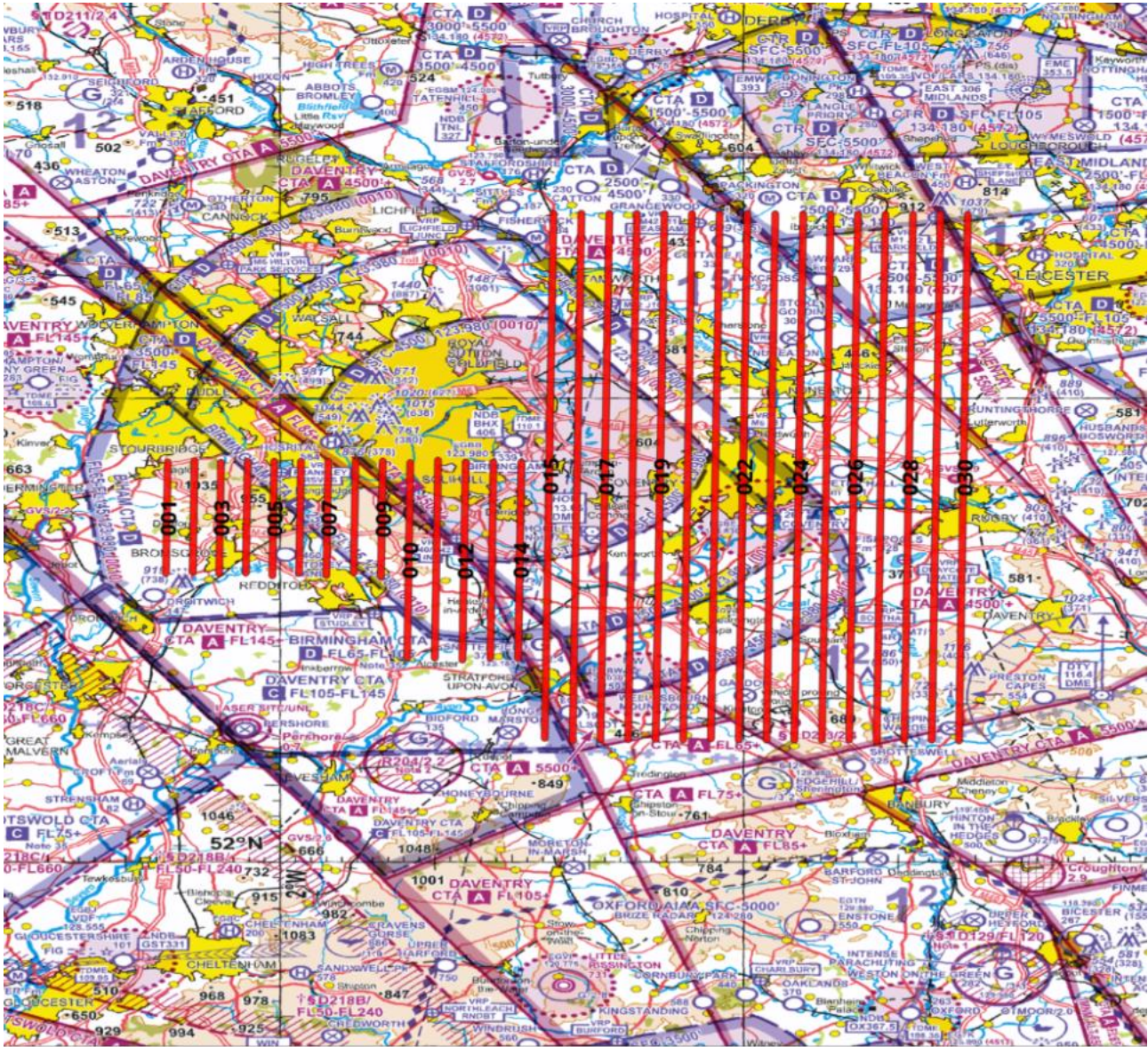
Chart 1 – Revised area of operation

The chart highlighting the area of operation are shown below. These are for illustrative purposes only and not for operational planning. Runs shown do not include procedural ~5nm turn to position for each survey leg.