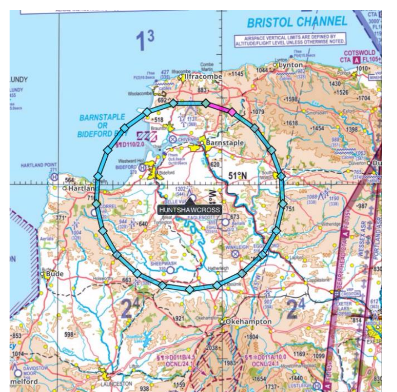
Chart 2 – 20 Km