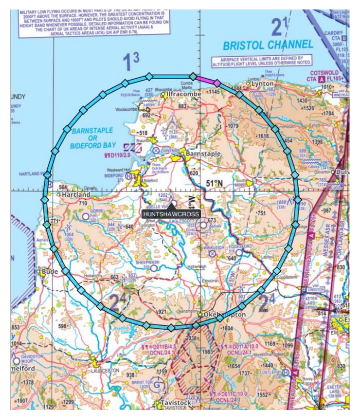
Chart 3 – 30 Km