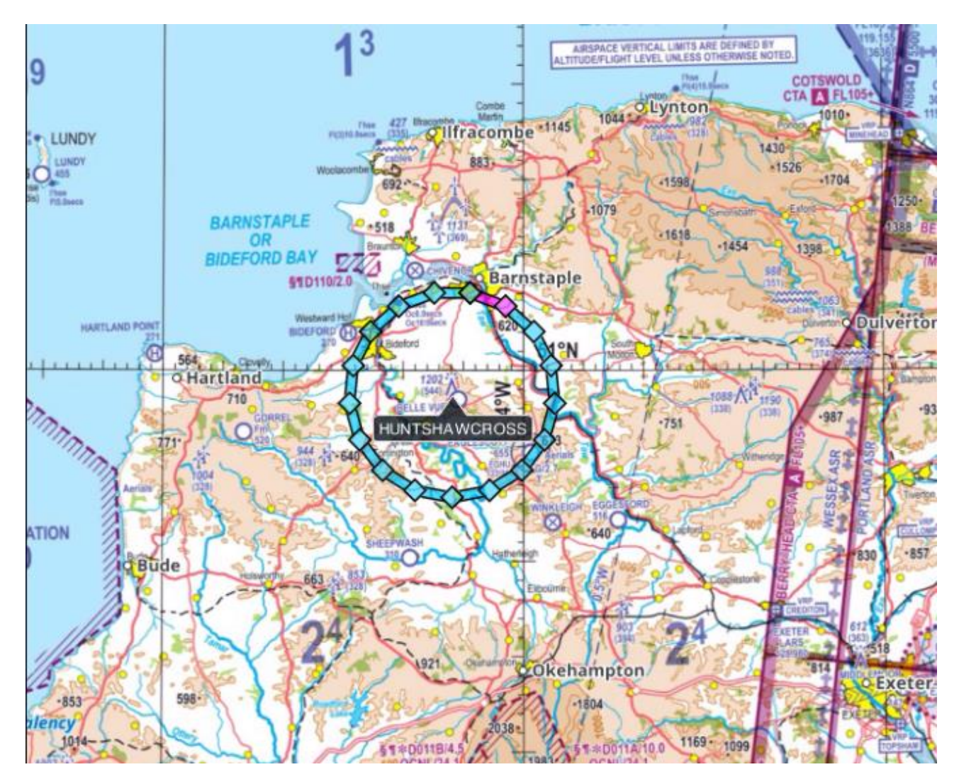
Chart 1 - 10 Km

32. Charts highlighting the area of operation are shown below. These are for illustrative purposes only and not for operational planning.