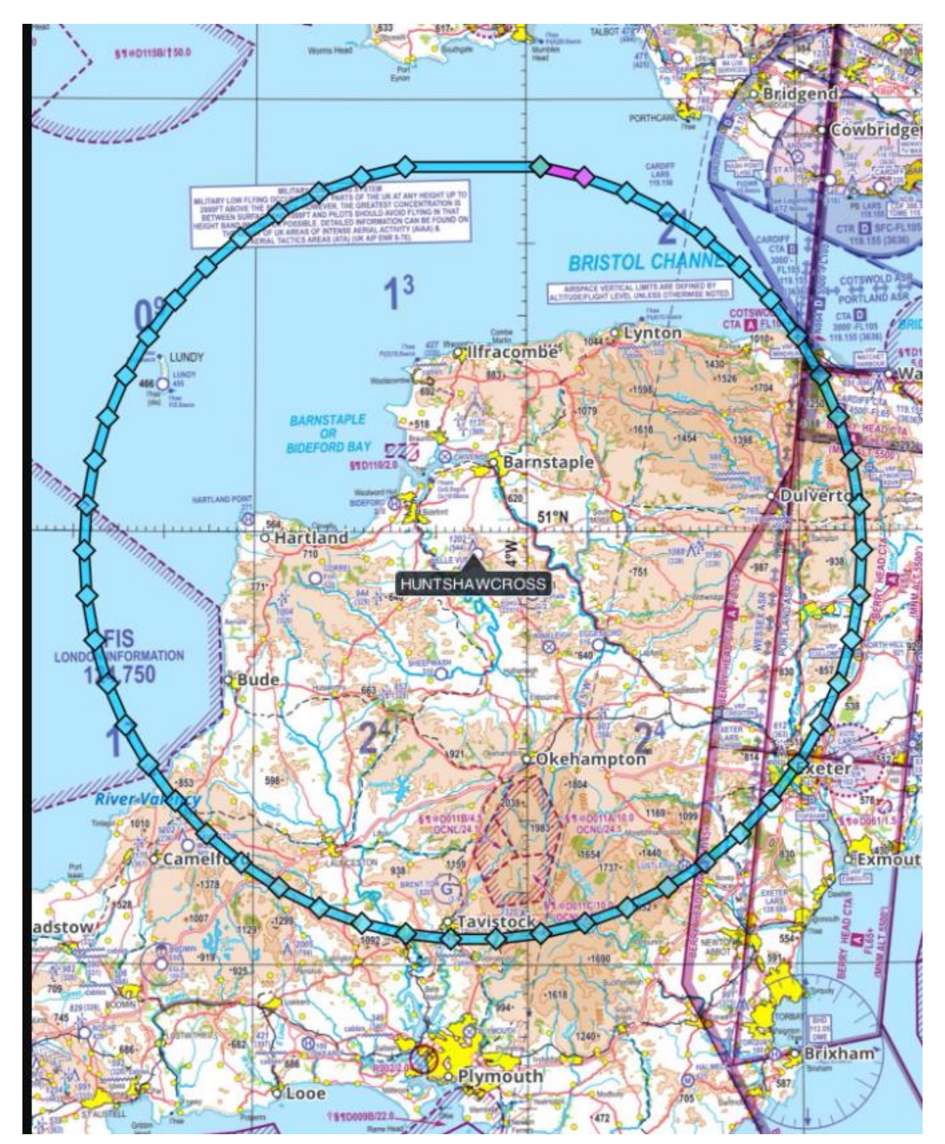
Chart 4 – 50 Km