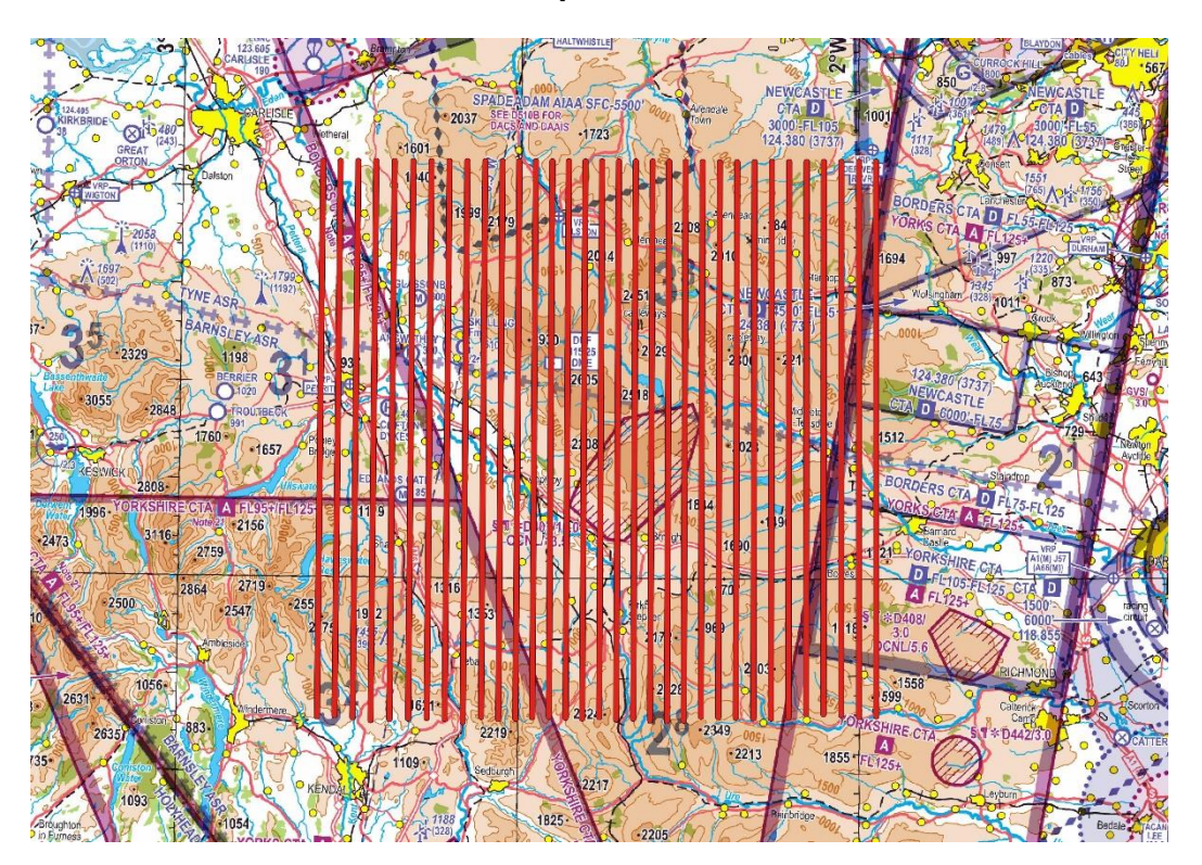
Chart 3 – 50K Grid Option Matched Orientation