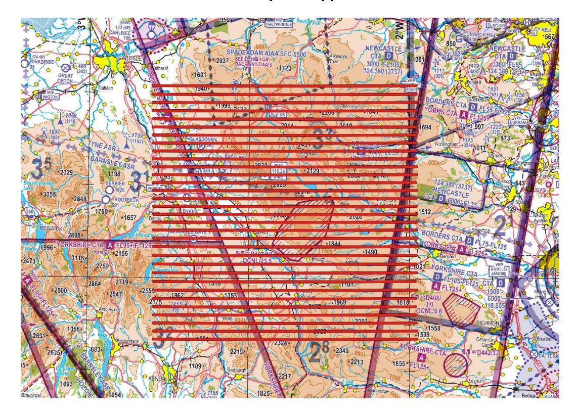
Chart 4 – 50K Grid Option Opposite Orientation