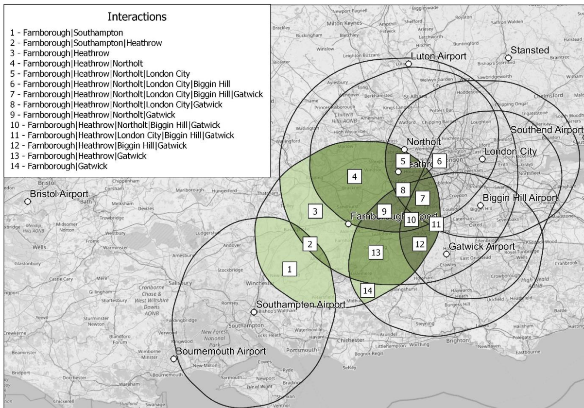
Chart 1 illustrates the sections of airspace below 7000ft. that are potentially in scope for the new Farnborough ACP and the areas where design interdependencies may arise with other LTMA airport-led proposals.

Farnborough Airport engaged with ACOG during the development of Iteration 2 to discuss commencing a new ACP and highlighted the importance of alignment and integration with the existing LTMA proposals. ACOG envisaged that it would be necessary for a new Farnborough ACP to be coordinated with several interdependent airports and NERL. Following the submission of the SoN for the new ACP, ACOG updated the interdependency analysis conducted for Masterplan Iteration 2 to incorporate Farnborough. The updated analysis demonstrates that at this stage of the process, Farnborough Airport has potential design interdependencies in 14 specific areas of LTMA airspace below 7000ft. and, therefore, must coordinate the development of its new proposal with six of the existing LTMA ACPs (Heathrow, Gatwick, London City, Southampton, RAF Northolt and Biggin Hill). In addition, Farnborough will need to ensure ongoing coordination with the NERL-led LAMP network ACPs above 7000ft.