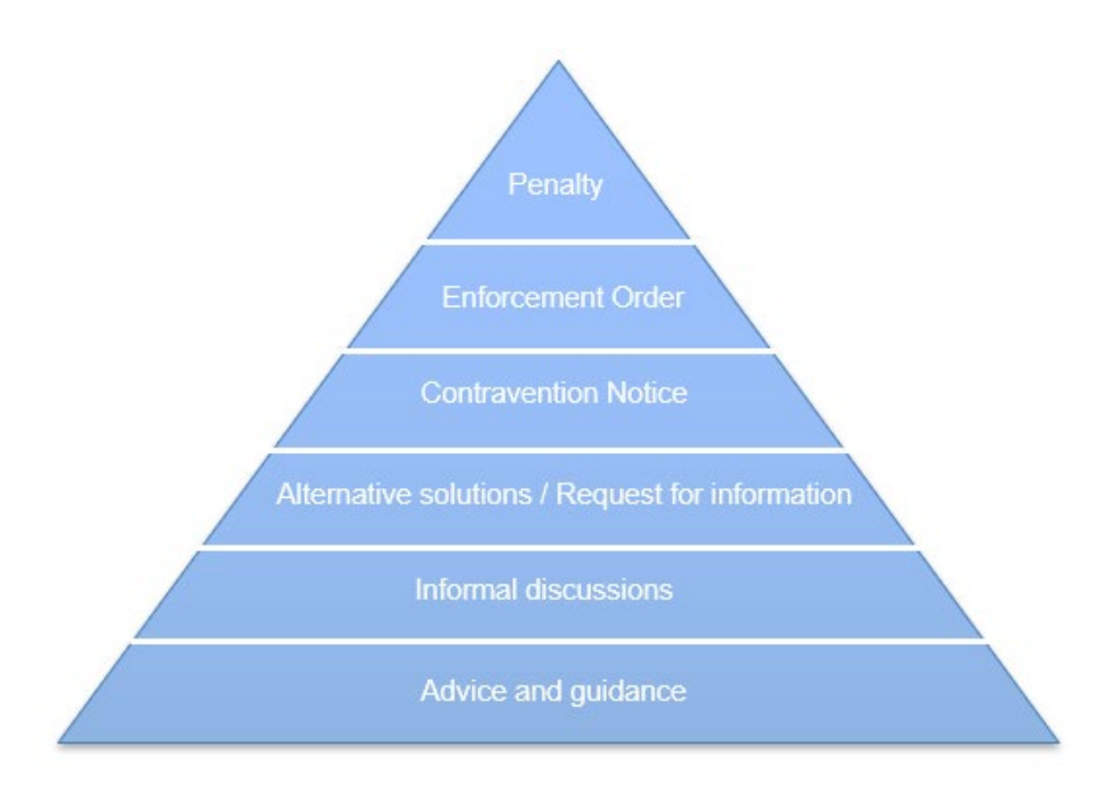
Figure B1 – Stages of Enforcement (illustrative only)