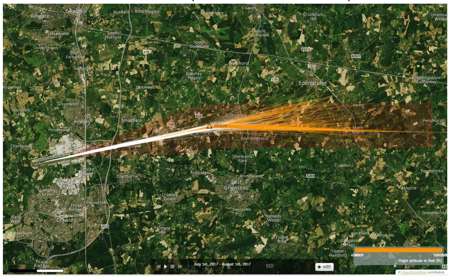
Orange plots show the points at which an aircraft was between 4000 and 5000ft altitude.