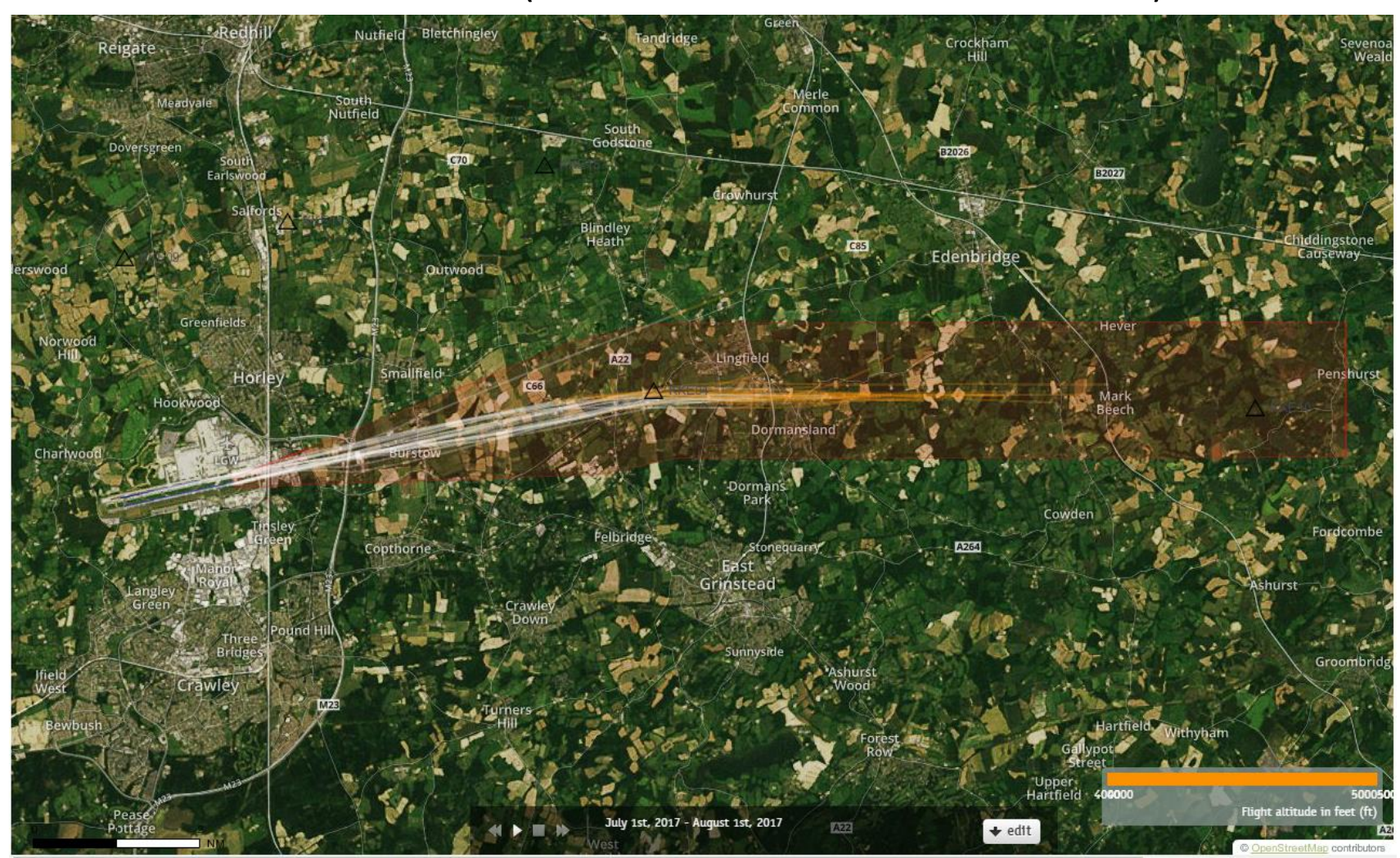
Orange plots show the points at which an aircraft was between 4000 and 5000ft altitude.