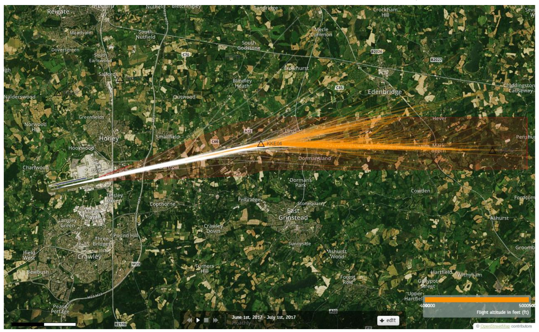
Orange plots show the points at which an aircraft was between 4000 and 5000ft altitude.