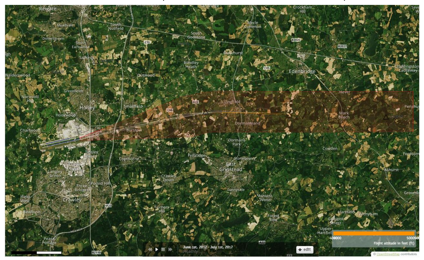
Orange plots show the points at which an aircraft was between 4000 and 5000ft altitude.