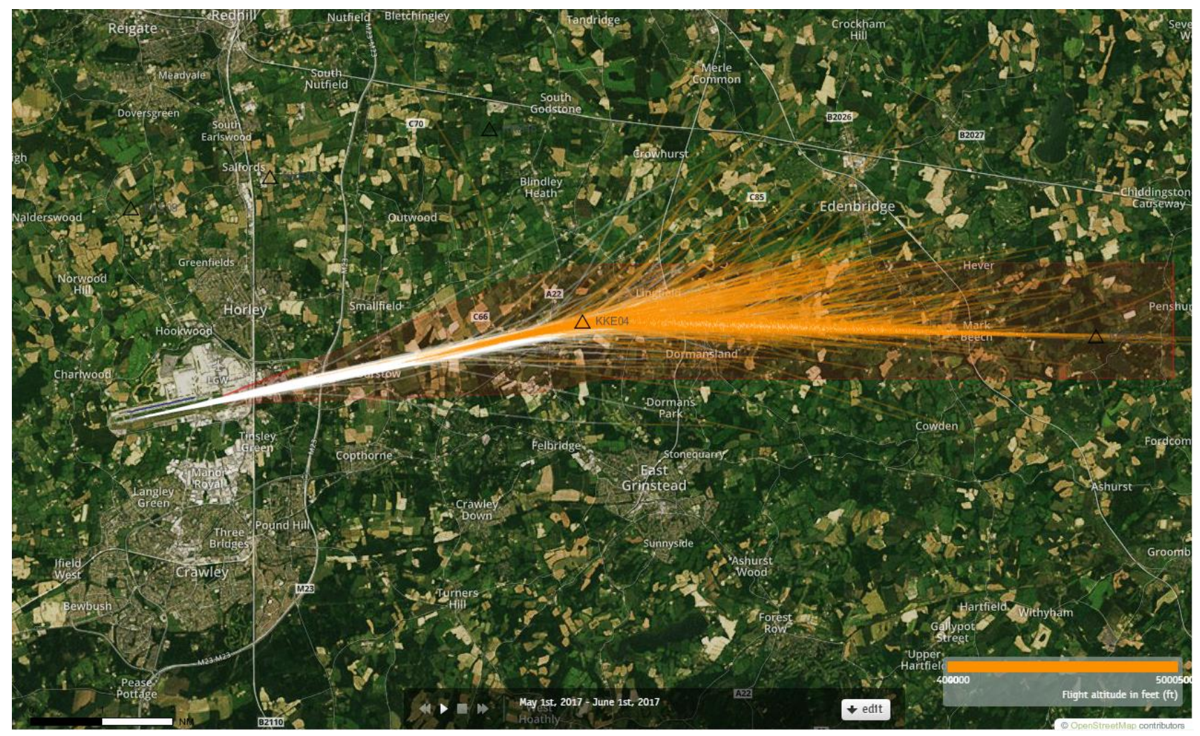
Orange plots show the points at which an aircraft was between 4000 and 5000ft altitude.