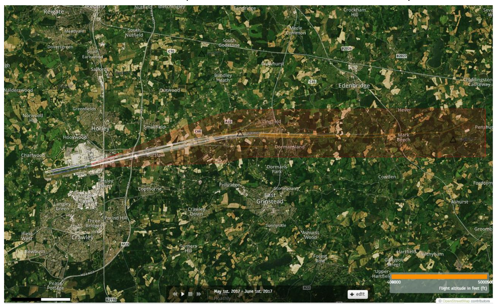
Orange plots show the points at which an aircraft was between 4000 and 5000ft altitude.