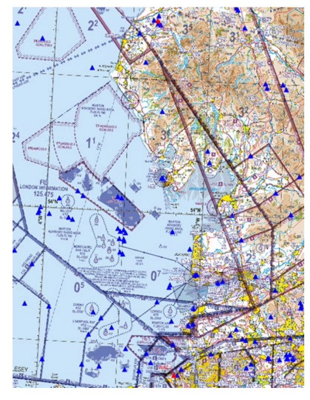
Figure 2: Lower Airspace Chart after the base level of Airway N864 had been raised