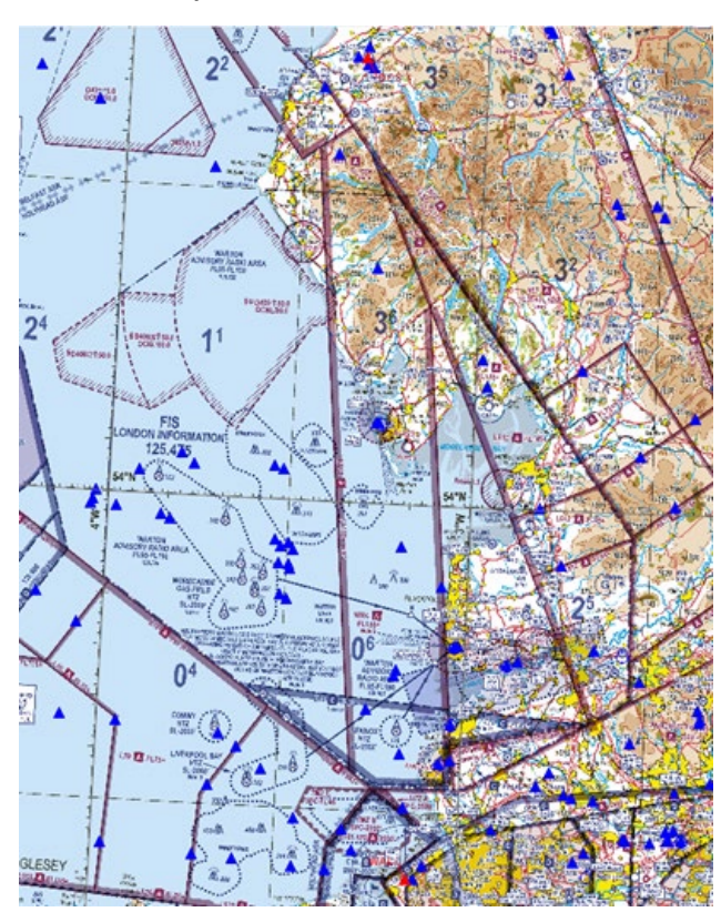
Figure 1: Lower Airspace Chart including Airway N864