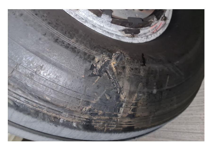
Figure 3 Damage to one of the landing gear tyres

Whilst the aircraft was waiting to depart at the holding point for Runway 27, ATC informed the crew that there had been an incident during the pushback and an inspection of the aircraft was required. Subsequently, they were informed by the handling agent that the aircraft had struck something and they should return to a stand for an inspection. The aircraft was subsequently taxied back towards the East Apron, stopped, shutdown and towed onto a stand, where it was inspected. Upon inspection, damage was discovered to the two tyres on the left landing gear, Figure 3. The damaged tyres were replaced before the aircraft departed after a delay of nearly four hours.