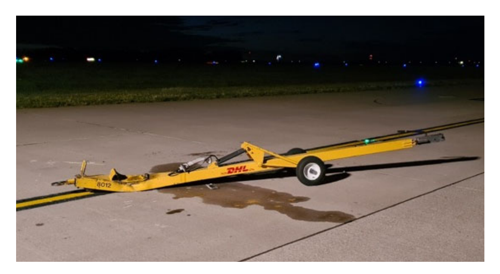
Figure 2 Towbar showing damage

in the taxiway with damage indicating that the aircraft had taxied over it, Figure 2. The TD immediately informed ATC and his supervisor, who informed airfield operations.