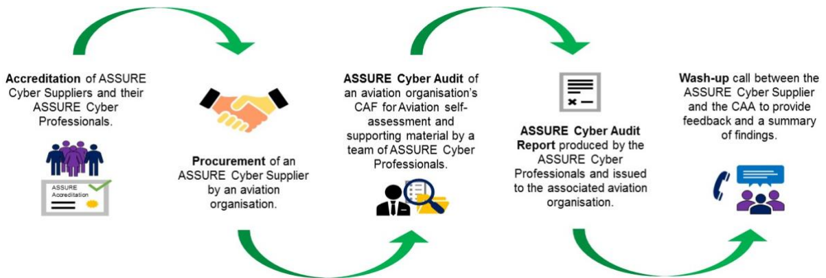
Figure 1: ASSURE Scheme stages

The ASSURE Scheme involves five key stages as depicted in Figure 1 below. Each stage is further described herein.