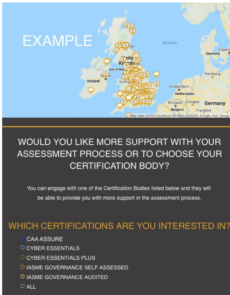
Figure 3: Example only of IASME's network

Once accredited, the ASSURE Cyber Supplier and their contact details will be made available via the IASME website, under find an Accredited CAA ASSURE Cyber Supplier (see Figure 3) 8 .