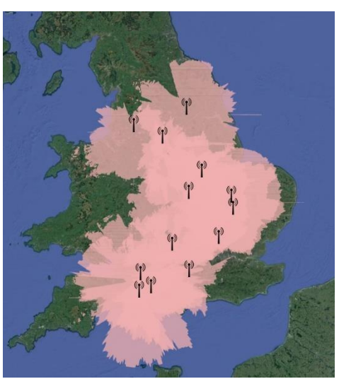
Viewshed at 2000ft