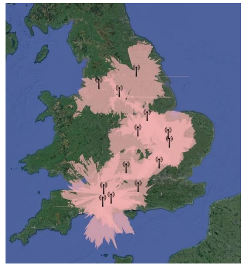
Viewshed at 1000ft