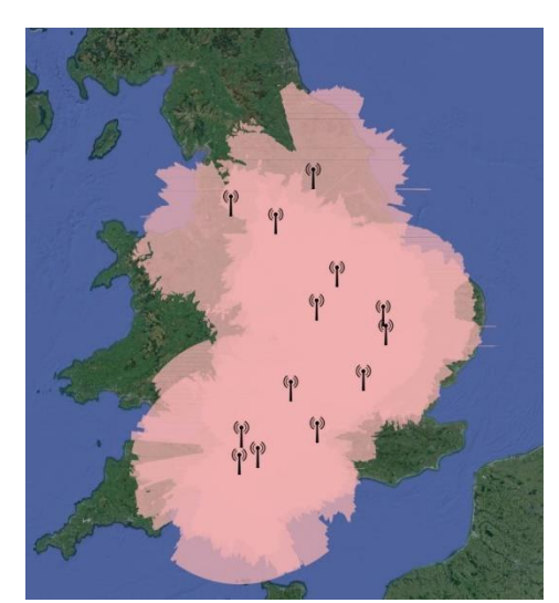
Viewshed at 3000ft