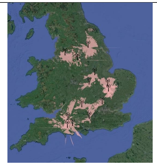
Viewshed at 200ft