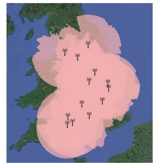
Viewshed at 5000ft