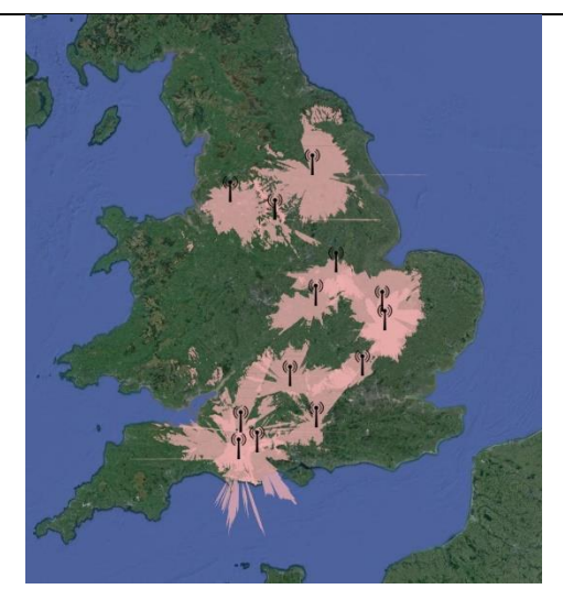
Viewshed at 400ft