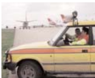
Figure 14: Bird Patrol

There are other risk mitigations that could potentially reduce the risk of a bird strike, such as more lengthy use of landing lights 22 , the use of weather radar or ultra-violet paint. All are postulated as increasing the ability of birds detecting and thus avoiding aircraft. There is no scientific evidence for their effectiveness however. Collectively these measures are not expected to have a major impact on the risk.