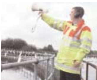
Figure 9: Acoustic Dispersal and Bird Deterrents Devices

These measures must be backed up with frequent bird patrols and the use of bird scaring and dispersal techniques. As a last resort culling may become necessary.