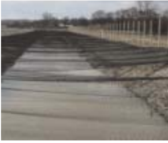
Figure 7: Bird Netting Over Drainage Ditch

Low fences can actually be effective in open ground, as geese tend to prefer to walk between feeding and roosting sites (tending to only take-off and land from water). Appropriate management of grassed areas and vegetation can also effectively discourage birds 18. It is also important to eliminate any nesting sites within the airport boundary.