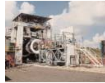
Figure 3: Multi-barrelled birdgun in place in front of an engine.

requirement necessitates that bird carcasses be fired from compressed air cannons at an engine running on a test bed.