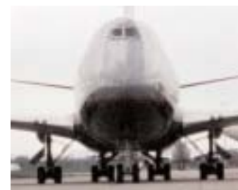
Figure 5: Boeing 747

3) On 19 November 1998 a Boeing 747 encountered a flock of approximately 40 Snow Geese beyond the airport boundary while executing a missed approach at Montreal Airport, Canada. The number 4 engine was shutdown, and a safe landing was made. The number 3 engine controls jammed at idle during taxi. Subsequent examination revealed damage to the number 4 engine, the nacelle of the number 3 engine, the radome, landing gear, both wing leading edges and external lights. The number 2 and 4 engines were removed after this incident, though only the number 4 engine is believed to have had bird damage. The span wise distance between the nose and the outboard engine on a 747 is comparable with the engine spacing on the largest twin engined transport aircraft in service.