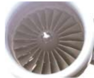
Figure 6: Typical Turbofan

will continue in production. Since commercial aircraft have a lifetime of around 25 years or more, the improved standard will take time to be introduced into the civil aircraft fleet in significant numbers.