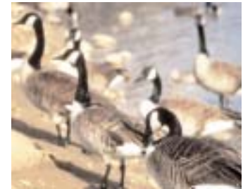
Figure 12: Canada Geese

eggs. While such an action would stunt the population growth rate, Canada Geese are long-lived birds 12, and such reproductive controls alone are unlikely to have a major effect on the total population and thus the aviation hazard in an acceptable time scale. Hence in some extreme cases of non-migratory birds it may be necessary to resort to culling.