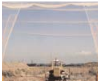
Figure 11: Netting in Place

Physical relocation of geese is an option. This is best achieved during the mating season when the birds are temporarily flightless. This though is an expensive option that merely moves the problem elsewhere 12. It may however be useful when small and distinct groups of geese pose an identifiable safety hazard.