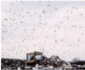
Figure 10: Land Fill Site Without Netting

impact that particular land use choices may have. National environmental agencies with the power to create protected areas for birds must similarly consider the risk of bird strikes when establishing such protected areas. They must also review the appropriateness of zones currently in place. Additionally developments that actively favour geese on an even wider radius must be avoided where possible.