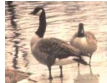
Figure 4: Canada Geese

During the last decade a new and serious threat has become apparent, namely the increasing numbers of large geese. The main threats in terms of body weight and population size are Canada Geese and Snow Geese. They are found in large numbers in North America. Canada Geese are also found in Europe in smaller, but increasing numbers. Additionally there is a smaller European threat from Greylag Geese.