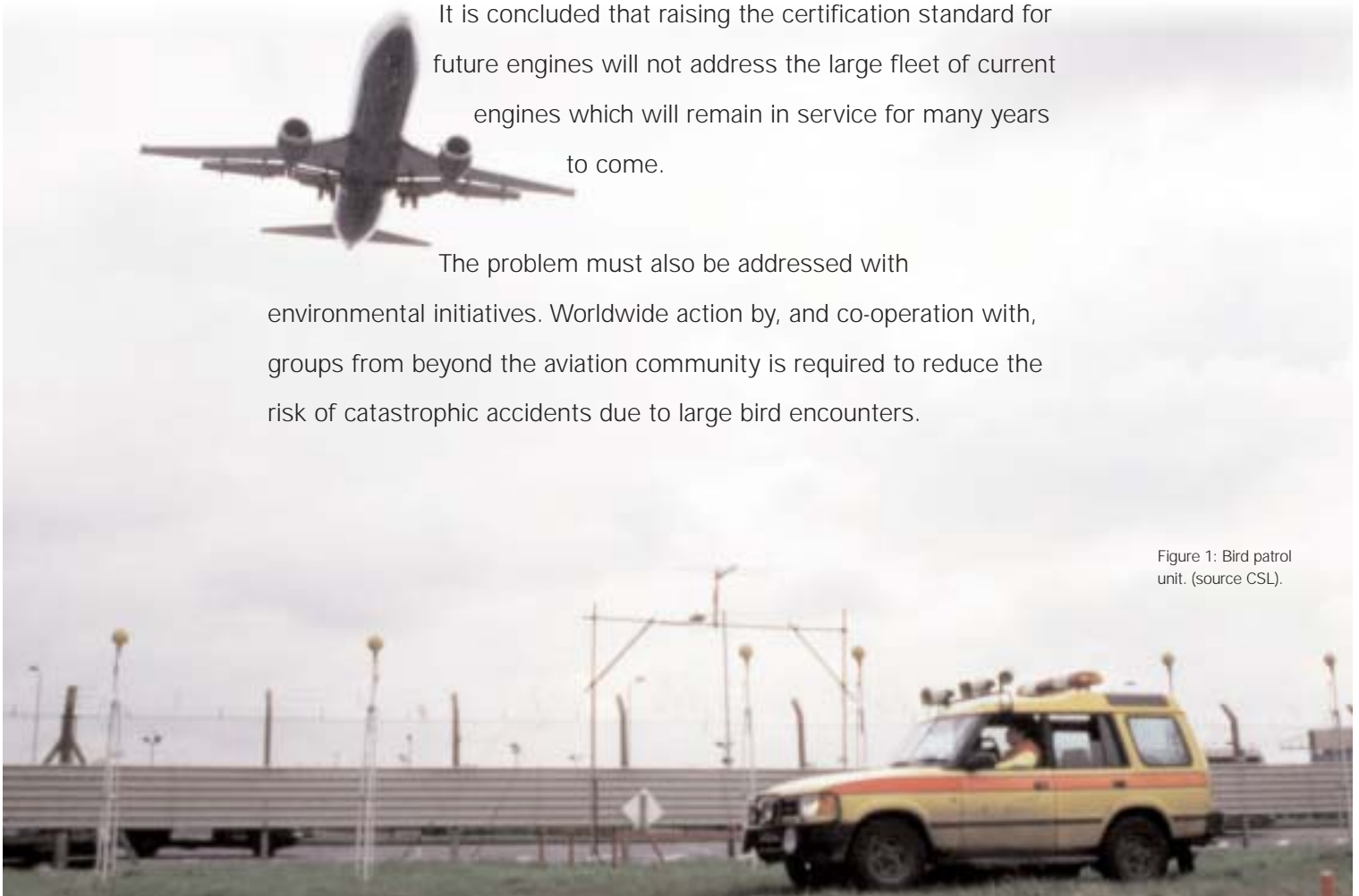
Figure 1: Bird patrol unit.

The problem must also be addressed with environmental initiatives. Worldwide action by, and co-operation with, groups from beyond the aviation community is required to reduce the risk of catastrophic accidents due to large bird encounters.