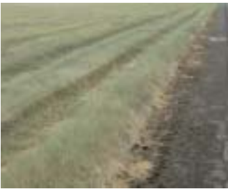
Figure 8: Tall Grass to Discourage Birds Landing

Low fences can actually be effective in open ground, as geese tend to prefer to walk between feeding and roosting sites (tending to only take-off and land from water). Appropriate management of grassed areas and vegetation can also effectively discourage birds 18. It is also important to eliminate any nesting sites within the airport boundary.