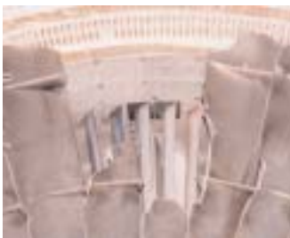
Figure 2: Typical engine fan blade damage.

Birdstrikes on turbine engines are more serious because they experience even higher impact energies than airframes. This is due to the high rotational speed of their fans and compressors (particularly when meeting the high thrust demands for take-off).