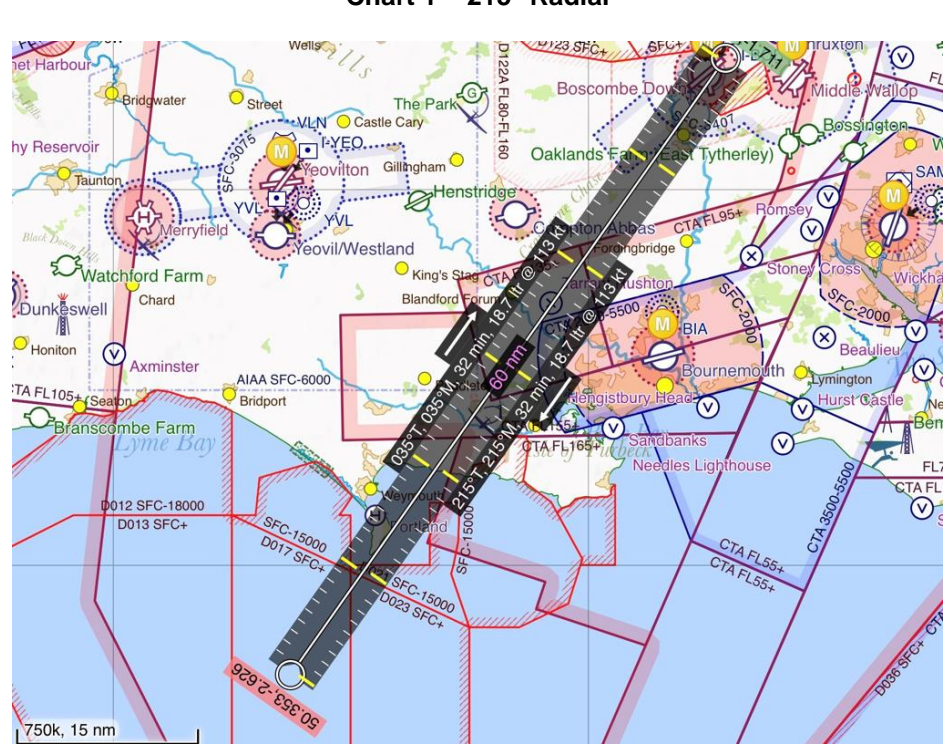
Chart 1 - 215° Radial

28. Charts highlighting the area of operation are shown below. These are for illustrative purposes only and not for operational planning.