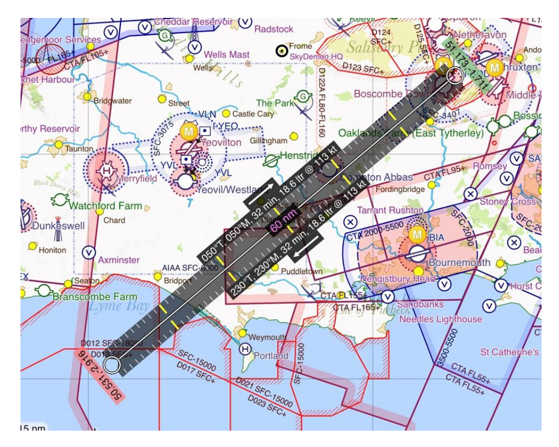
Chart 4 - 242° Radial