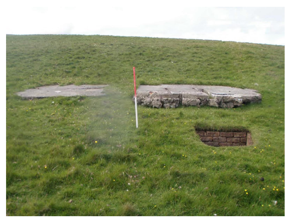
Plate 51: North-west facing view of ablutions block (Site 116) and a brick drain