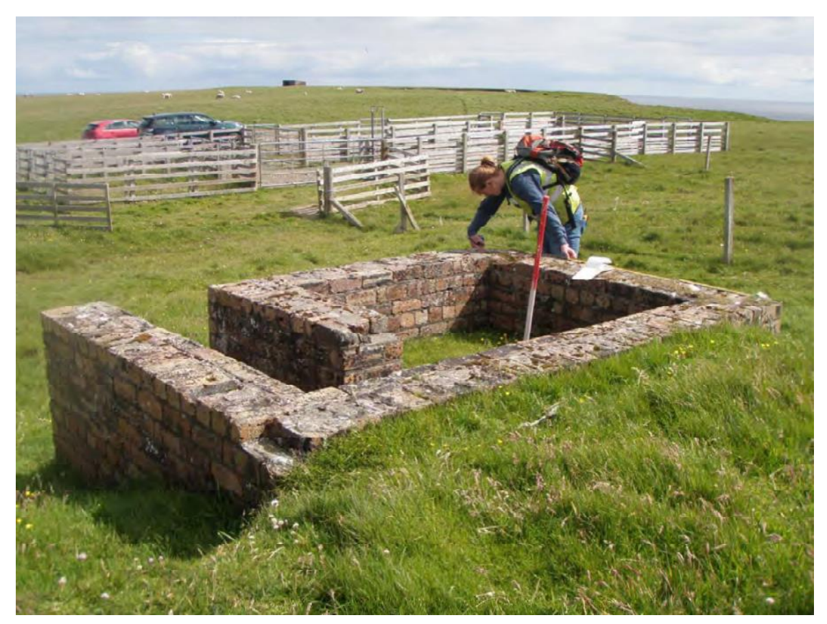
Plate 48: North-east facing view of the upstanding remains of Site 72, a probable air raid or sleeping shelter, dug into the nature slope