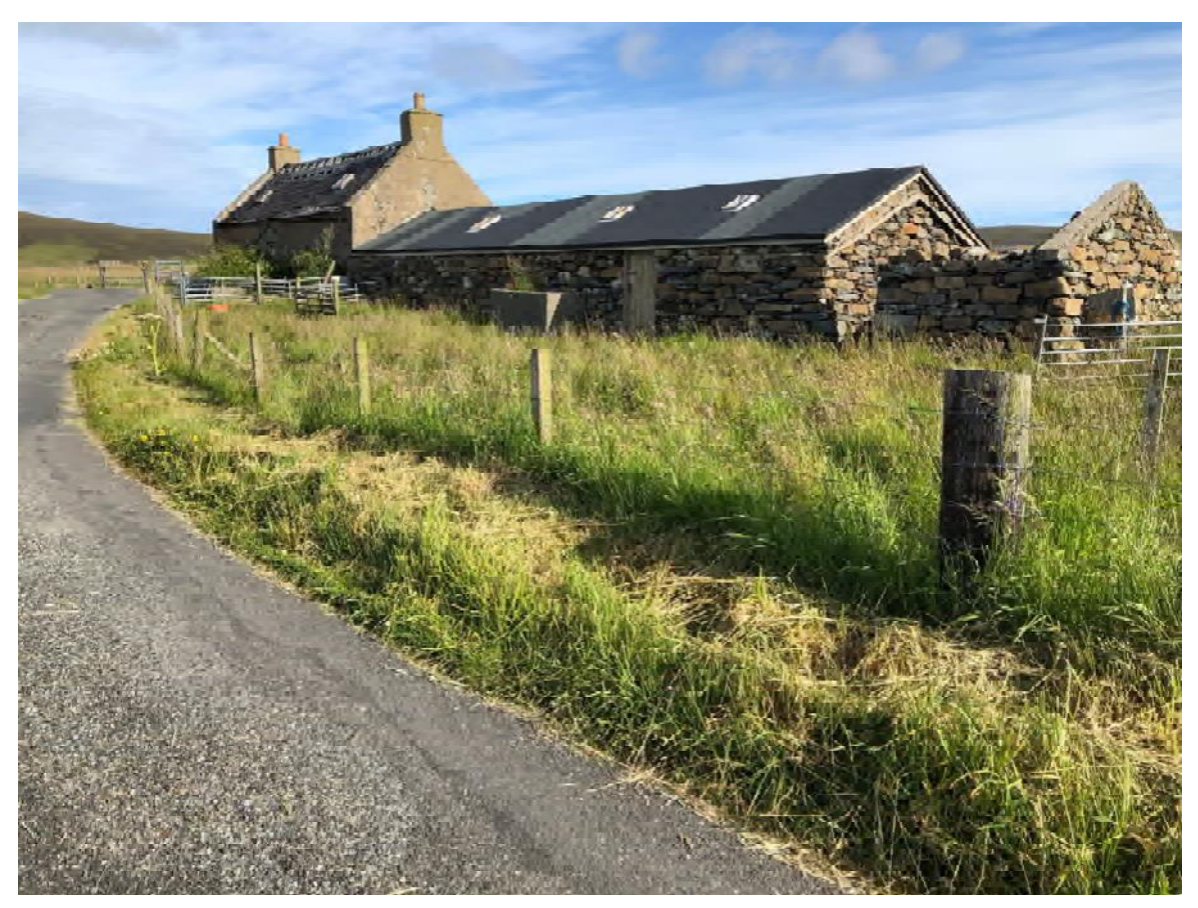
Plate 147: North-west facing view of the Category B Listed Papil (Site 5)