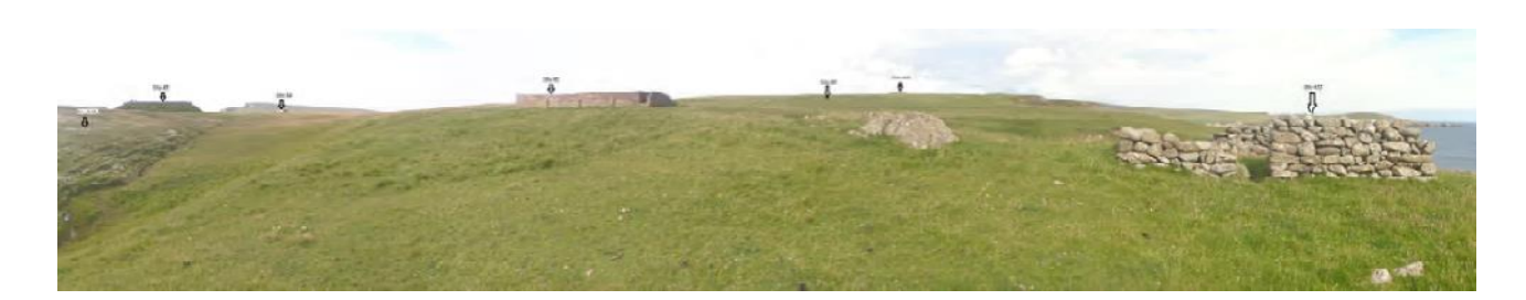
Plate 95: South-west-north panorama from a dry stone wall building (Site 432) showing the RAF structures around Site 85 and Site 86