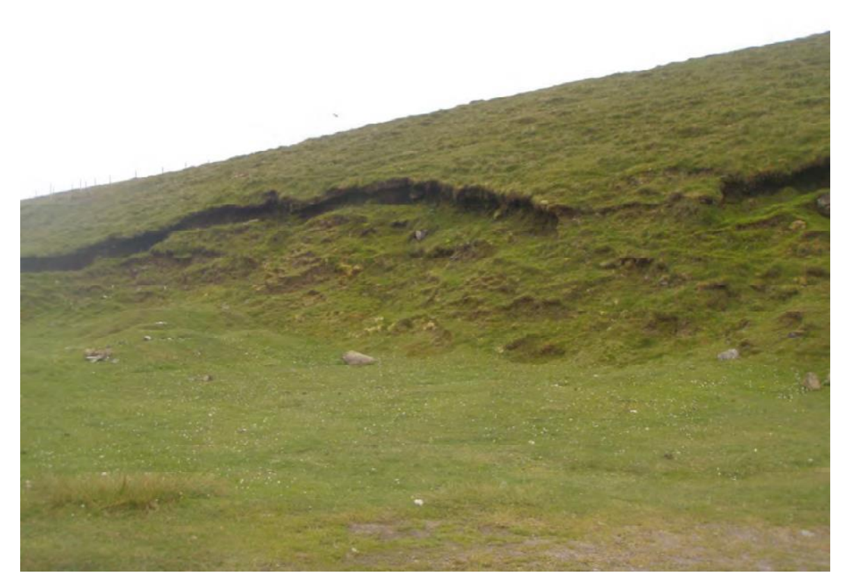
Plate 150: South-east facing view from the Category C Listed Boat-roofed shed (Site 6) towards the Site