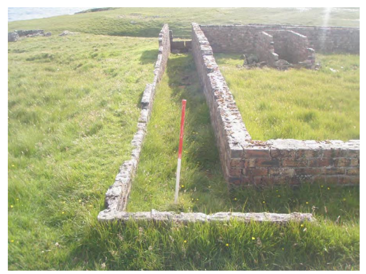
Plate 96: East facing detail of the double brick wall structure (Site 90) showing a crack in the outer, east facing wall