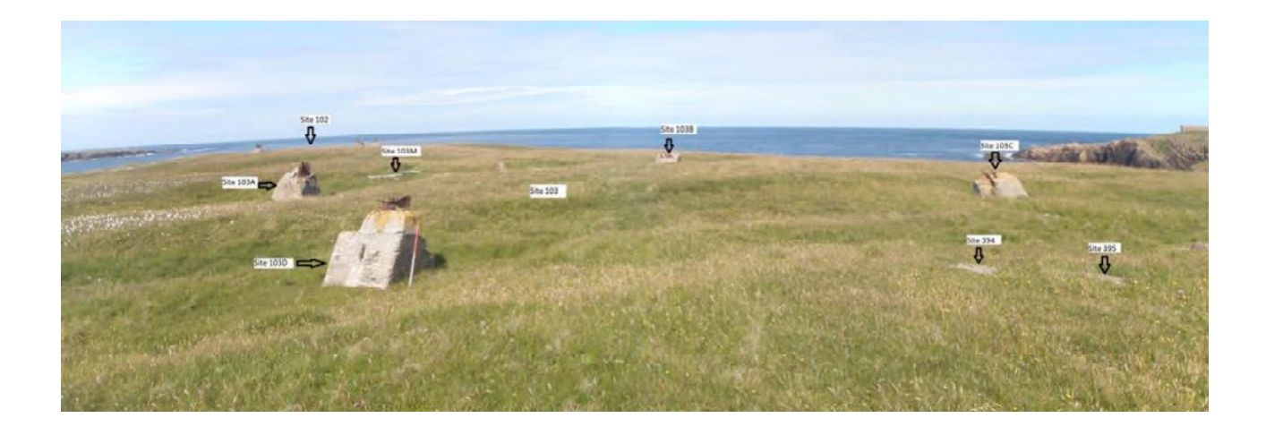
Plate 86: North-east facing view of a mast base (centred Site 103)