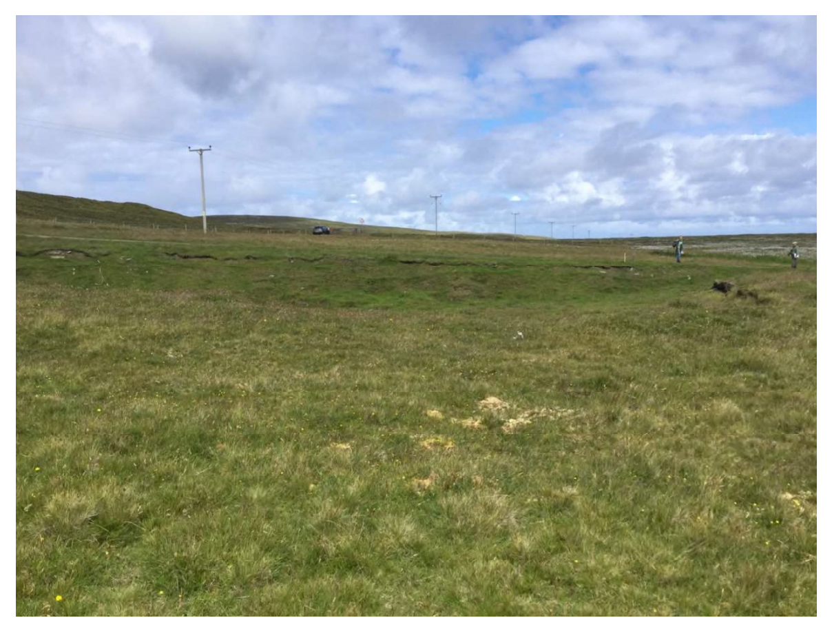
Plate 1: Northing facing view of an irregular quarry (Site 201) on the south side of the track