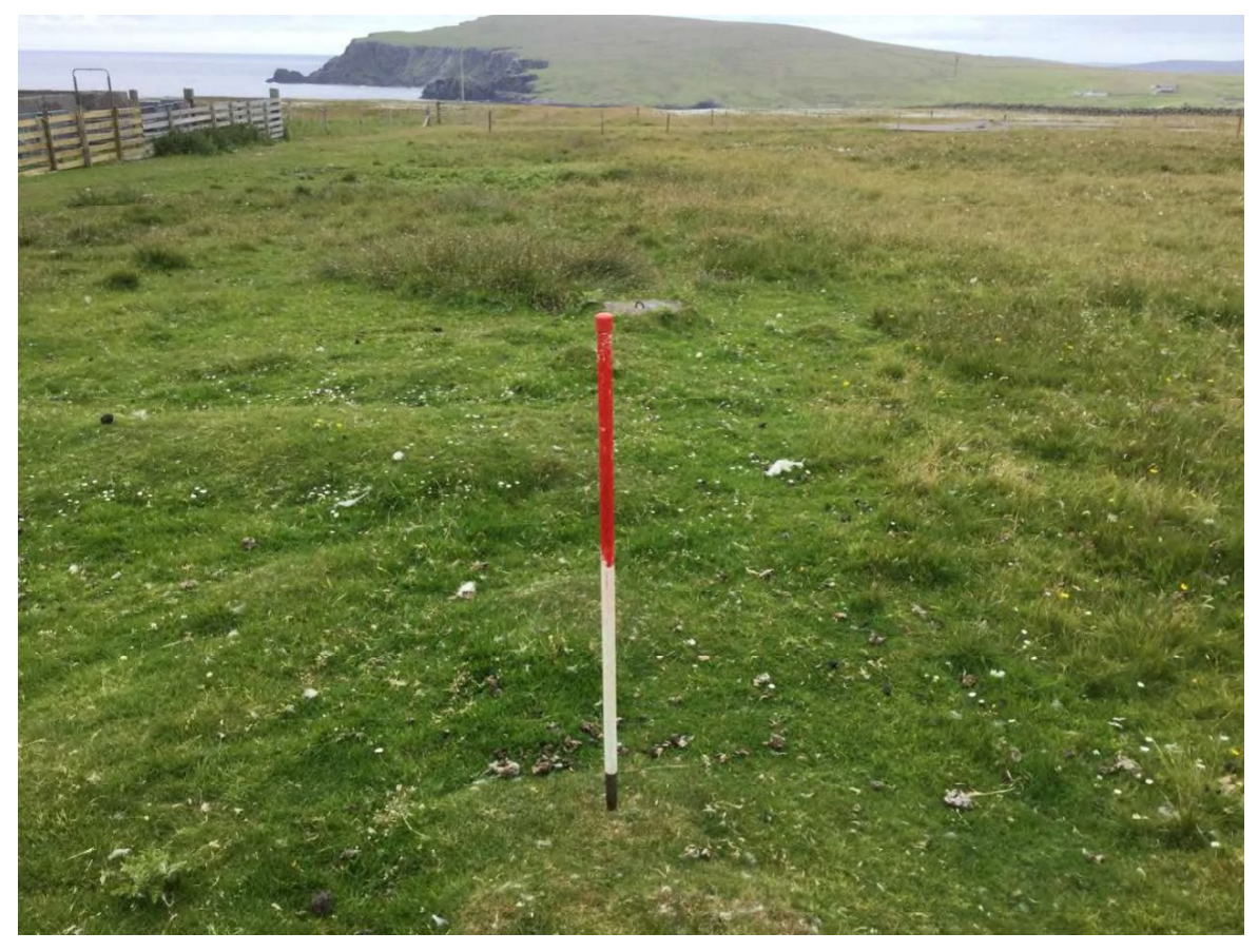
Plate 17: South facing view of a concrete block with tethering loop (Site 473), with another block (Site 471) in the rearground and a linear, overgrown earthwork (Site 472) is also visible