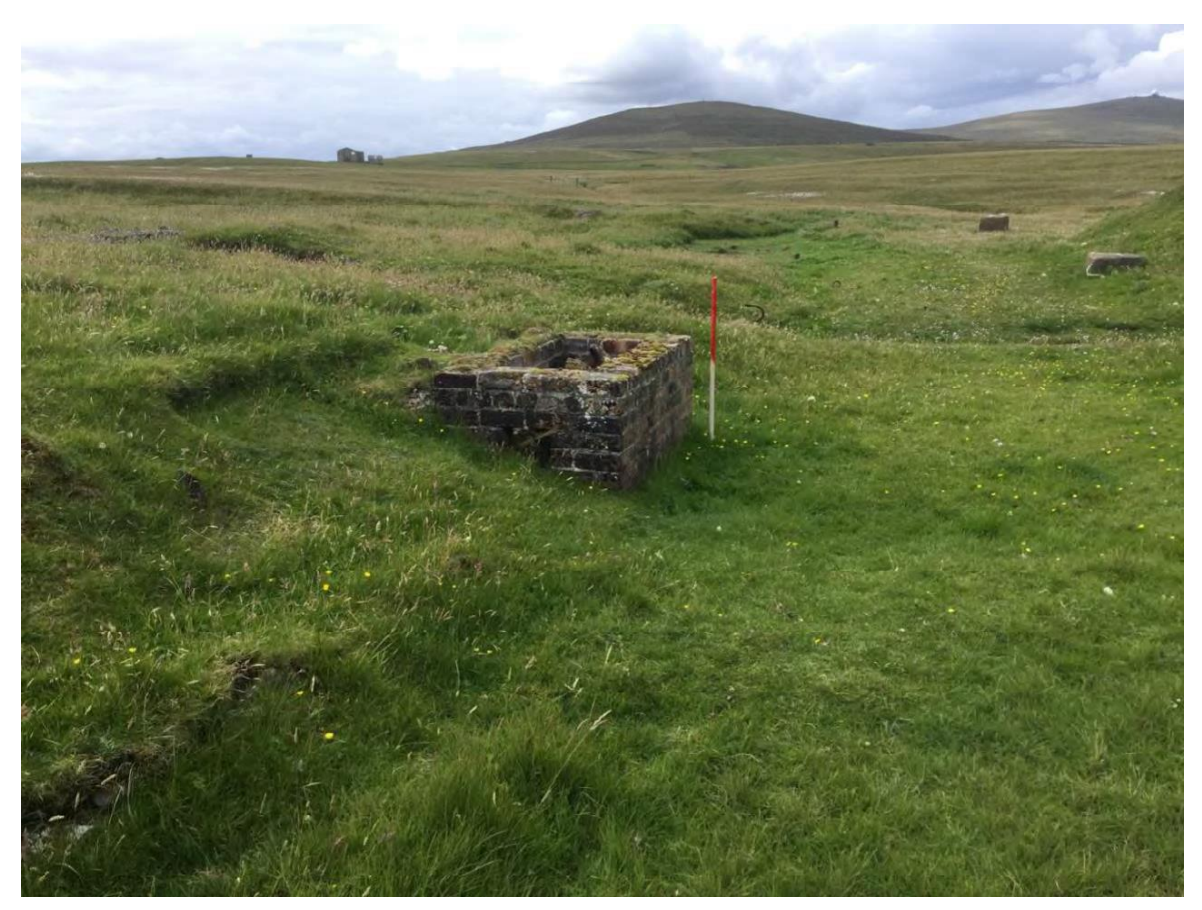
Plate 83: West facing view of a brick structure (Site 302) within the area encircled by Site 85b