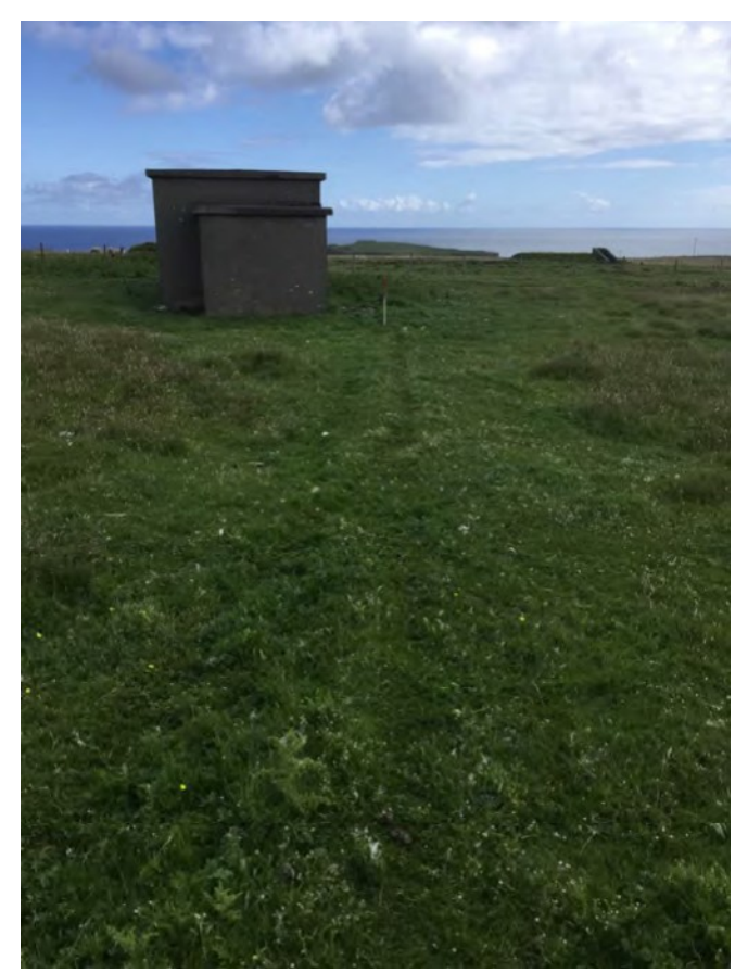
Plate 8: East facing view of the pathway between the guard hut (Site 128) looking towards the decontamination block (Site 130)