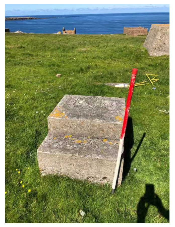
Plate 130: North-east facing view of Site 144F