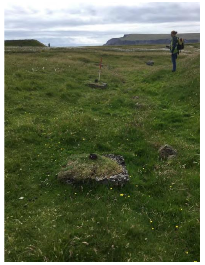
Plate 84: South facing view of channel (Site 315) and row of concrete blocks (316-320)