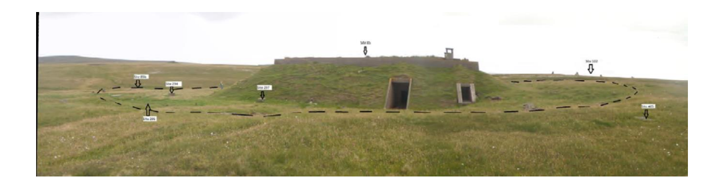
Plate 79: North facing view of the CH Transmitter block (Site 85) and selected features around the block (Site 85). The wall foundation (Site 85b) which encircle the area is shown as a dashed black line