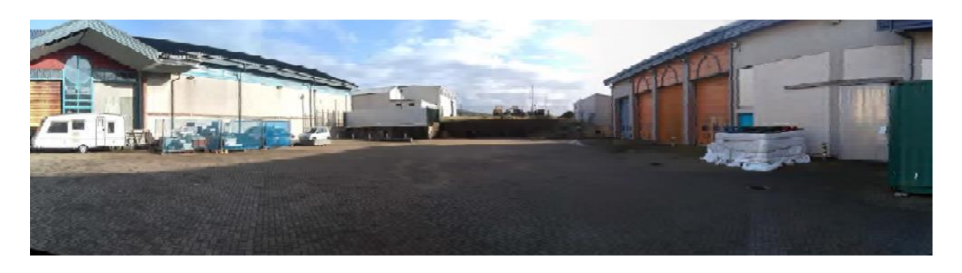
Plate 144: South-east facing view across proposed Launch Control Centre