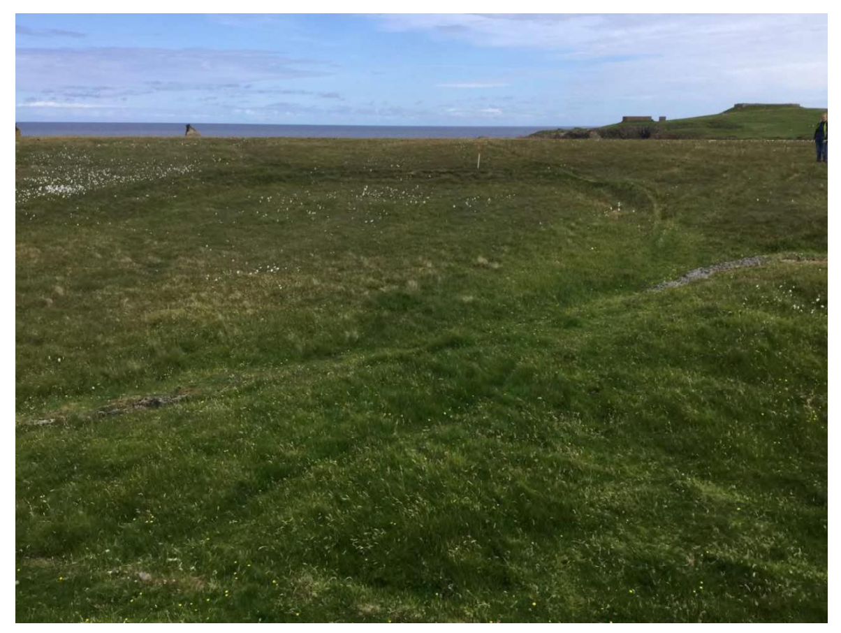
Plate 87: North-east facing view of excavated area (Site 321)