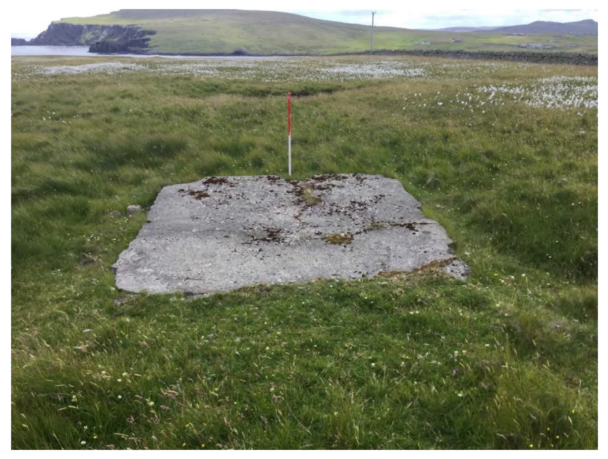
Plate 21: South facing view of concrete foundation block (Site 205)