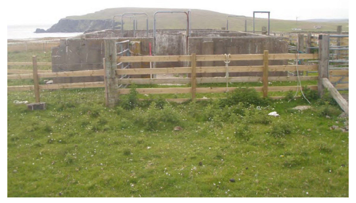
Plate 14: South facing view of former office block, which has been repurposed as a sheep pen