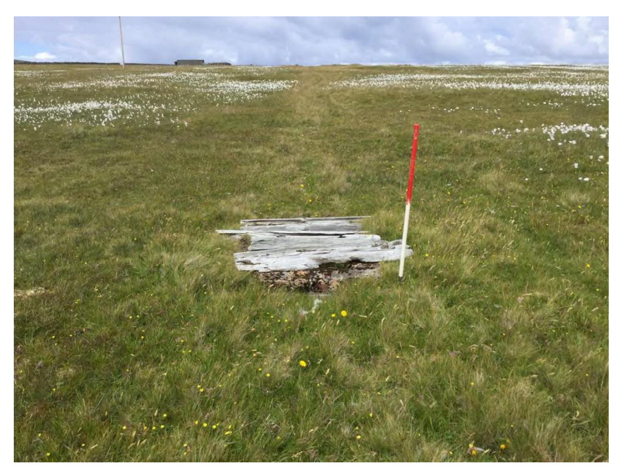
Plate 38: North facing view of wood plank covered, brick structure (Site 213)