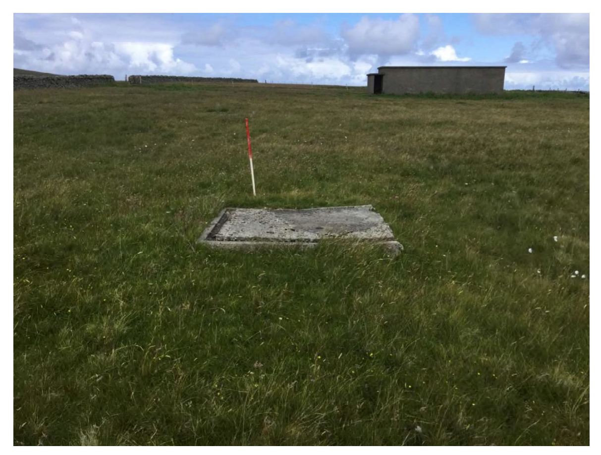
Plate 16: Northfacing view of a concrete foundationblock. This example is Site 204a the northern most of three concrete blocks (Sites 204a-c)