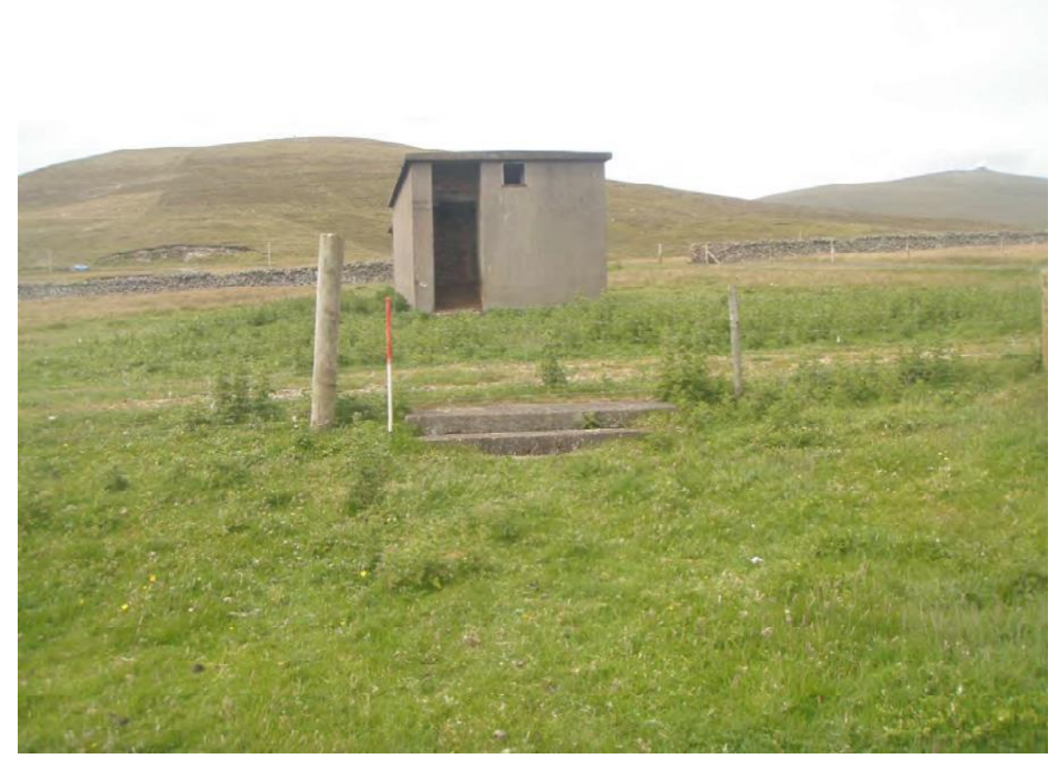
Plate 25: West facing view of the steps between the decontamination block (Siet 130) and the former air raid shelter (Site 134)