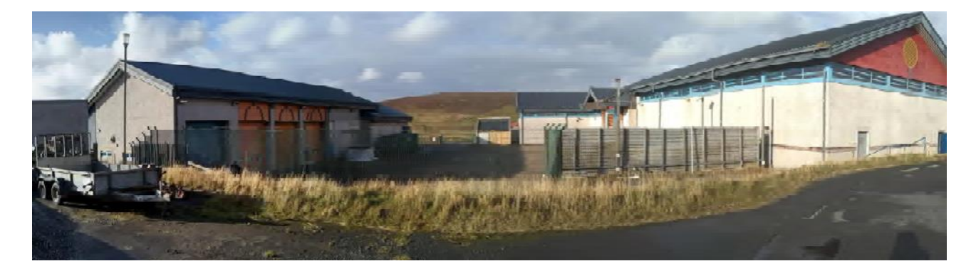
Plate 143: North-west facing view across proposed Launch Control Centre