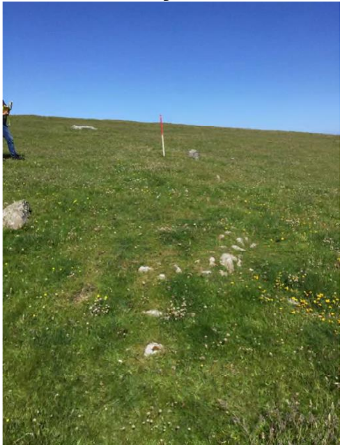
Plate 134: North-east facing view of probable degraded cairn (Site 278)