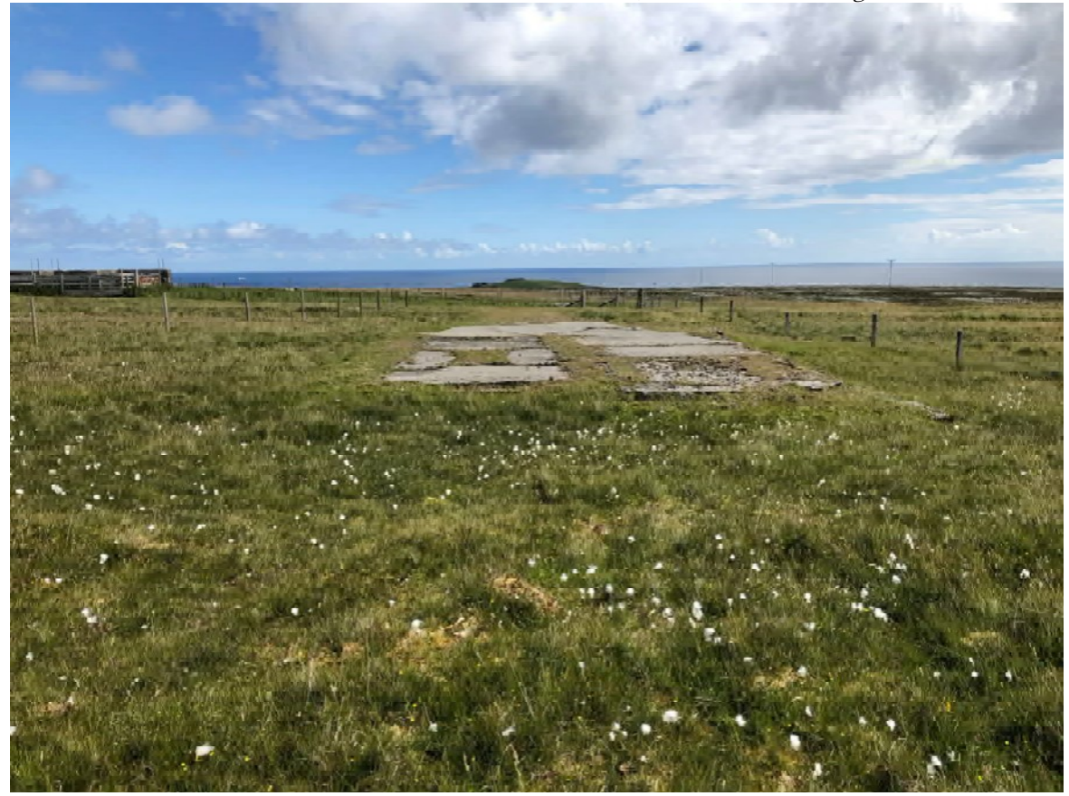
Plate 20: East facing view of the foundation remains of the water transport system (Site 138) with the upstanding remains of the office block (Site 136) in the rearground