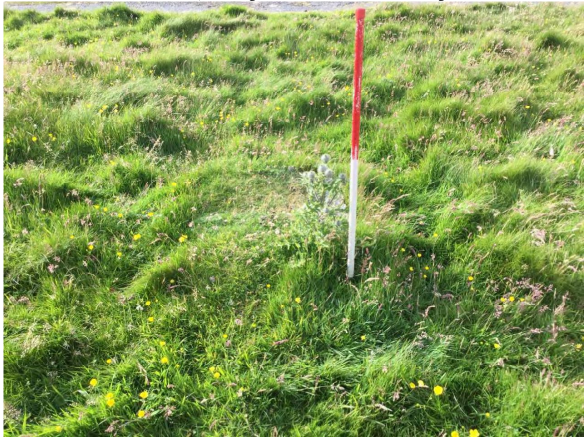
Plate 76: South facing detail of an overgrown concrete base (Site 426)