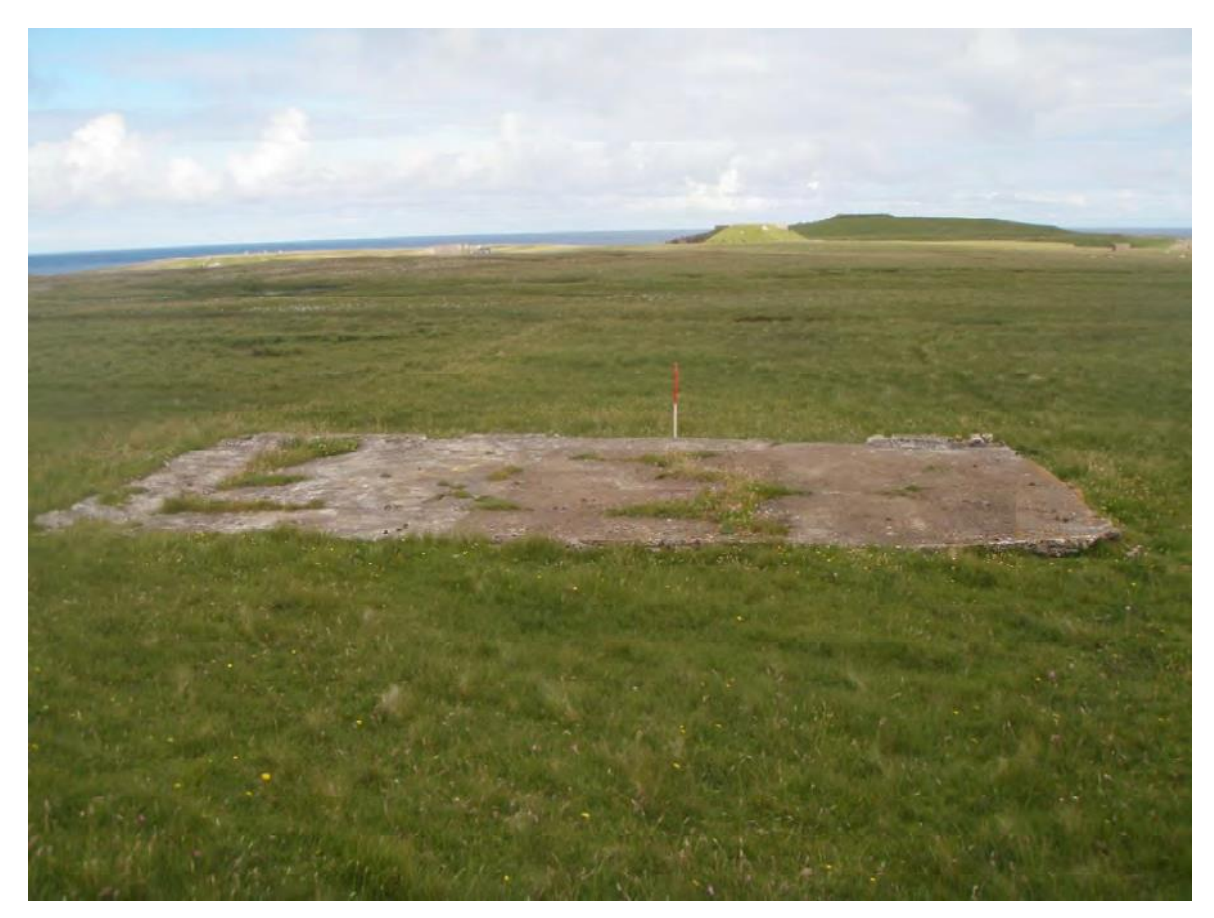
Plate 63: East facing view of an ablutions block (Site 108)