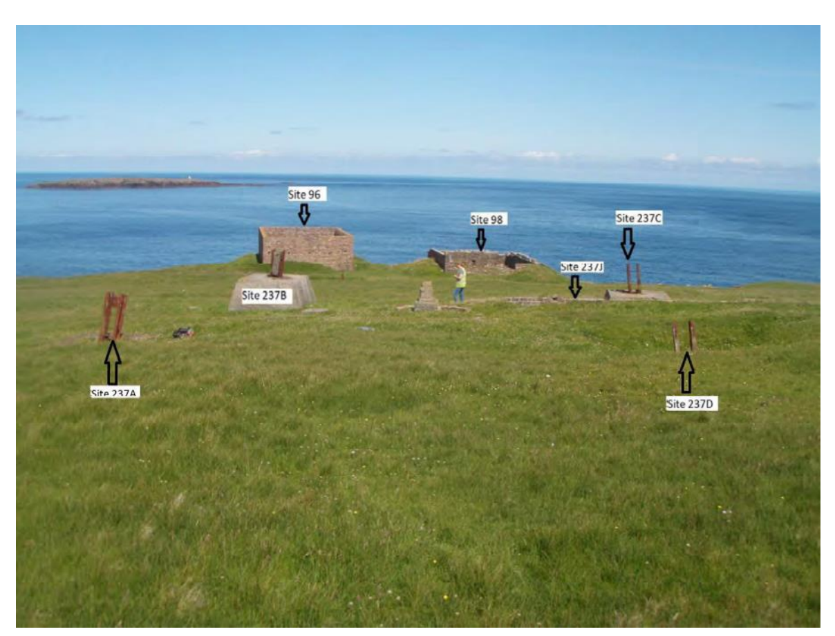
Plate 125: North facing view of mast base (centred Site 237)