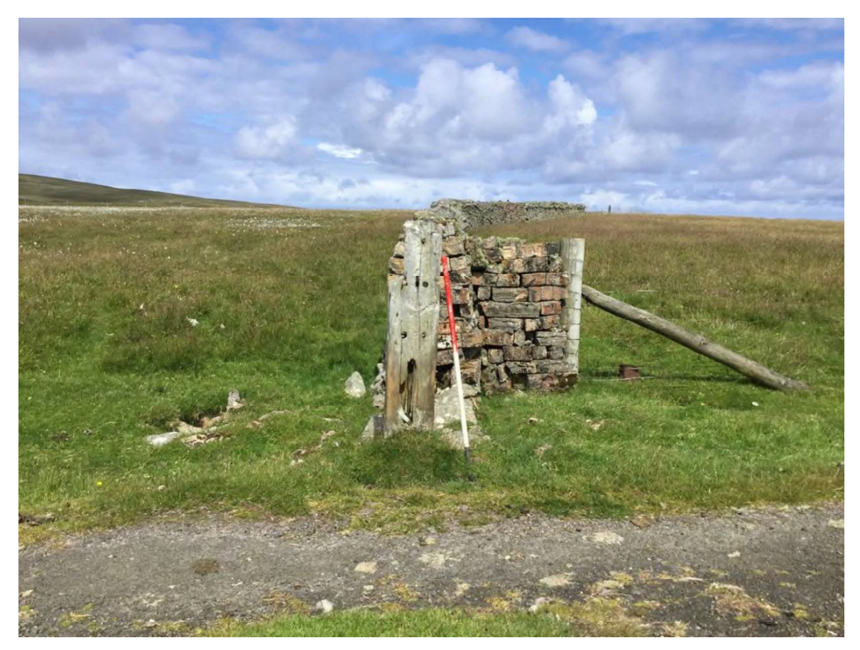
Plate 5: North facing view of the dry stone wall, from the entrance (Site 104)