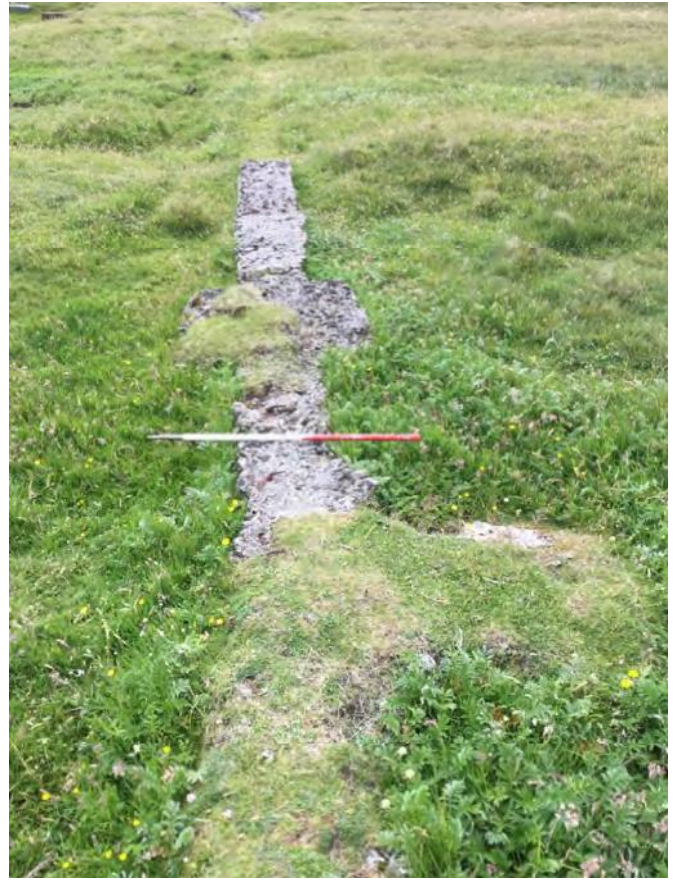
Plate 80: East facing view along Site 85b, showing larger concrete blocks at regular intervals along the wall foundation