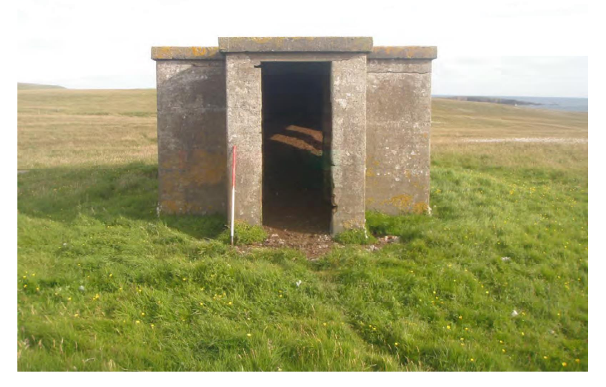
Plate 72: North facing view of a guard hut (Site 84)