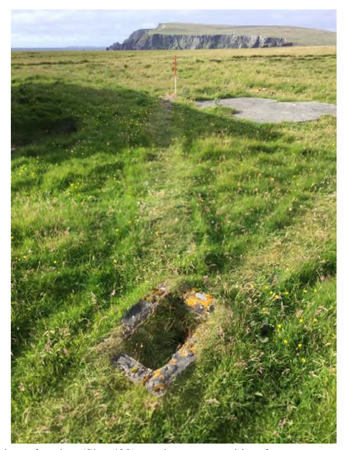
Plate 75: South facing view of a pipe (Site 428) on the eastern side of a concrete pad (Site 84b). The pipes (Site 427 & 428) converge at a brick structure in the foreground