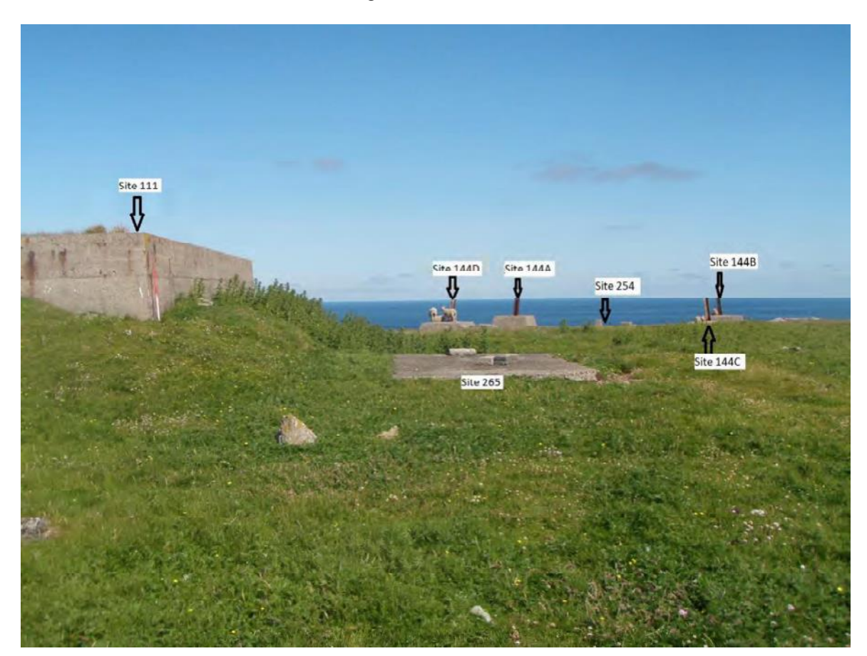
Plate 126: North-east facing view of mast base (centred Site 144) to the east of th CH Transmitter block (Site 111)