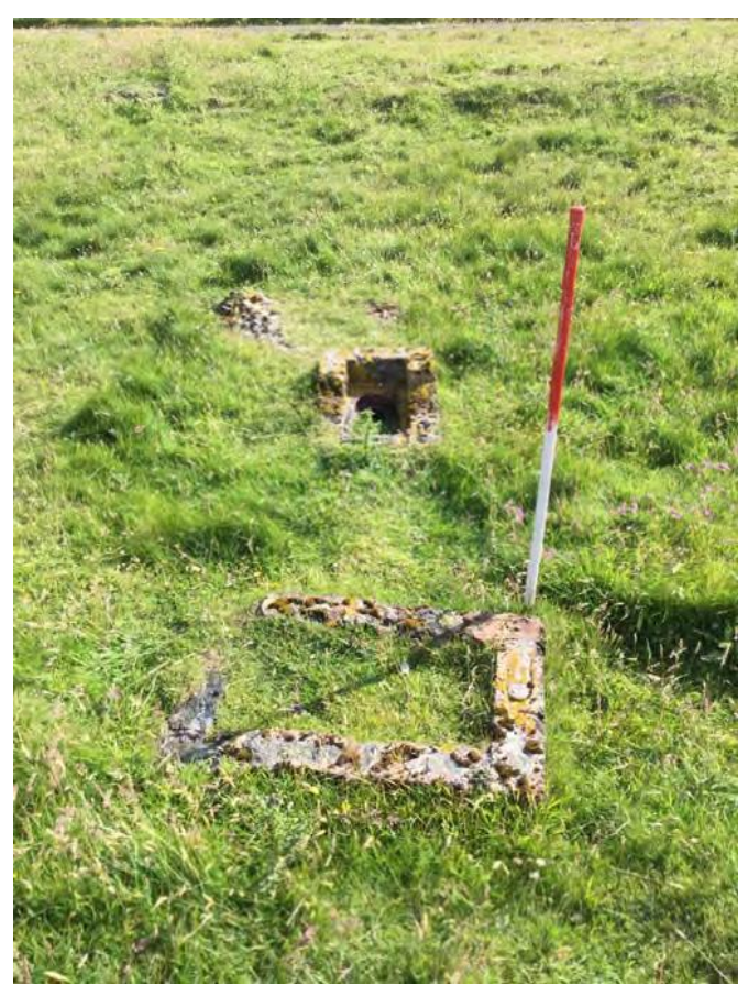
Plate 99: South facing view of a probable toilet (Site 413) with another probable toilet (Site 412) in the rearground