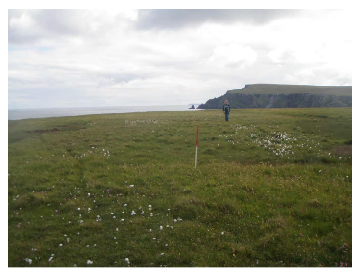
Plate 67: South-east facing view of the overgrown remains of a building (Site 106b)