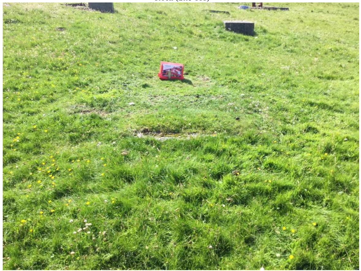
Plate 136: Detail of overgrown block (Site 237H) with another concrete block (Site 237G) in the rearground