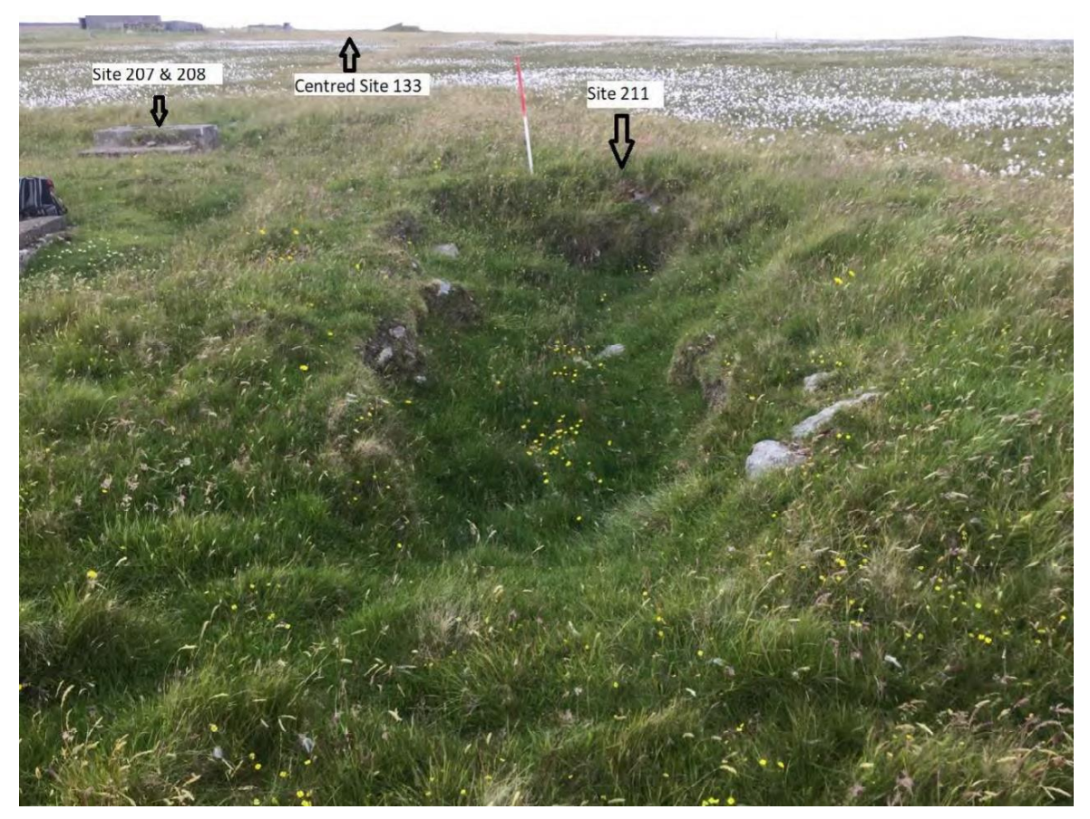
Plate 37: North facing view of probable bomb crater (Site 211)