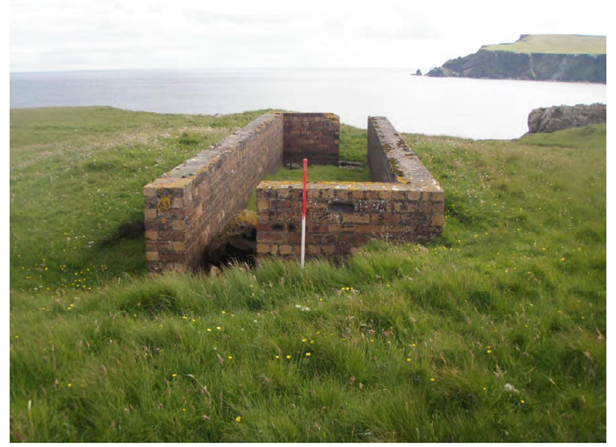
Plate 62: South-east facing view of probable air raid shelter (Site 105)