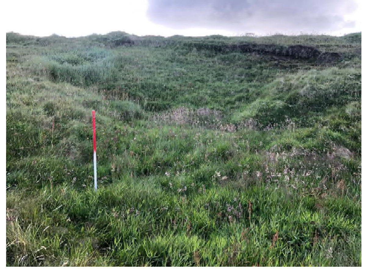
Plate 141: East facing view of quarry scoop (Site 400)