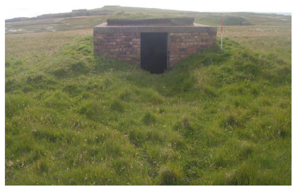
Plate 94: East facing view of a potential air raid shelter (Site 87)