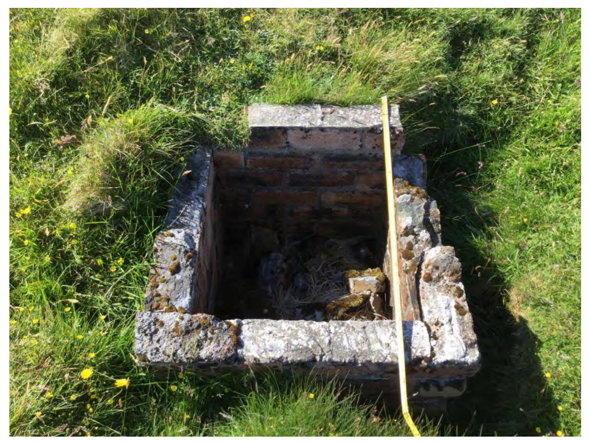
Plate 77: Detail of brick structure (Site 378)