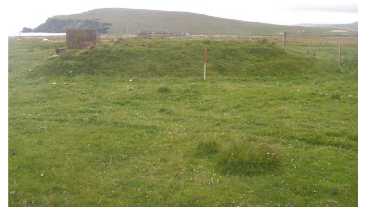
Plate 12: South facing view of a former air raid shelter (Site 134)