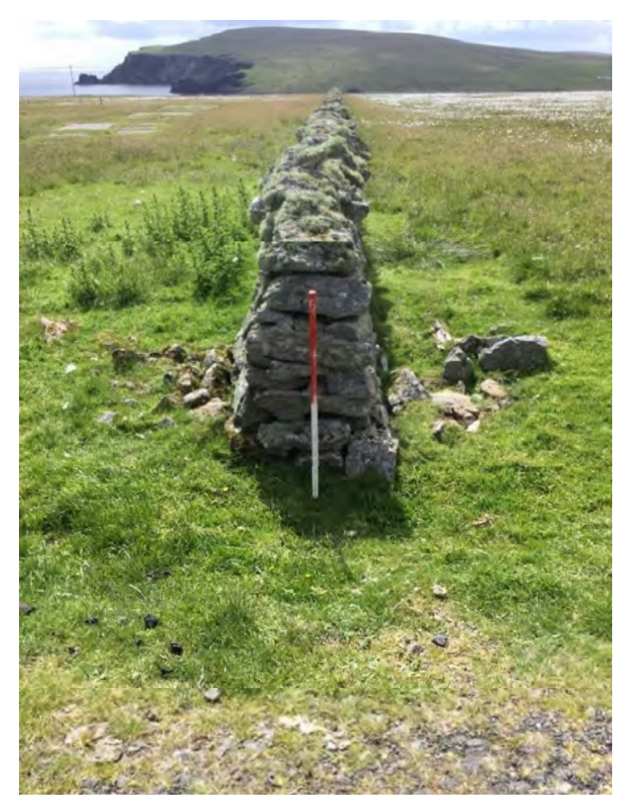
Plate 6: South facing view of dry stone wall from Site 104