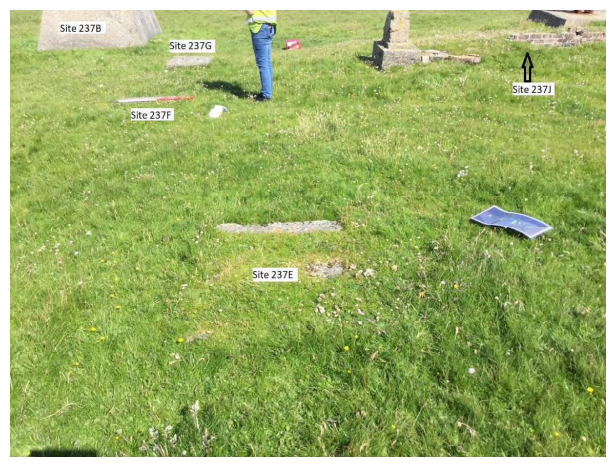
Plate 129: North facing view of concrete blocks around the mast base (centred Site 237)