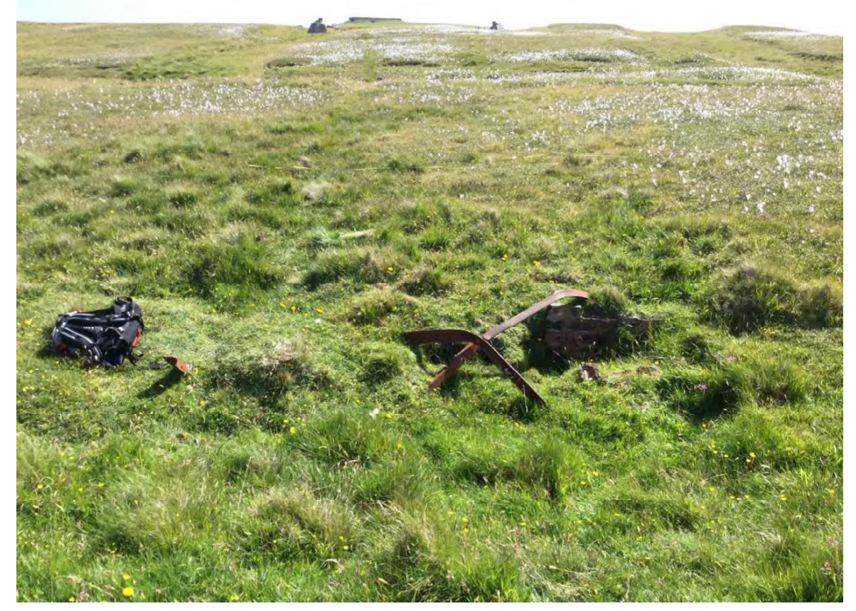
Plate 78: East facing view of the location of a potential structure (Site 384). Note the metal posts and wall remains