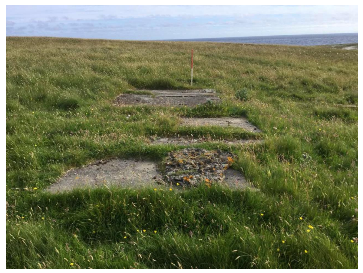
Plate 91: North-east facing view of a concrete foundation (Siet 431)