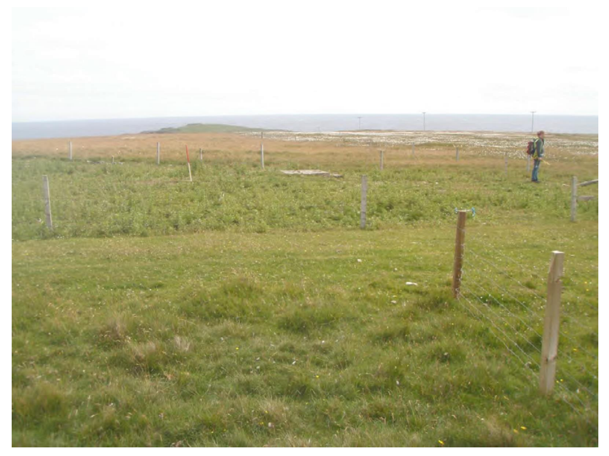
Plate 33: East facing view of the overgrown remains of the Medical Centre (Site 137) from the water transport section (Site 138)