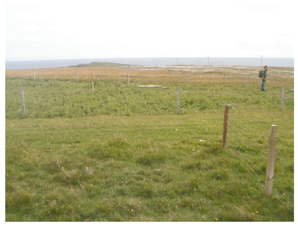
Plate 19: East facing view of part of the north-south aligned road which runs southwards from the track, with the foundation remains of the medical centre (Site 137) in the rearground