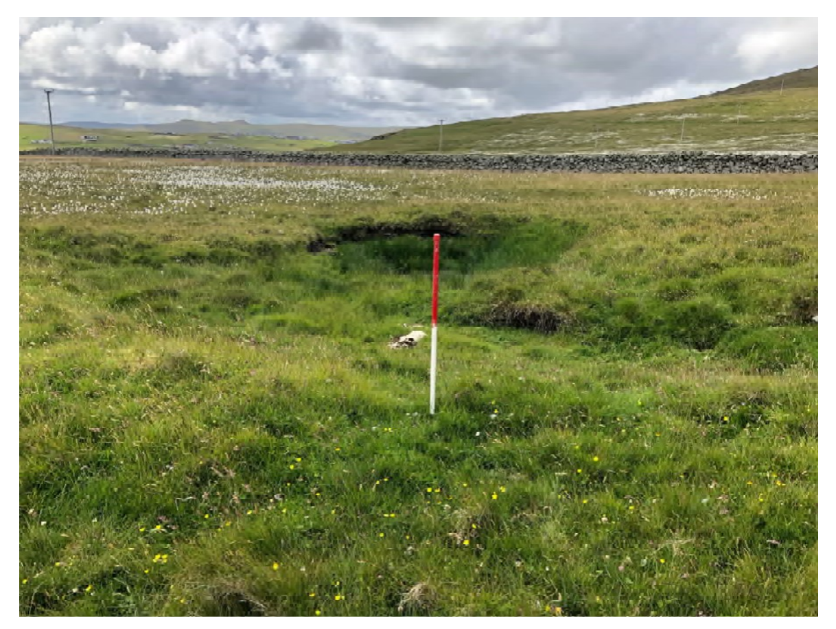
Plate 22: South-west facing view of a probable bomb crater (Site 117)