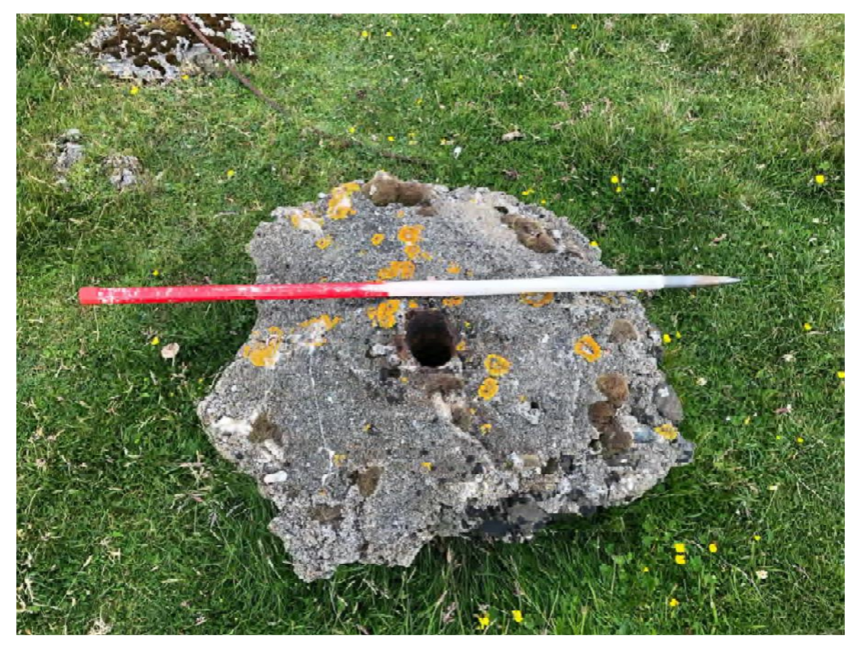
Plate 82: Detail of Site 851, a concrete block within the vicinity of the CH Transmitter block (Site 85)