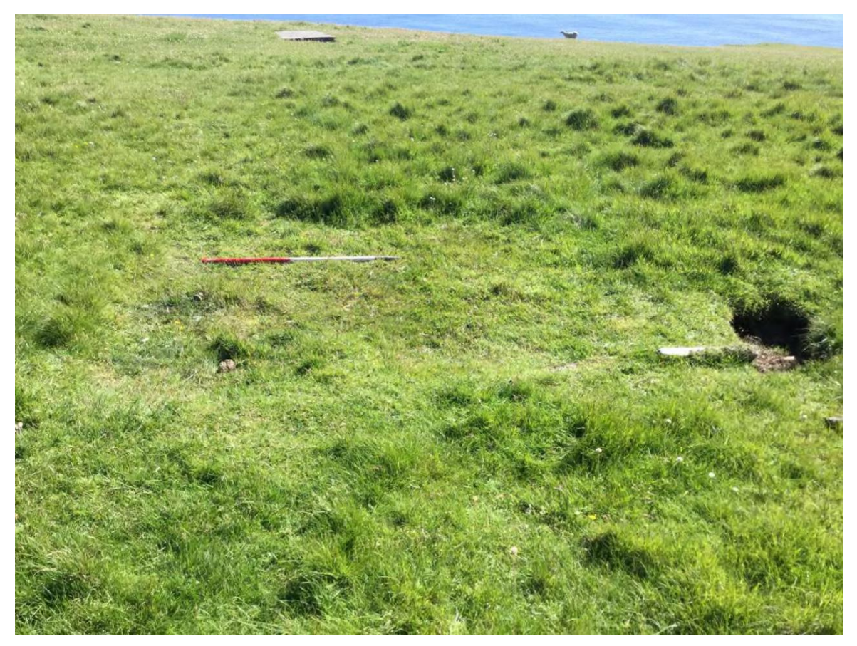
Plate 132: South facing view of overgrown concrete base (Site 262)