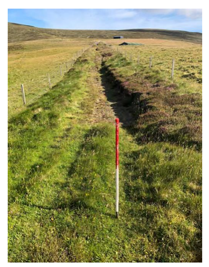
Plate 140: Northing facing view of New Section of Access Road