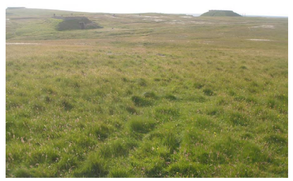
Plate 90:South-east facing view of the track (Site 86b) towards the CH Transmitter building (Site 85)