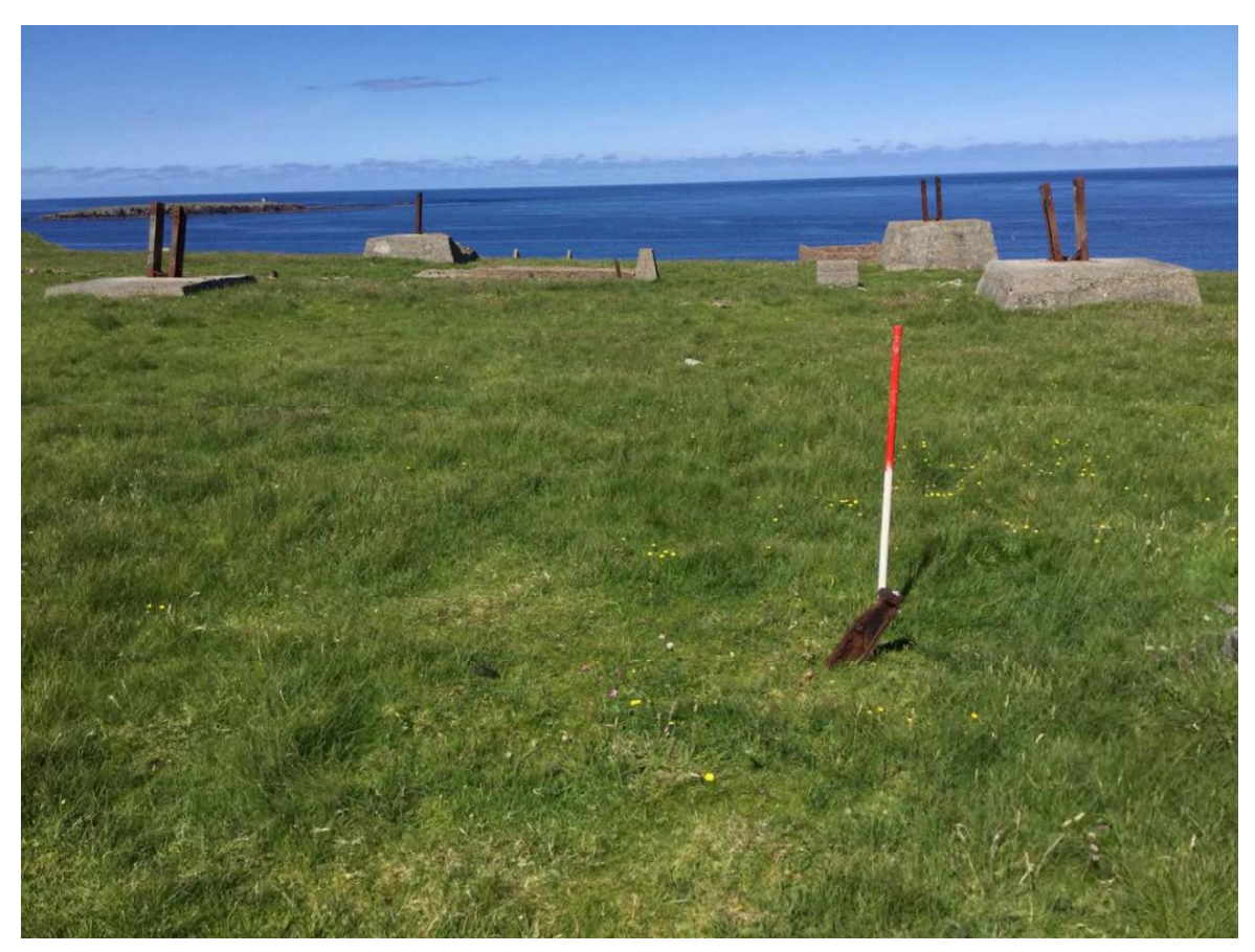
Plate 133: North-east facing view of metal post (Site 256) with the mast base (centred Site 144) in the rearground