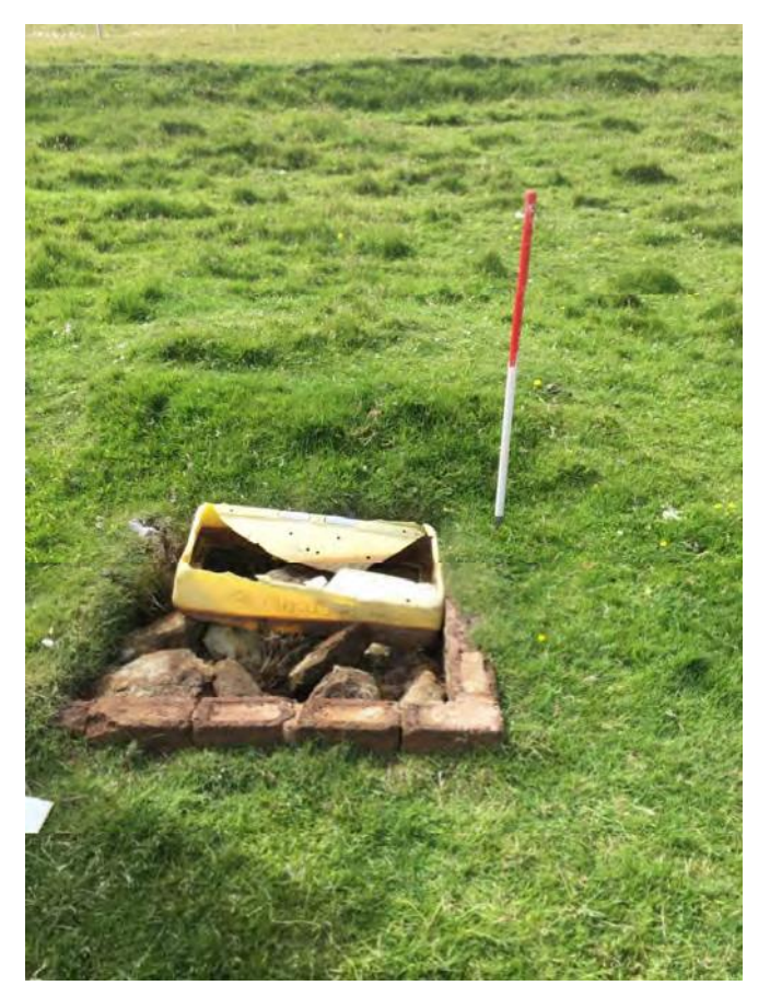
Plate 46: West facing view of brick structure (Site 229)