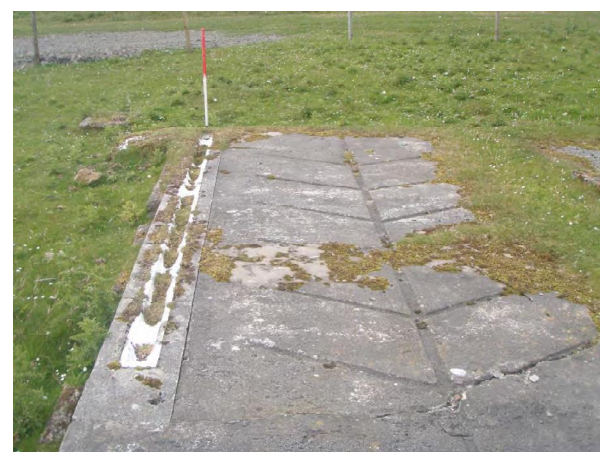
Plate 30: Detail of the remains of drainage features at the northern end of the abultions block (Site 132)