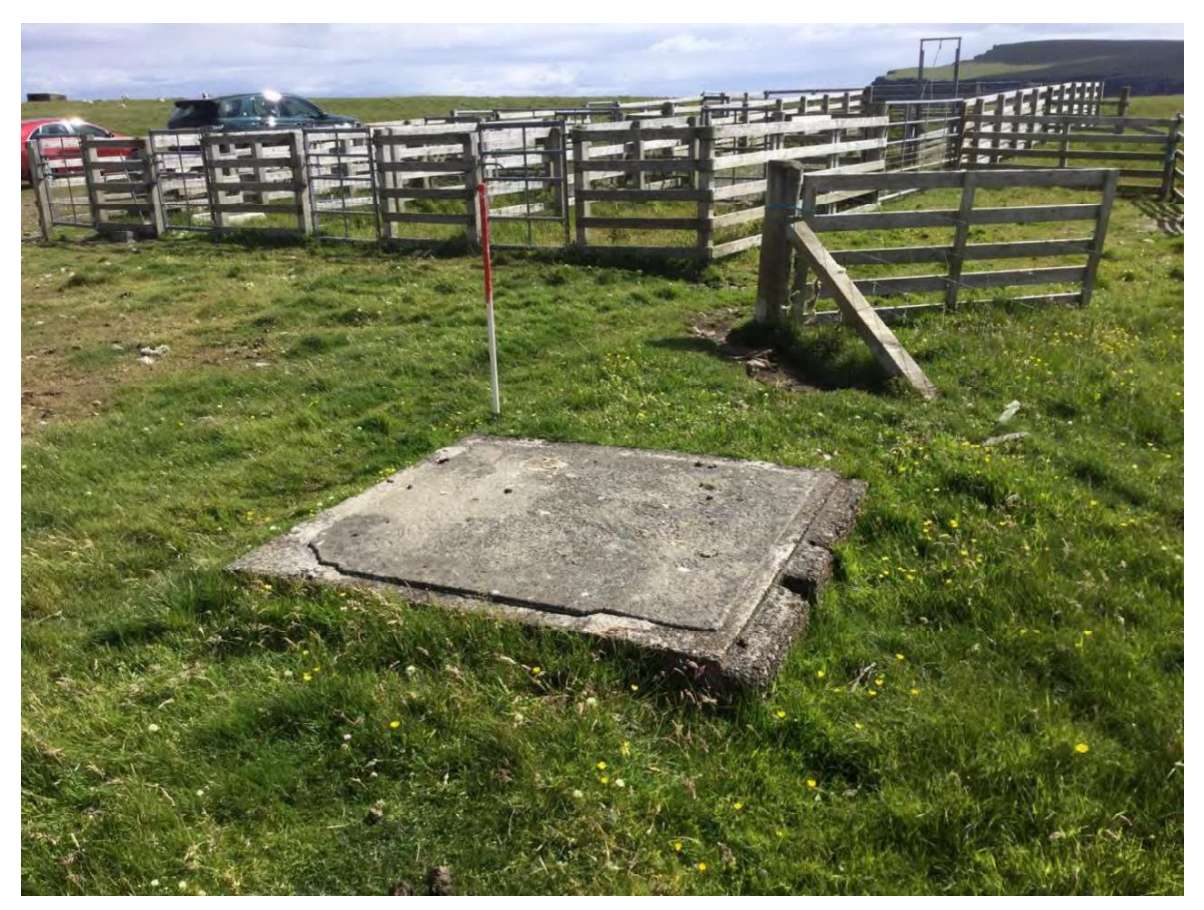
Plate 47:South-east facing view of concrete pad (Site 231)