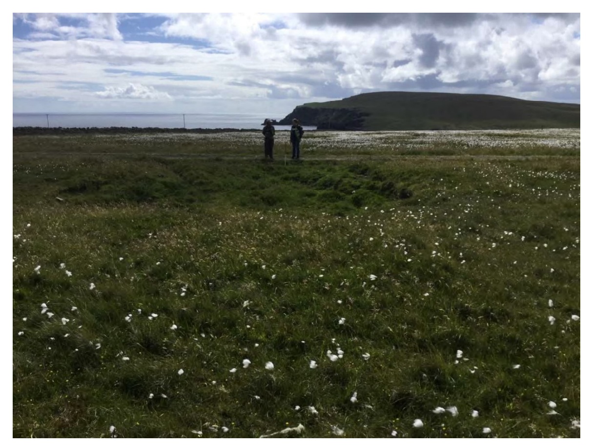
Plate 3: South facing view of probable bomb crater (Site 202)