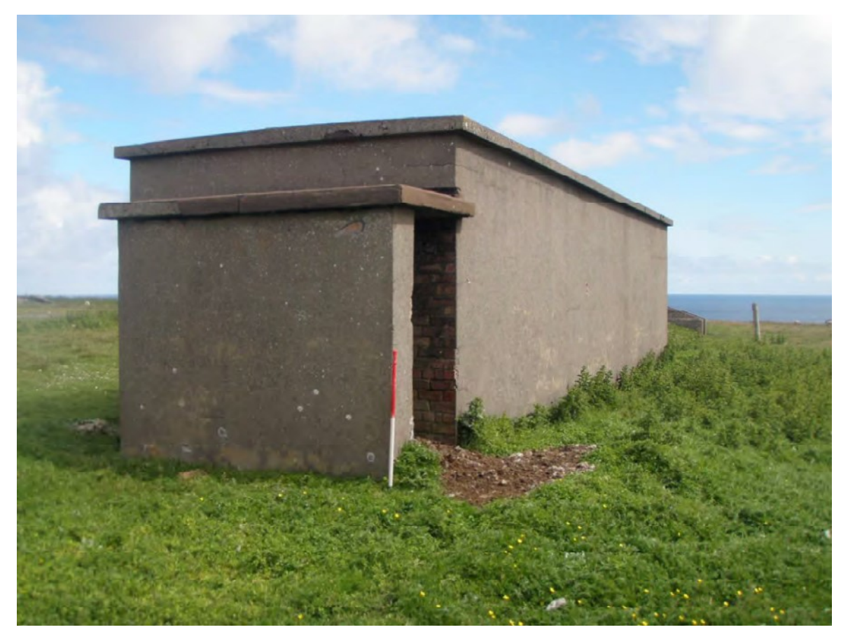
Plate 9: North-east facing view of the decontamination block (Site 130)