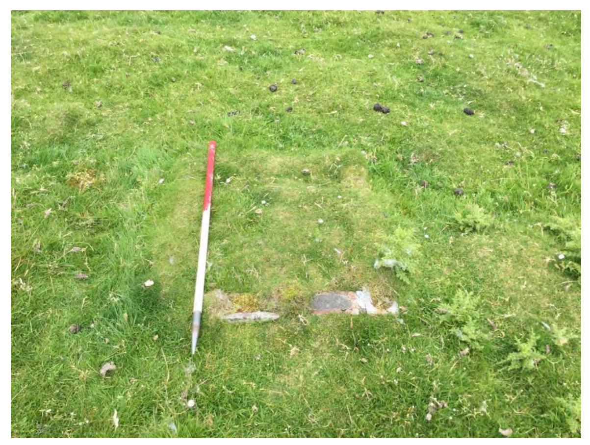
Plate 27: Detail of the overgrown brick structure at Site 449