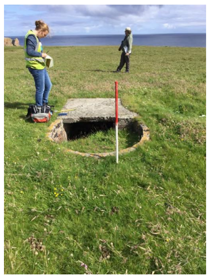
Plate 69: East facing view of Site 233