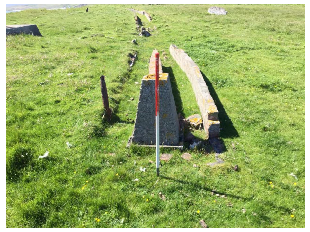
Plate 128: West facing view of channel (Site 254) from its origin at the centre of mast base (centred Site 144)