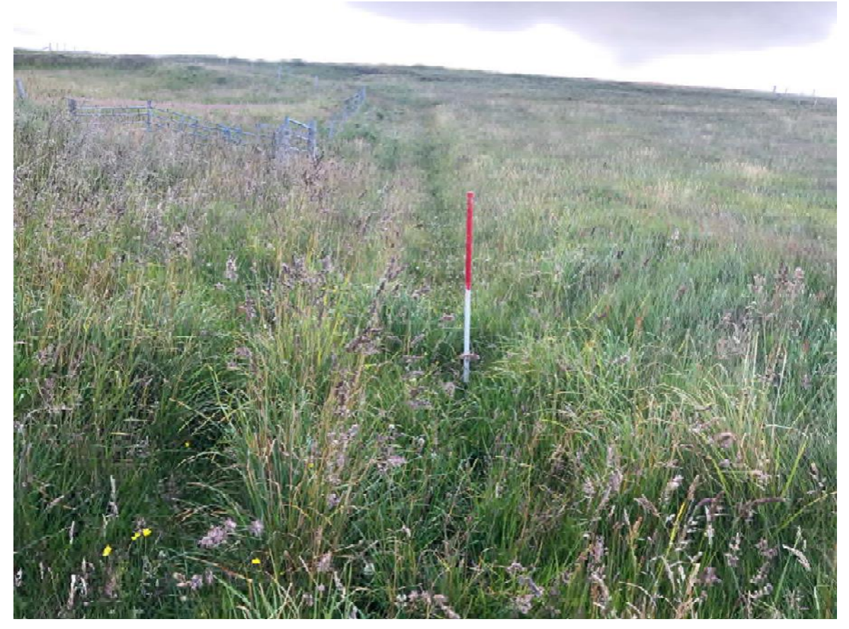
Plate 138: North-east facing view of the New Section of Access Road