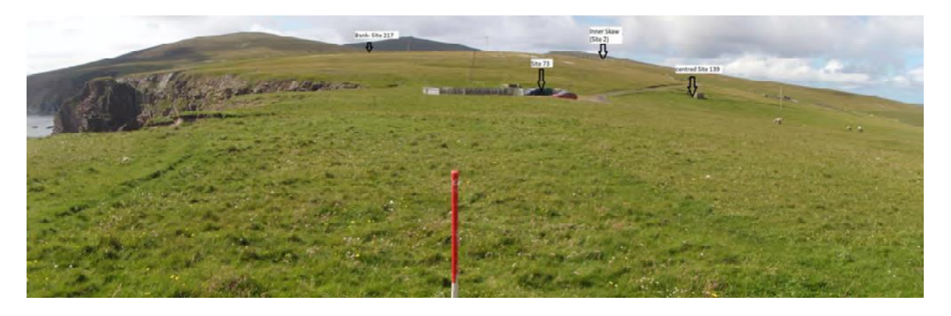
Plate 42: West facing view of the slope within the Veritcal Launch Space Port. The probable medieval or post-medieval field system is located on the upper slopes on the southern side of Lamba Ness (Sites 214-217 & 222)