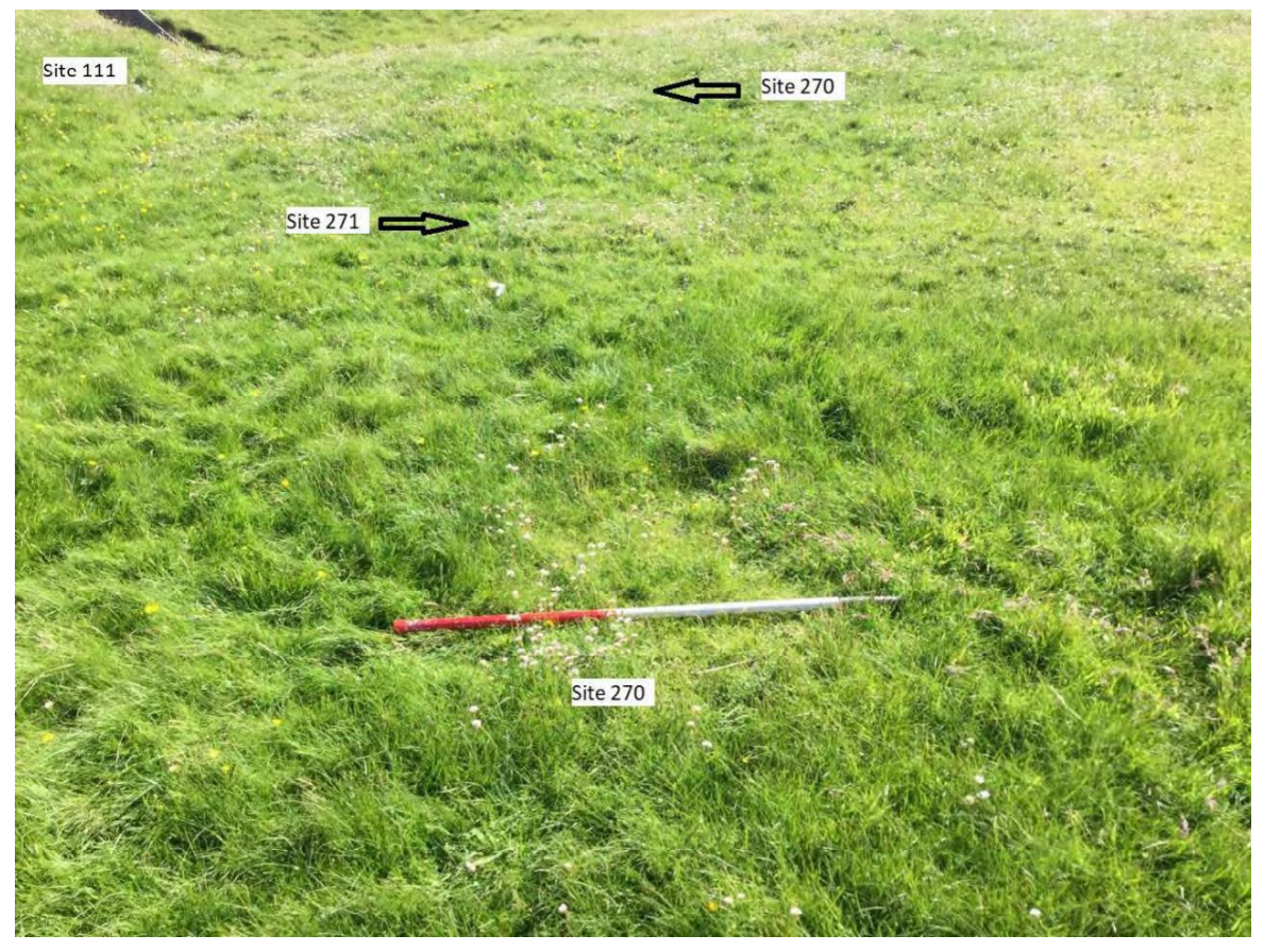
Plate 135: South-east facing view of the row of concrete blocks on the western side of the CH Transmitter block (Site 111)