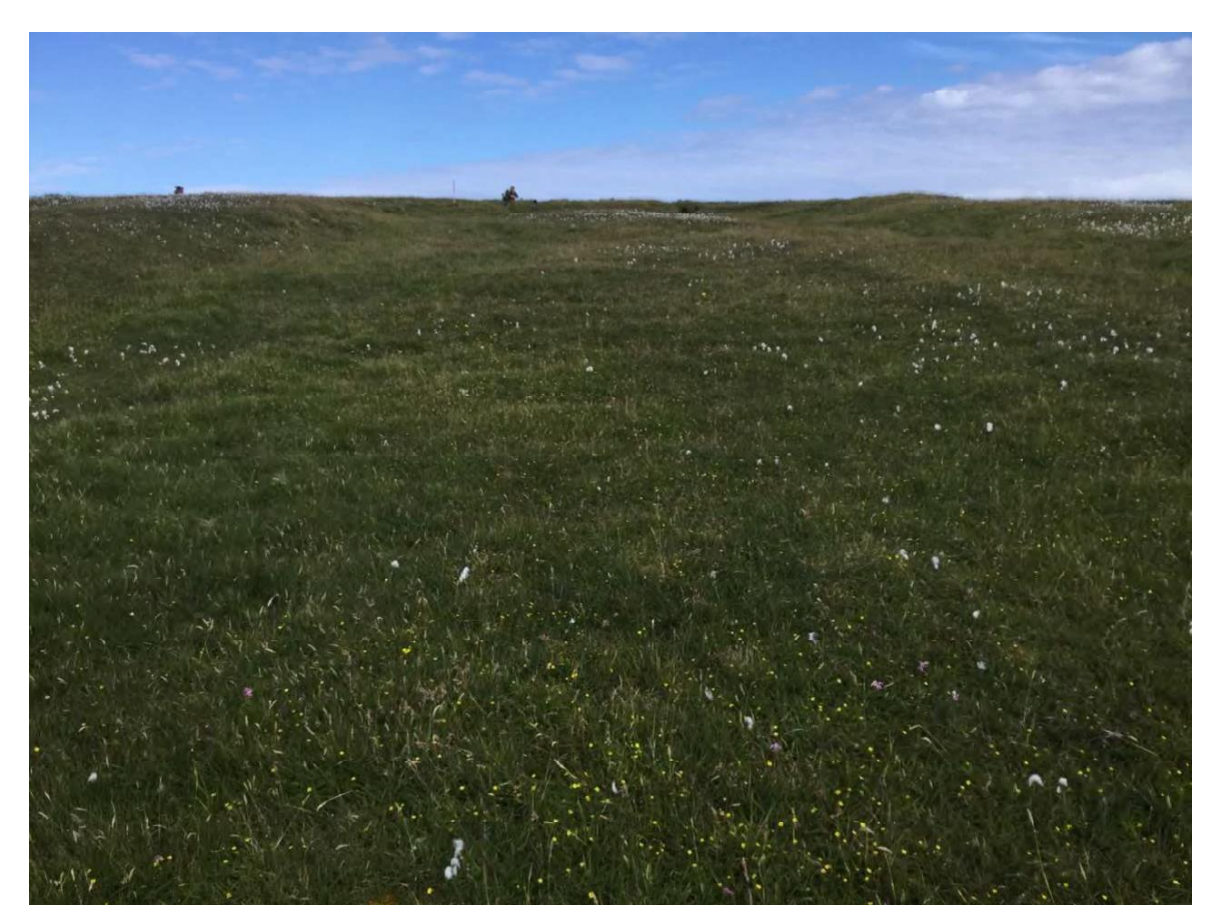
Plate 88: East facing view of excavated area (Site 373)