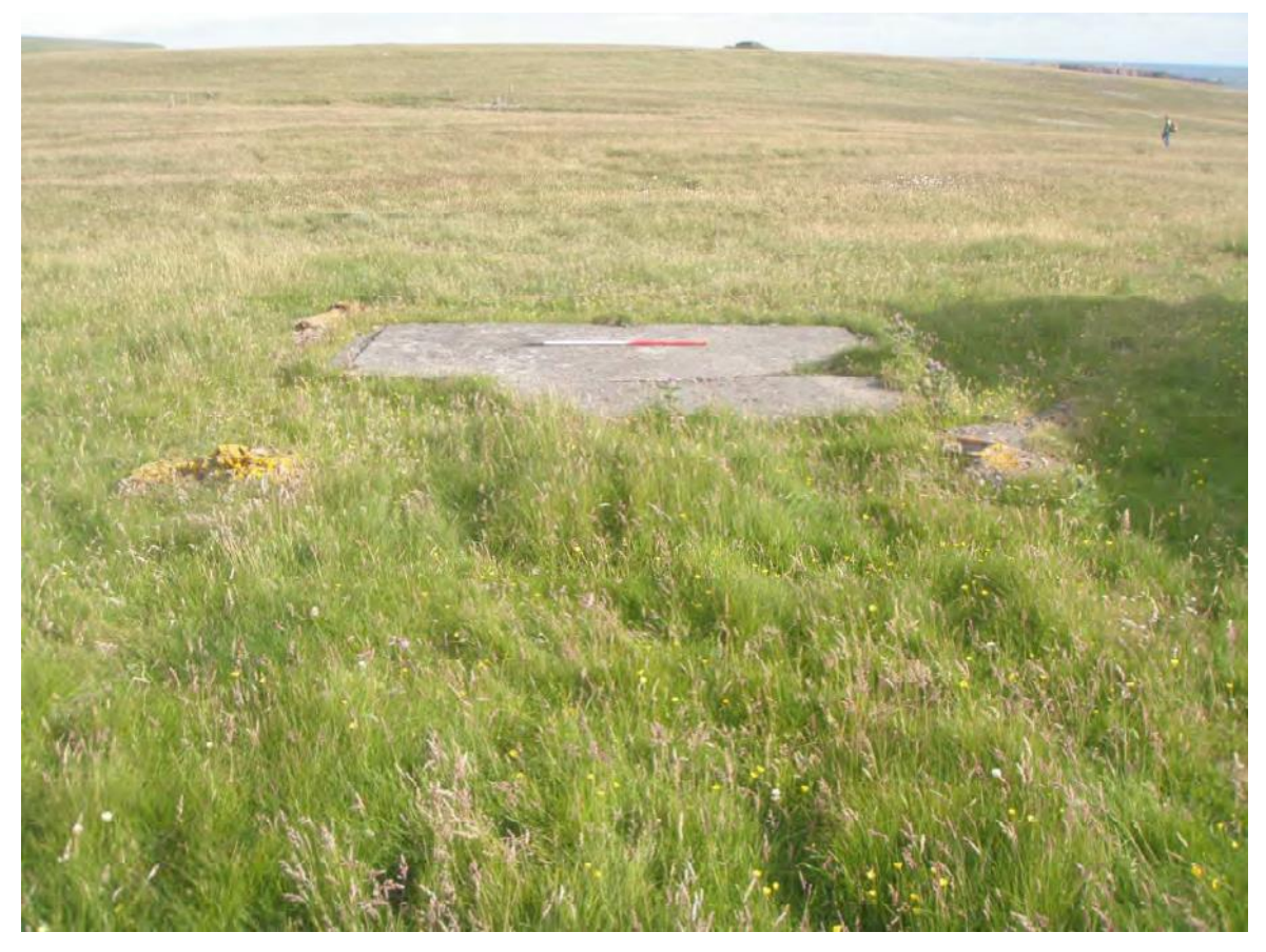
Plate 73: North facing view of concrete pad (Site 84b) with a concrete pipe (Site 428), originating from the south-east corner, visible