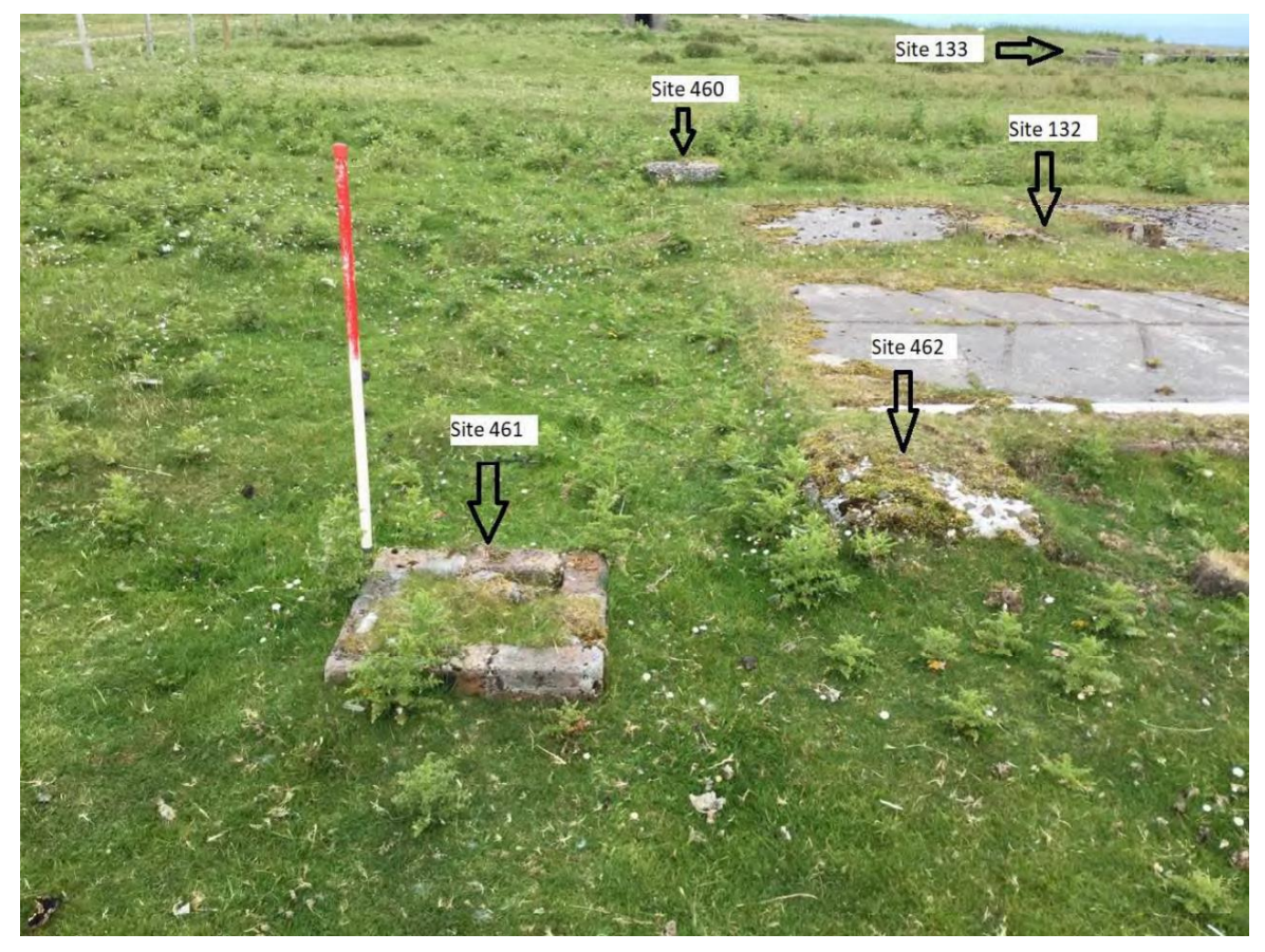
Plate 31: North facing view of the small, square brick structure at Site 461. The ablutions block (Site 132) can be see to to the right and two concrete blocks (Site 460 & 462) are also visible