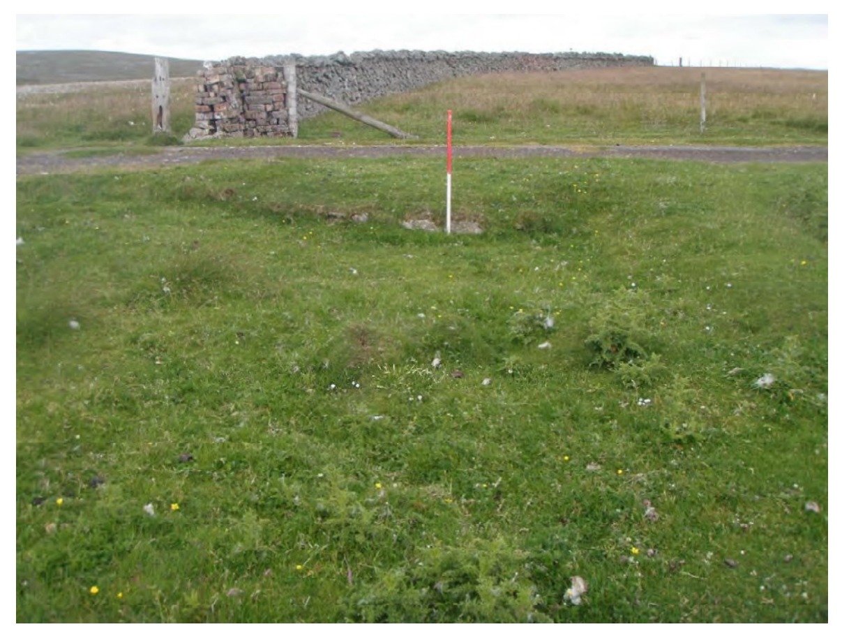
Plate 7: North facing view of the earthwork remains of the guard hut (Site 128)