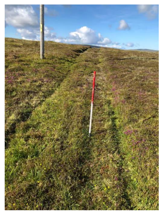
Plate 139: South-west facing view of the New Section of Access Road