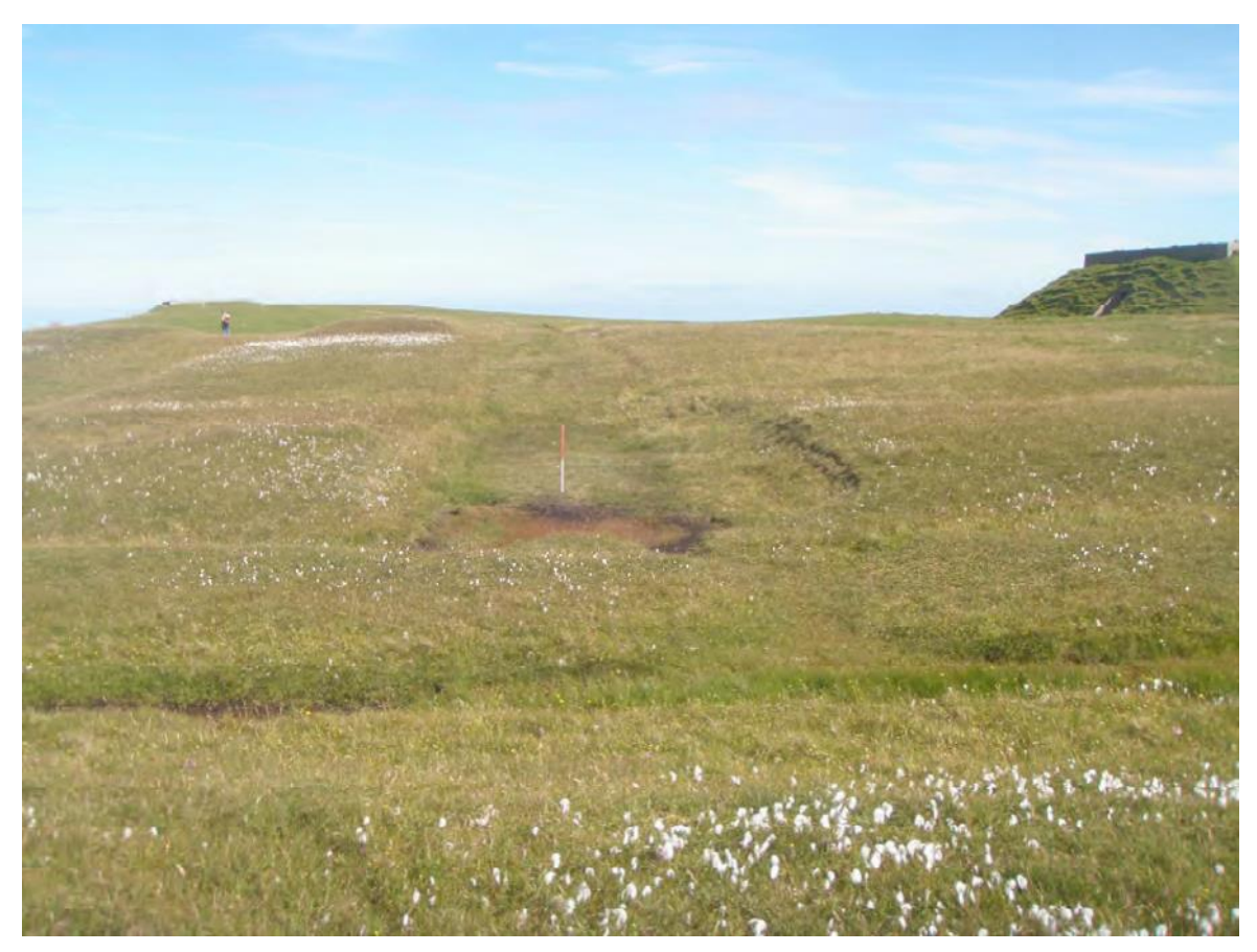
Plate 97: East facing view of large cut feature or negative earthwork (Site 410)