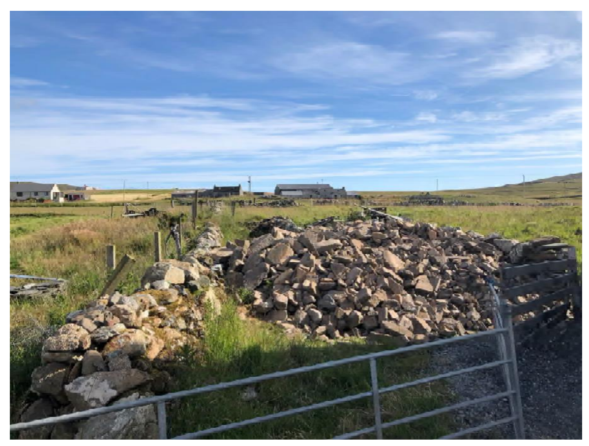
Plate 148: North-east facing view from the western elevation of the Category B Listed Papil (Site 5) towards the Site