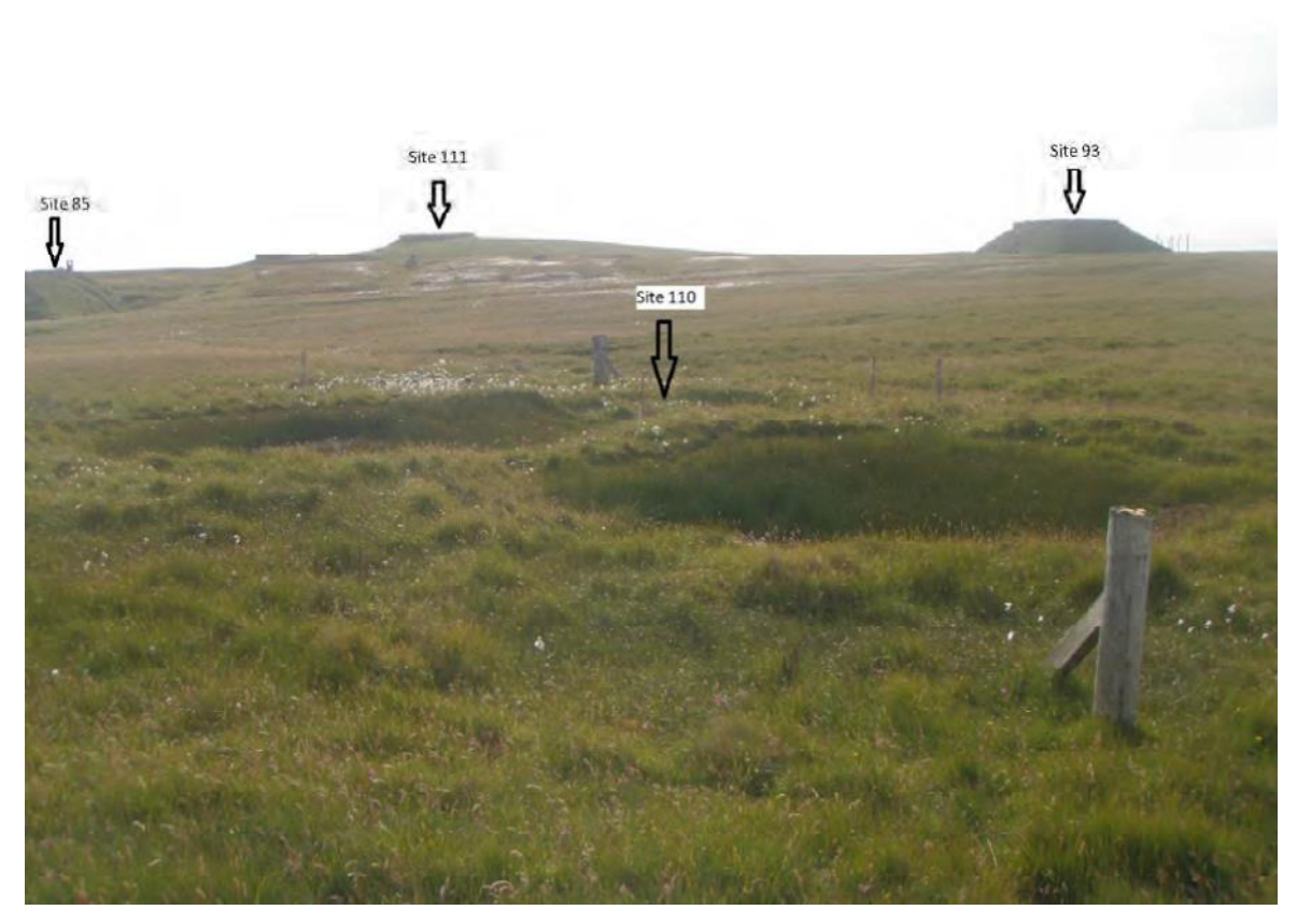
Plate 71: East facing view of two conjoined bomb craters (Site 110) with the CH generator (Site 93), Transmitter (Site 58) and Reciever (Site 111) block in rearground