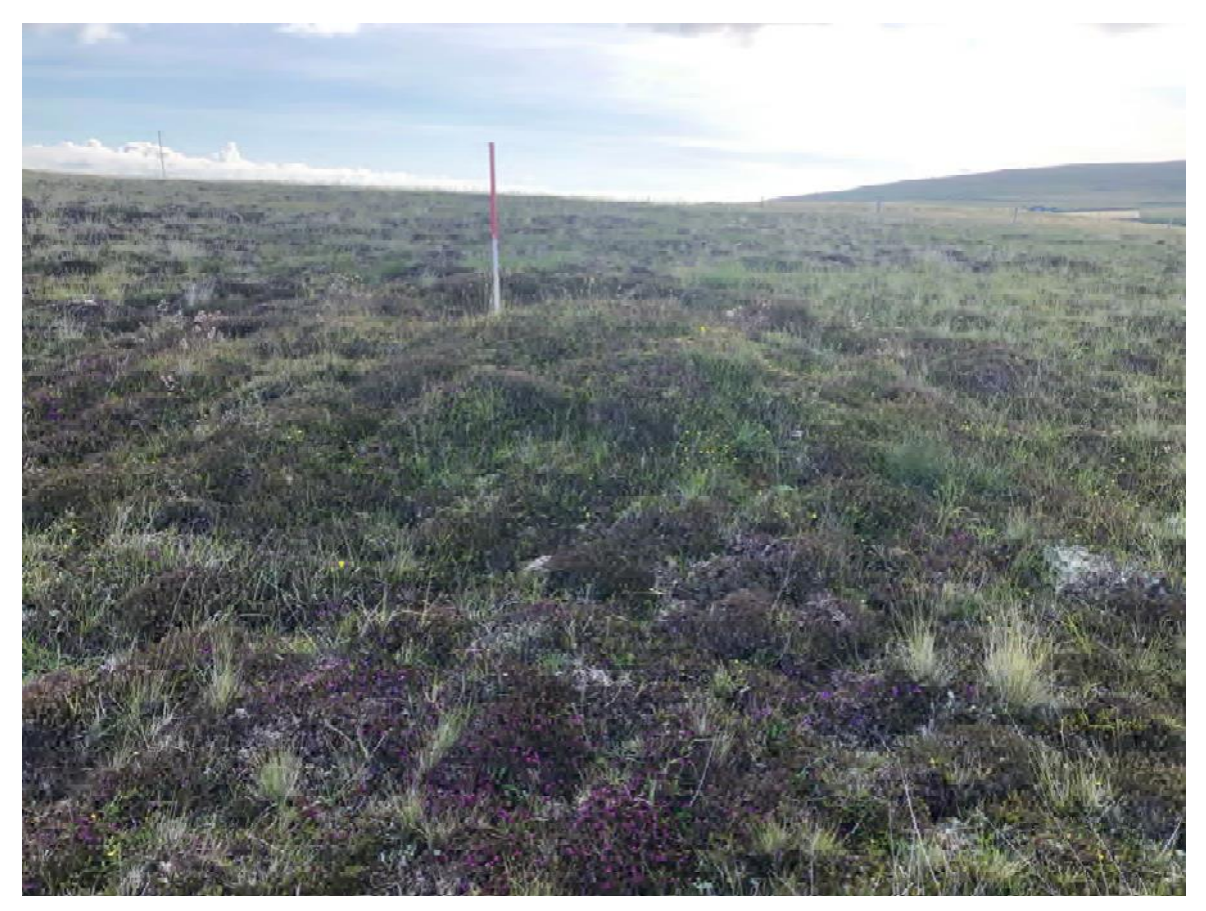
Plate 142: North-east facing view of quarry scoop (Site 401)