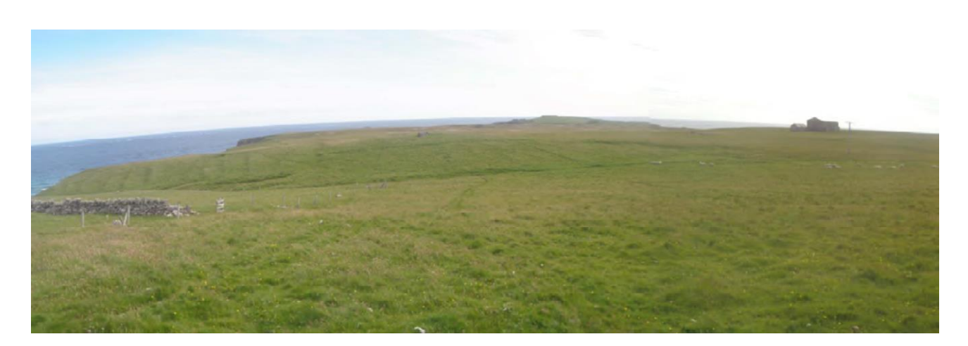
Plate 145: East facing view from the upstanding remains at Inner Skaw