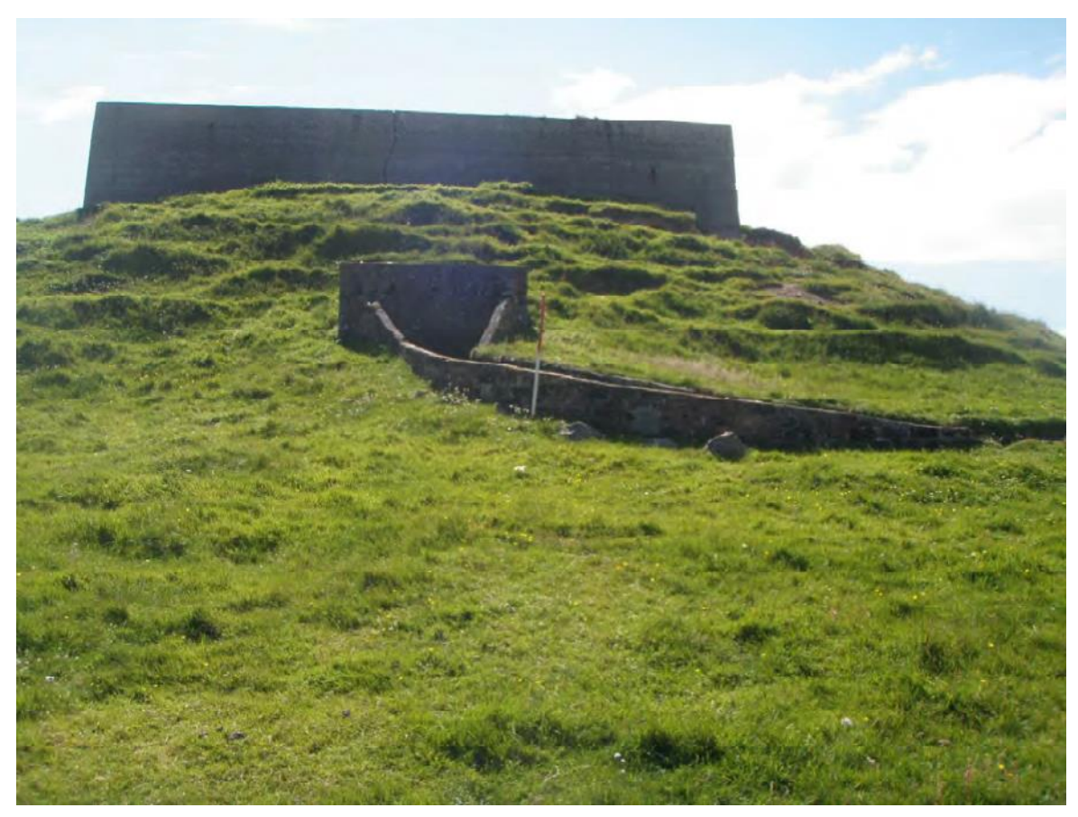
Plate 127: South facing view of channel (Site 237J) entering the CH Transmitter block (Site 111)