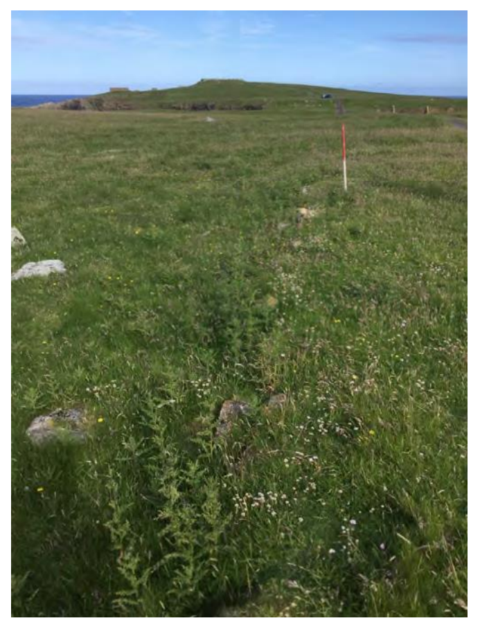
Plate 98: East facing view along the southern wall of a potential building (Site 92/419)