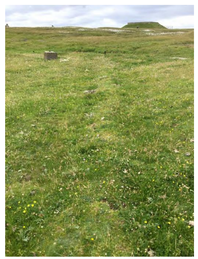
Plate 81: South-east facing view along a wall foundation (Site 291)