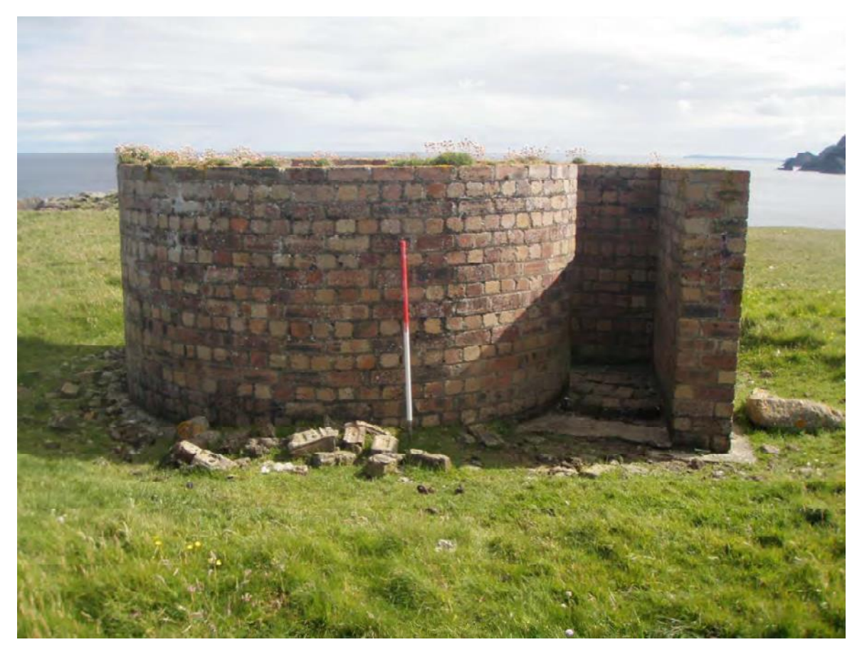
Plate 68: South-east facing view of a brick structure (Site 91)