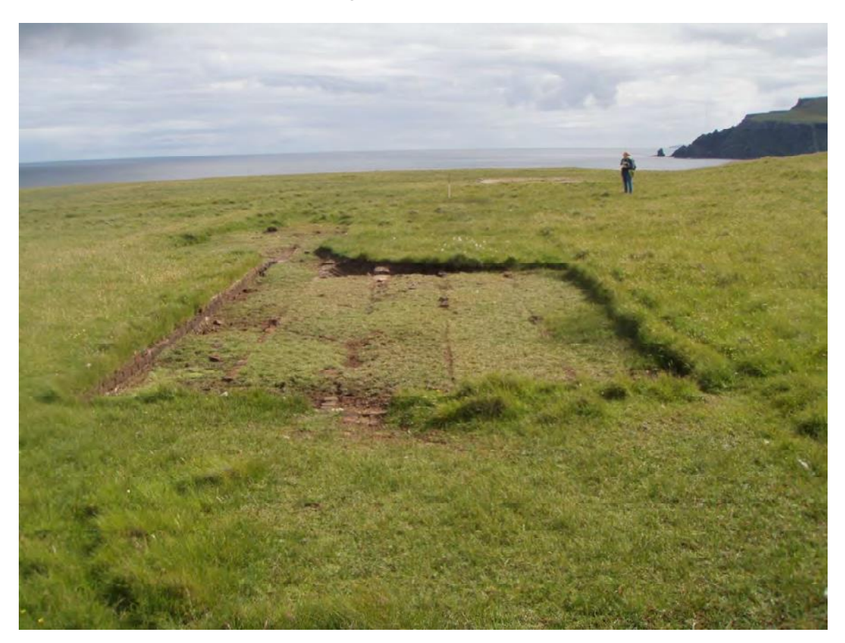
Plate 64: South-east facing view of an office, workshop and store (Site 109)