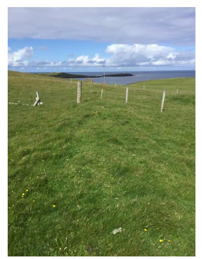
Plate 49: North-east facing view of a field bank (Site 230) with Site 74 in rearground