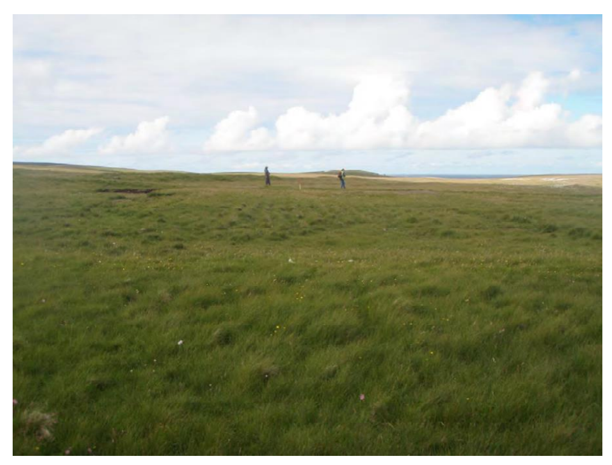
Plate 65: North facing view of the overgrown remains of a billet block (Site 106)