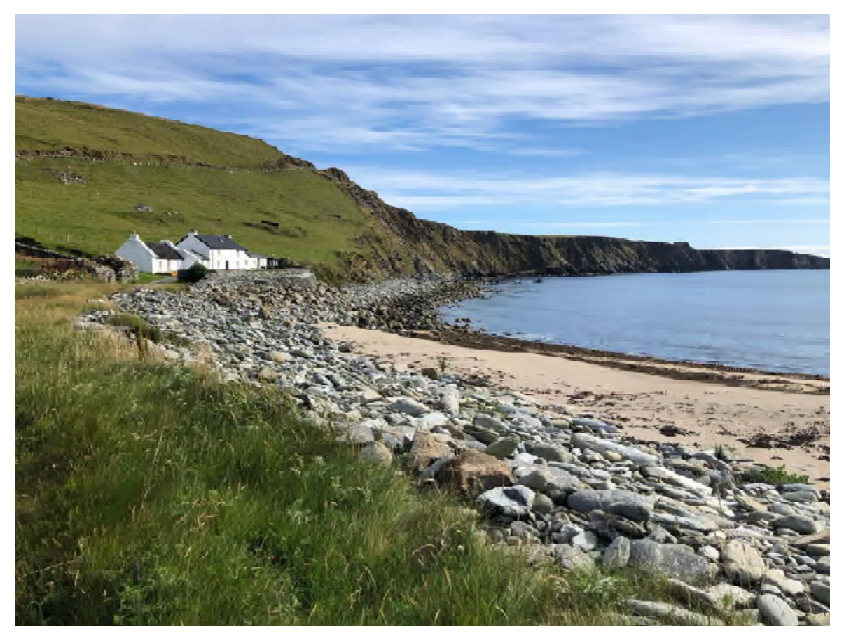
Plate 146: North-east facing view of the Category C Listed The Banks (Site 4)