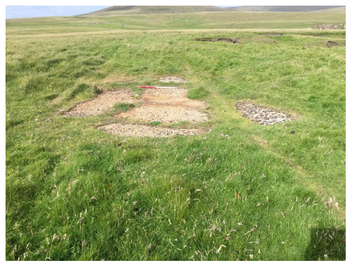
Plate 93: West facing view of concrete foundation (Site 433)