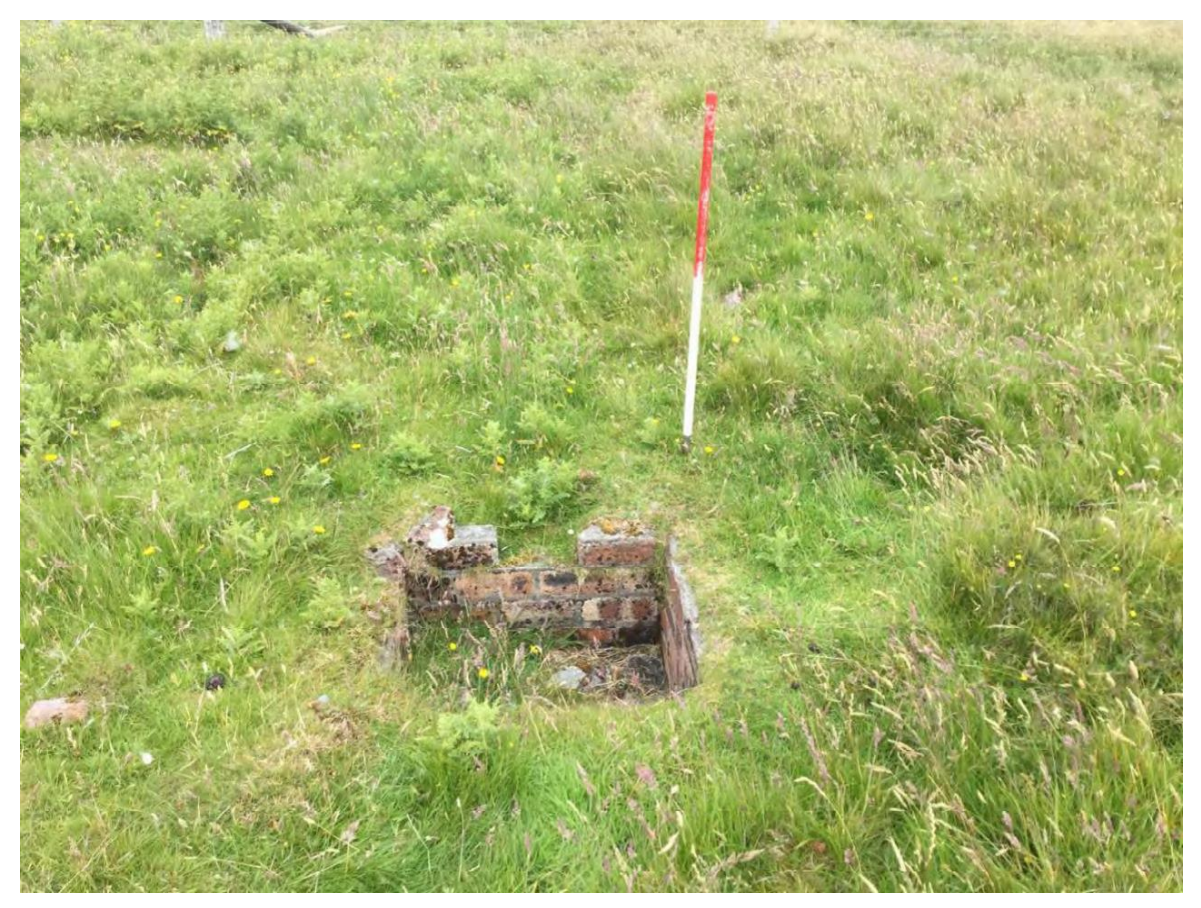
Plate 35: North facing view of brick structure (Site 467)