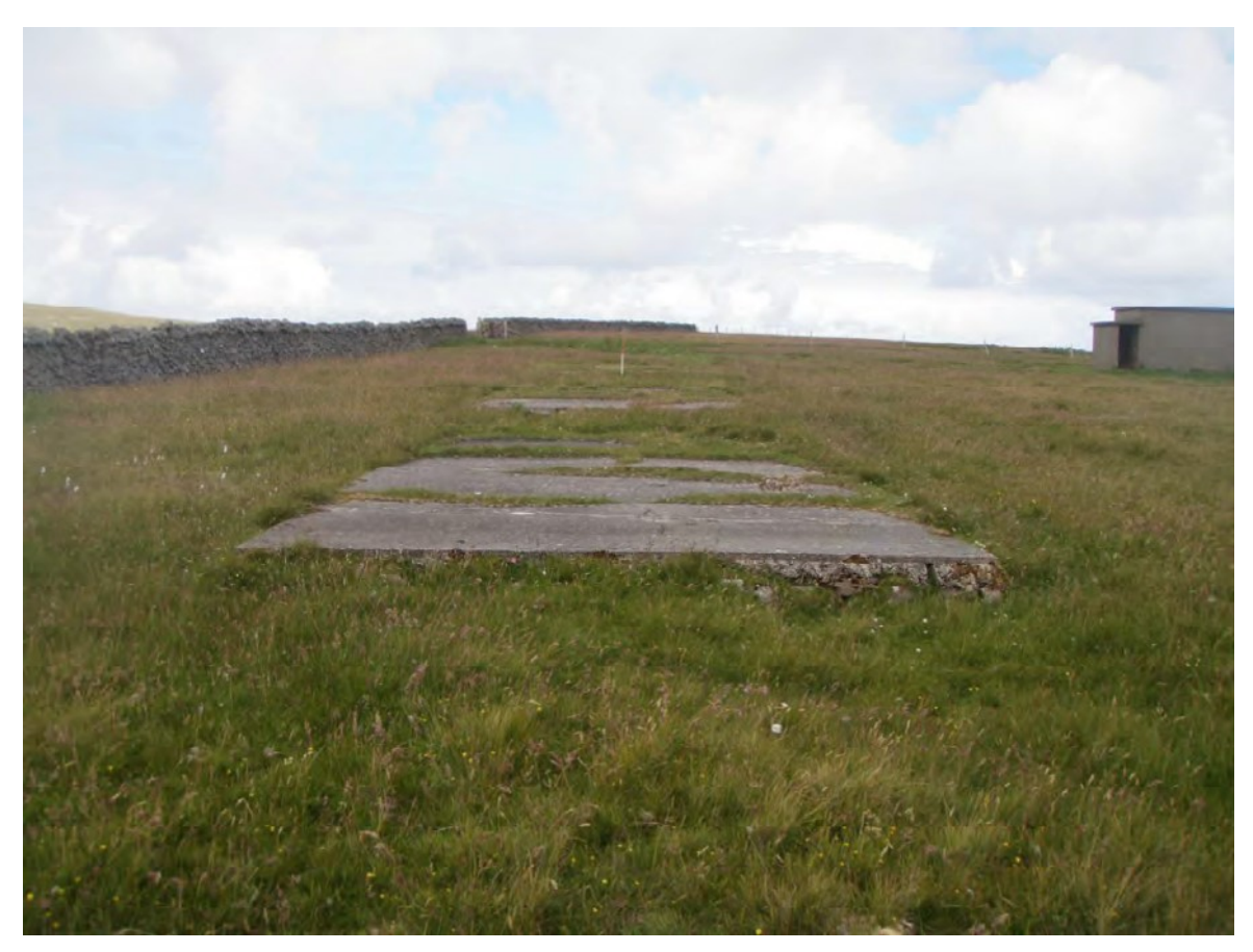
Plate 15: North facing view of the three concrete foundation remains of the stores (Sites 129a-c)