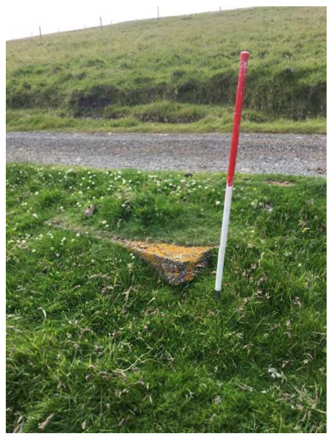
Plate 45: South-western view of concrete block (Site 222)