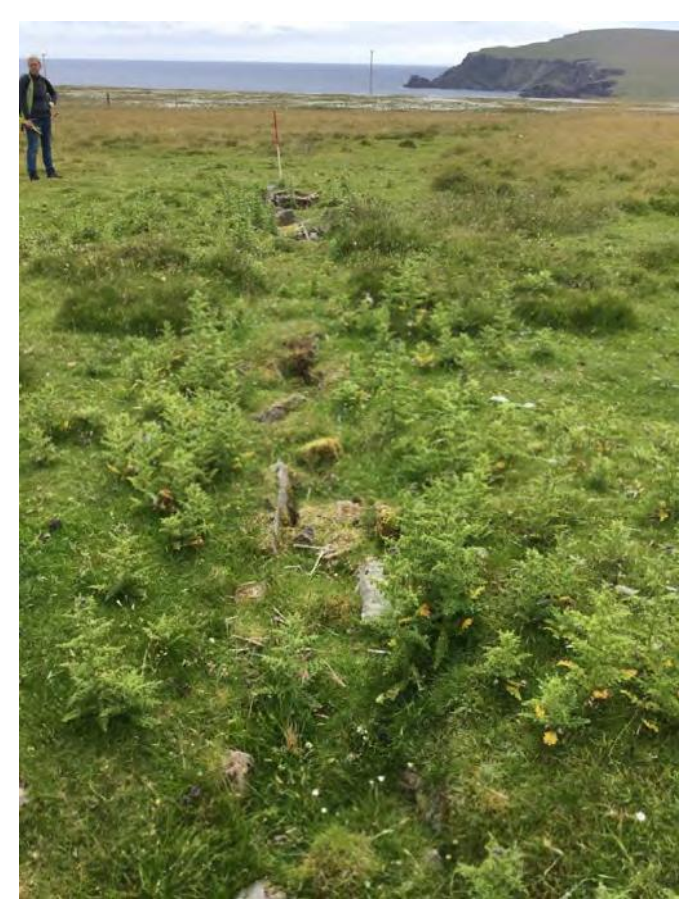
Plate 29: South-east facing view of a brick channel which terminates in a square brick structure (Site 478)