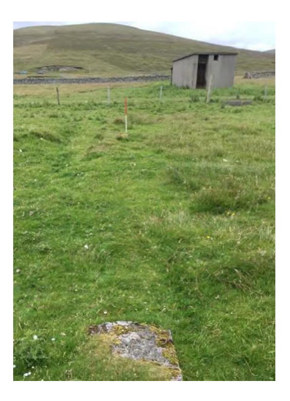
Plate 26: East facing view of the line of concrete blocks, Sites 450-452