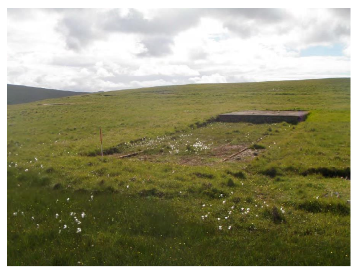
Plate 66: South-west facing view of the dining and cookhouse (Site 107)