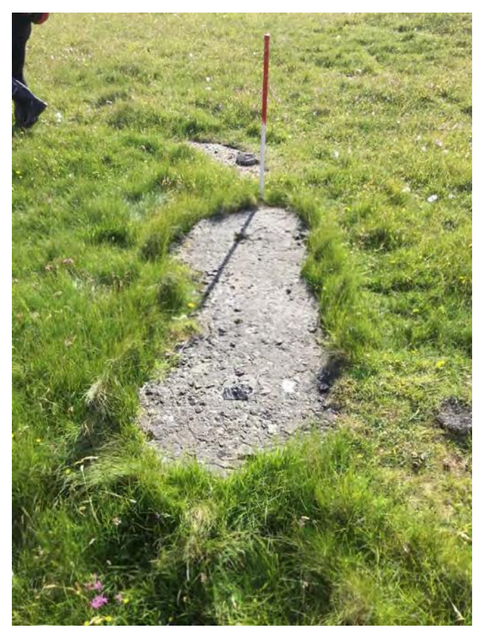
Plate 137: Detail of concrete block (Site 405)