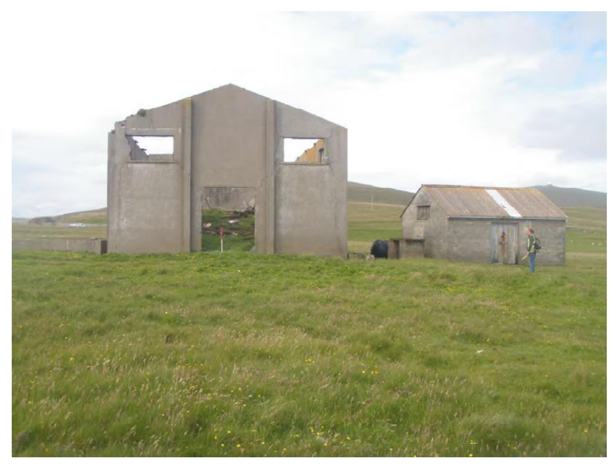
Plate 53: West facing view of the power house (Site 77) and roofed building (Site 77c)