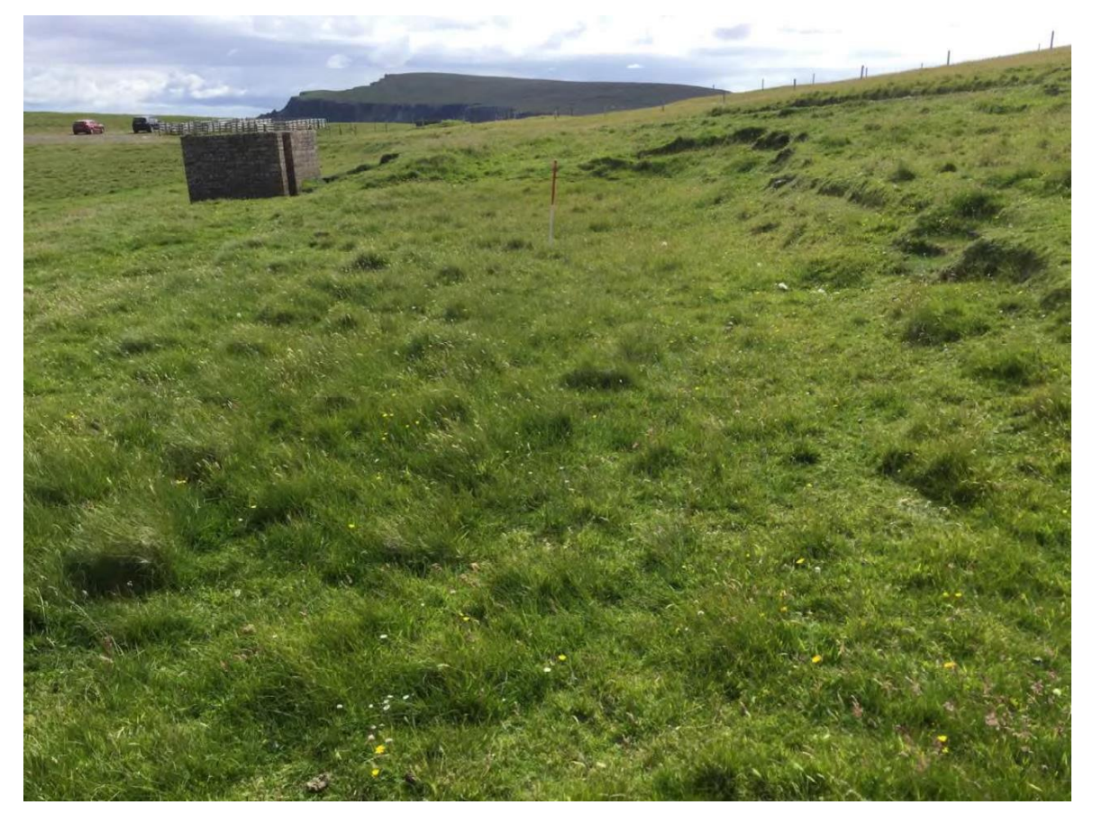
Plate 44: South facing view of platform (Site 228), with a probable air raid shelter (Site 71) at the southern end