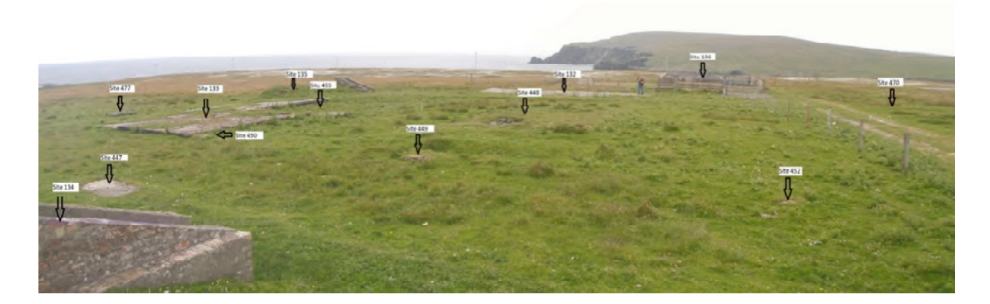
Plate 23: South-east facing view of the recreational area (Site 133) from former air raid shelter (Site 134)