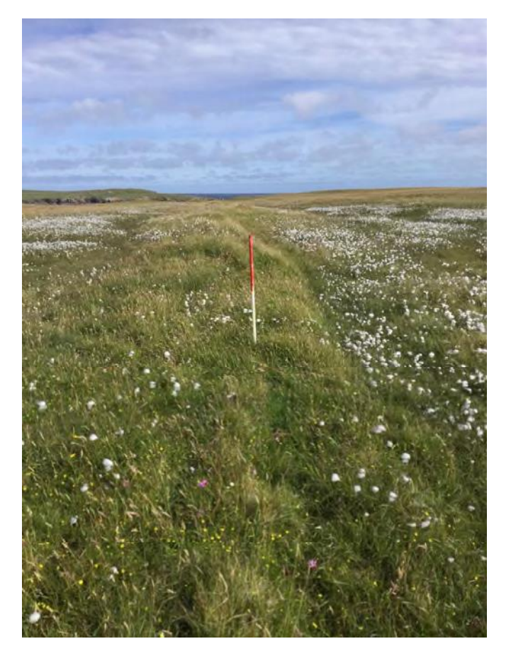
Plate 70: North facing view along a potential post-medieval field boundary (Site 434)