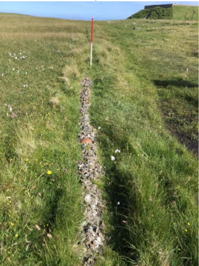
Plate 100: South-east facing view of pipe (Site 411) which may connect to the probable toilets (Sites 412-4)