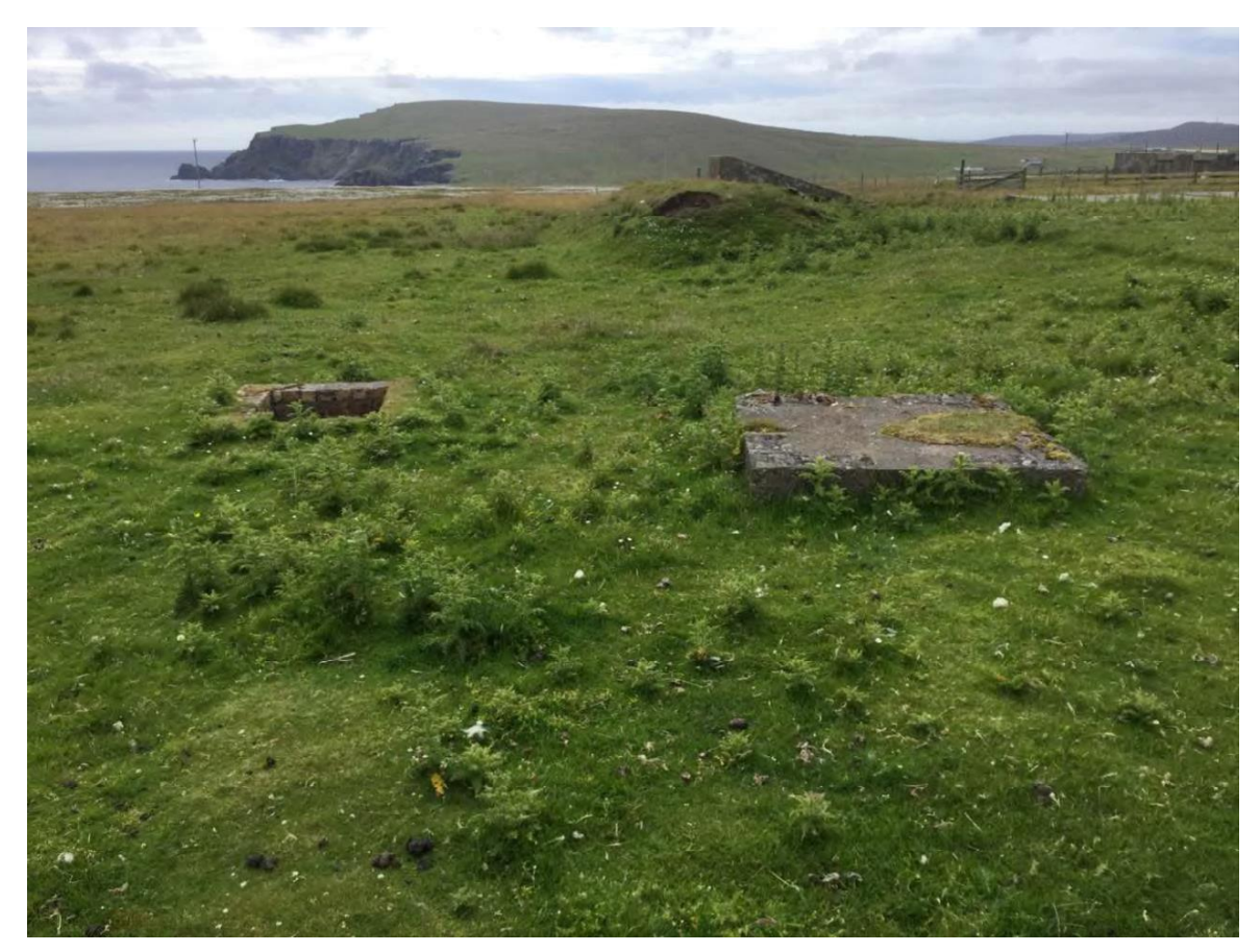
Plate 28:South facing view of a concrete block (Site 477), a brick structure (Site 476), with the former air raid shelter (Site 135) in the rearground