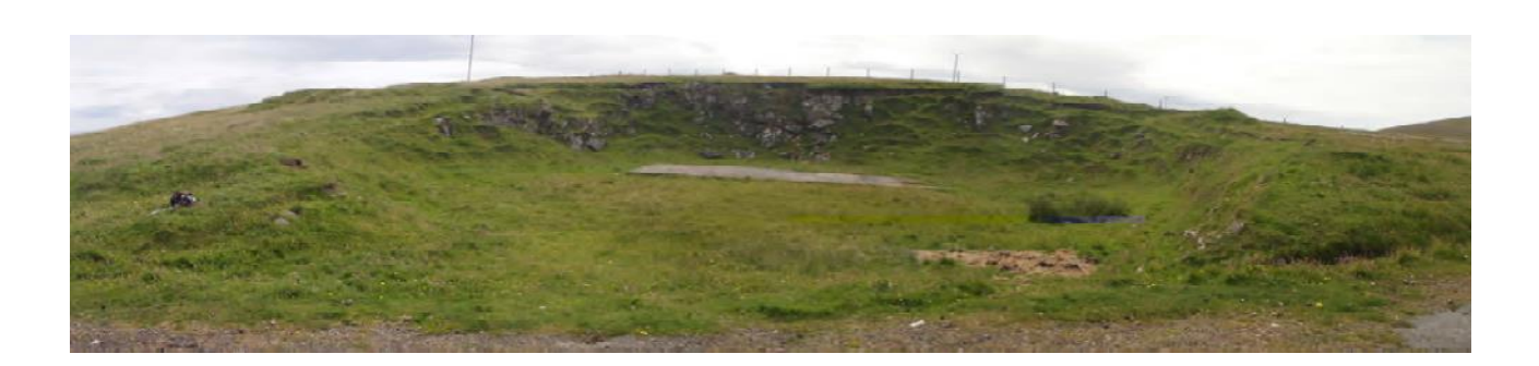
Plate 39: South facing view of a former quarry (Site 62), in which the foundation remains of a maintenance workshop (Site 70) were constructed