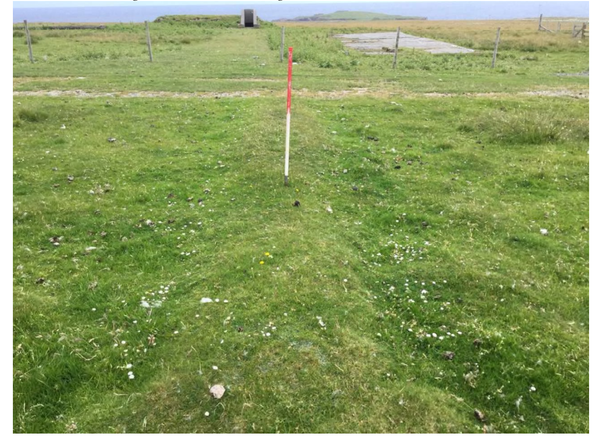
Plate 18: East facing view of overgrown linear foundation (Site 472), an example of three (Sites 470 & 475). A former air raid shleter (Site 135) and the foundation reamins of the abultions block (Site 132) are visible in the rearground as is part of the north-south aligned pathway