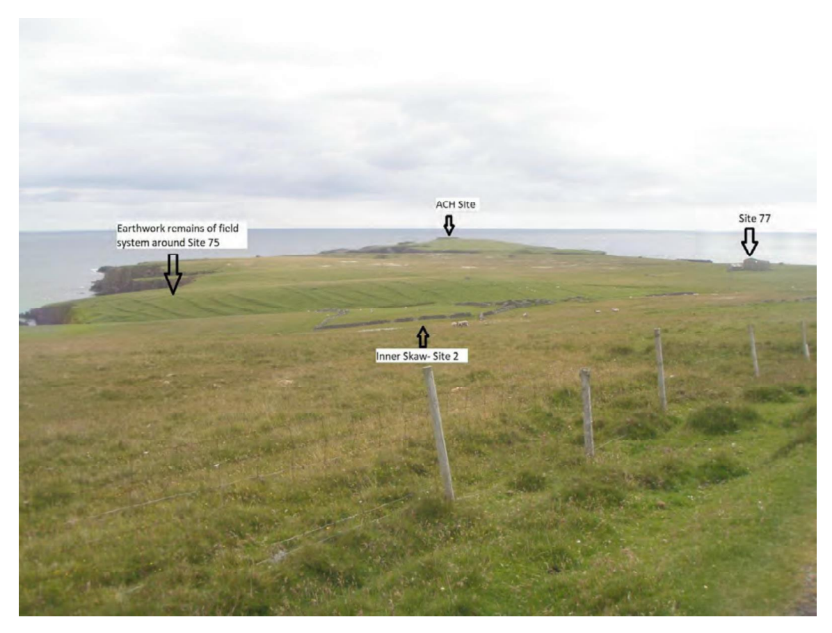
Plate 41: East facing view from land east of Priest House (Site 62), showing the lower lying ground further eastward along the penninsula of Lamba Ness