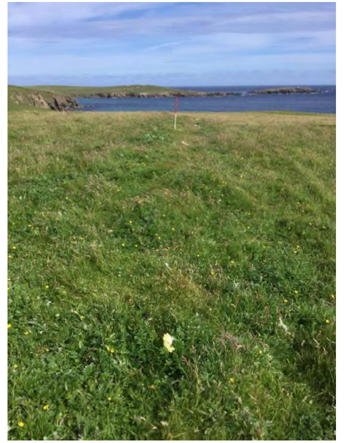
Plate 60: North facing view of field boundary (Site 437), which appears to be composed of an overgrown dry stone wall

Plate 59: West facing view of a dry stone structure (Site 75) within a field system. The structure (Site 75) is located within the Scheduled Monument of Inner Skaw (centred Site 2) which can be seen in the rearground