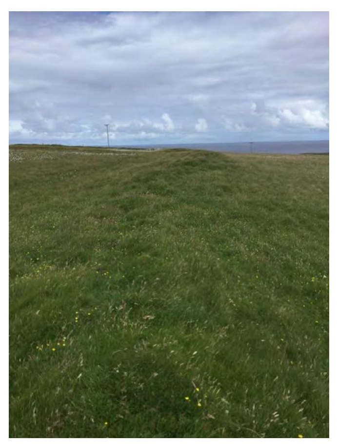
Plate 40: North-east facing view along a degraded turfed bank (Site 217) towards a potential sheep pen (Site 217a)