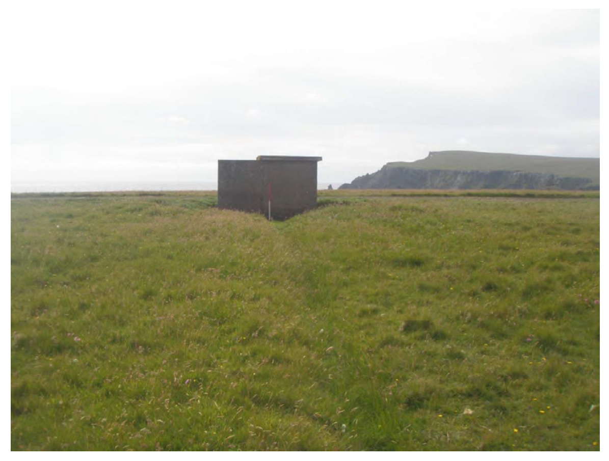
Plate 57: South facing view of channel, potentially a service channel to the north of the guard hut (Site 82)