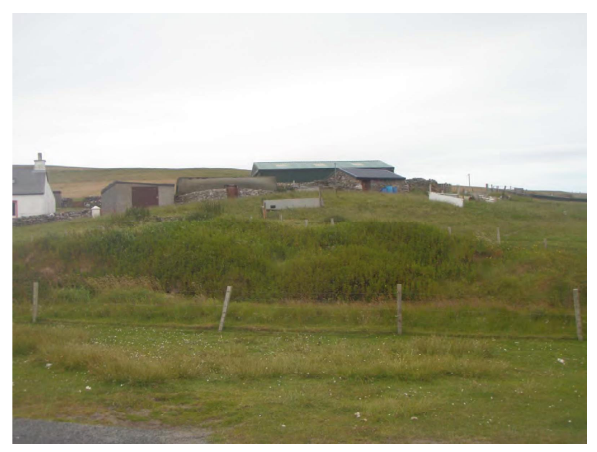
Plate 149: North facing view of the Category C Listed Boat-roofed shed (Site 6)