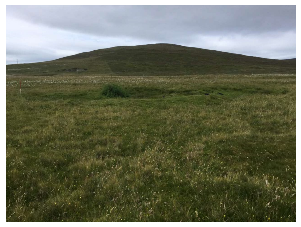
Plate 11: West facing view of probable bomb crater (Site 481)