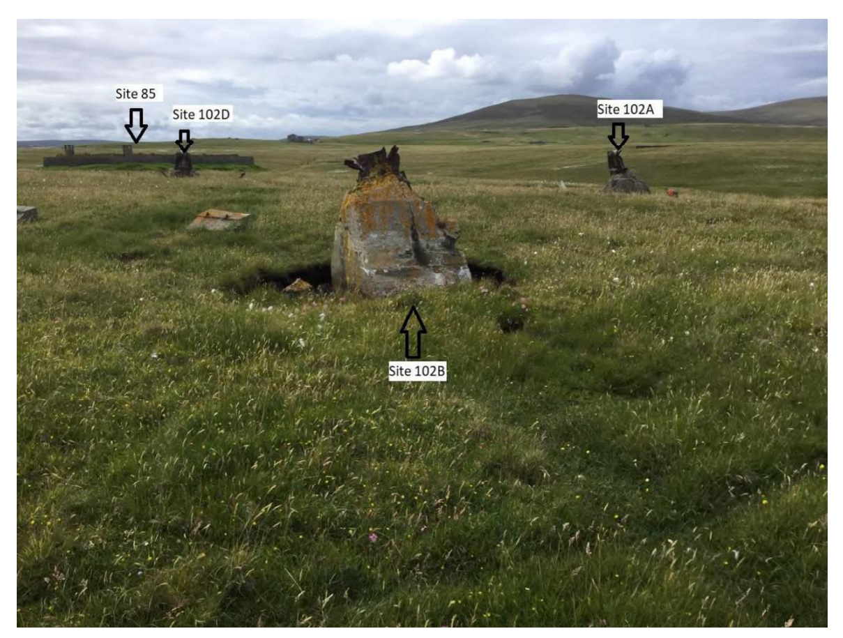
Plate 85: South-west facing view of a mast base (centred Site 102)