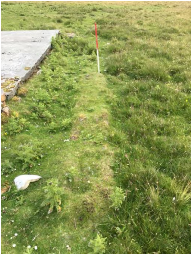
Plate 32: East facing view of overgrown brick channel (Site 464) to the south of the ablutions block (Site 132)