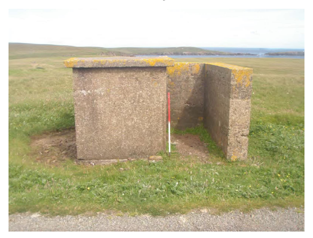
Plate 56: North facing view of guard hut (Site 82)