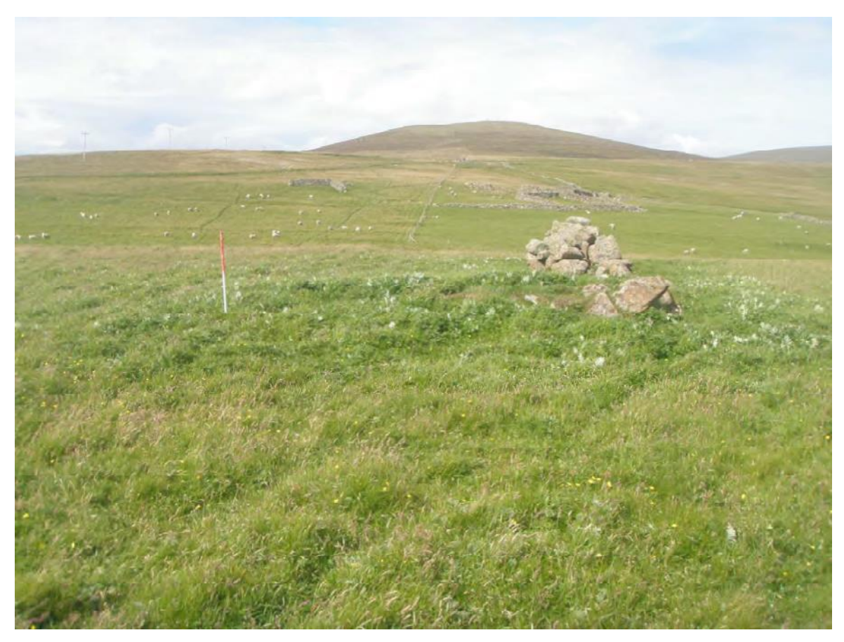
Plate 59: West facing view of a dry stone structure (Site 75) within a field system. The structure (Site 75) is located within the Scheduled Monument of Inner Skaw (centred Site 2) which can be seen in the rearground