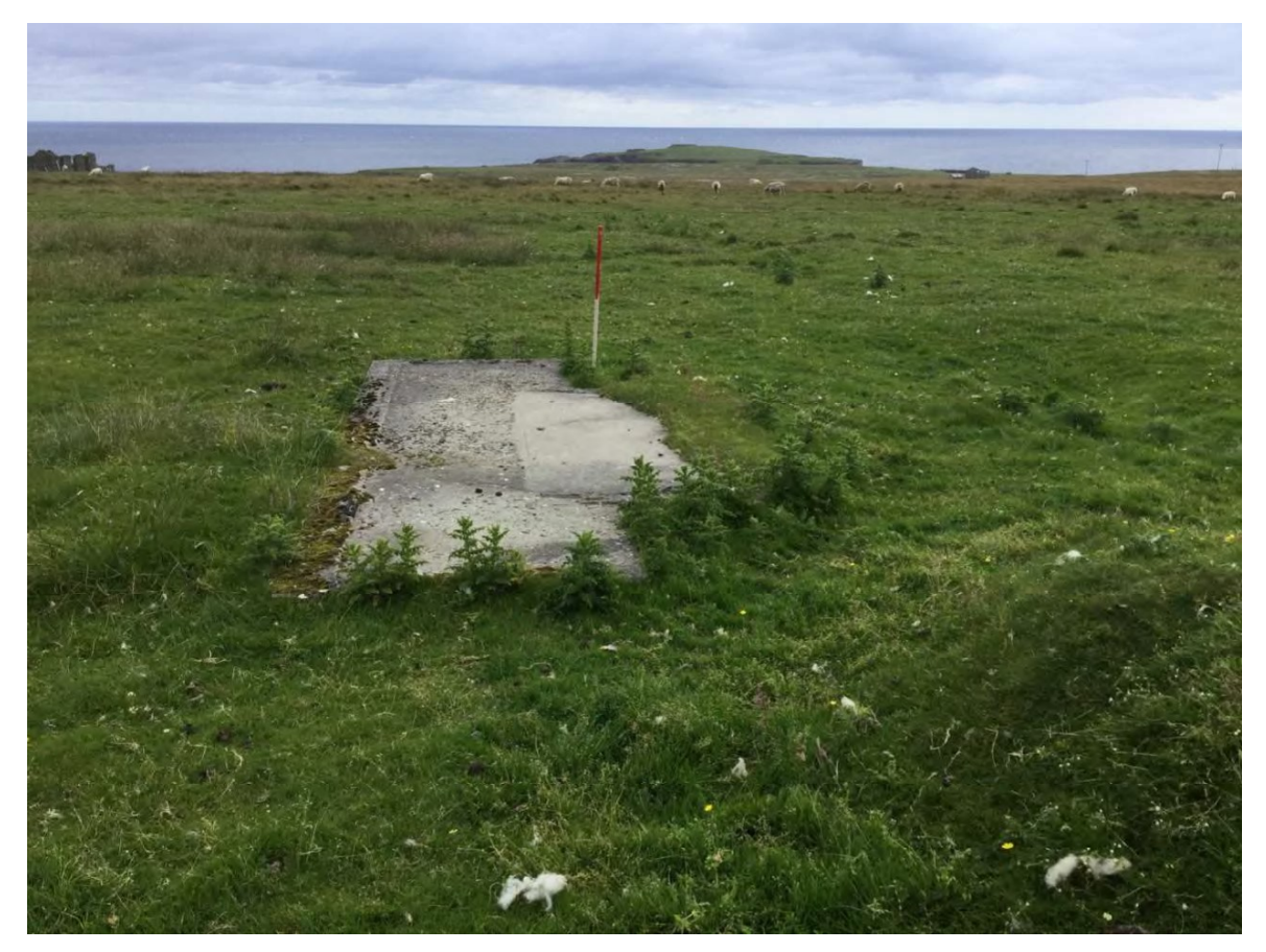
Plate 24: East facing view of a concrete foundation (Site 307)