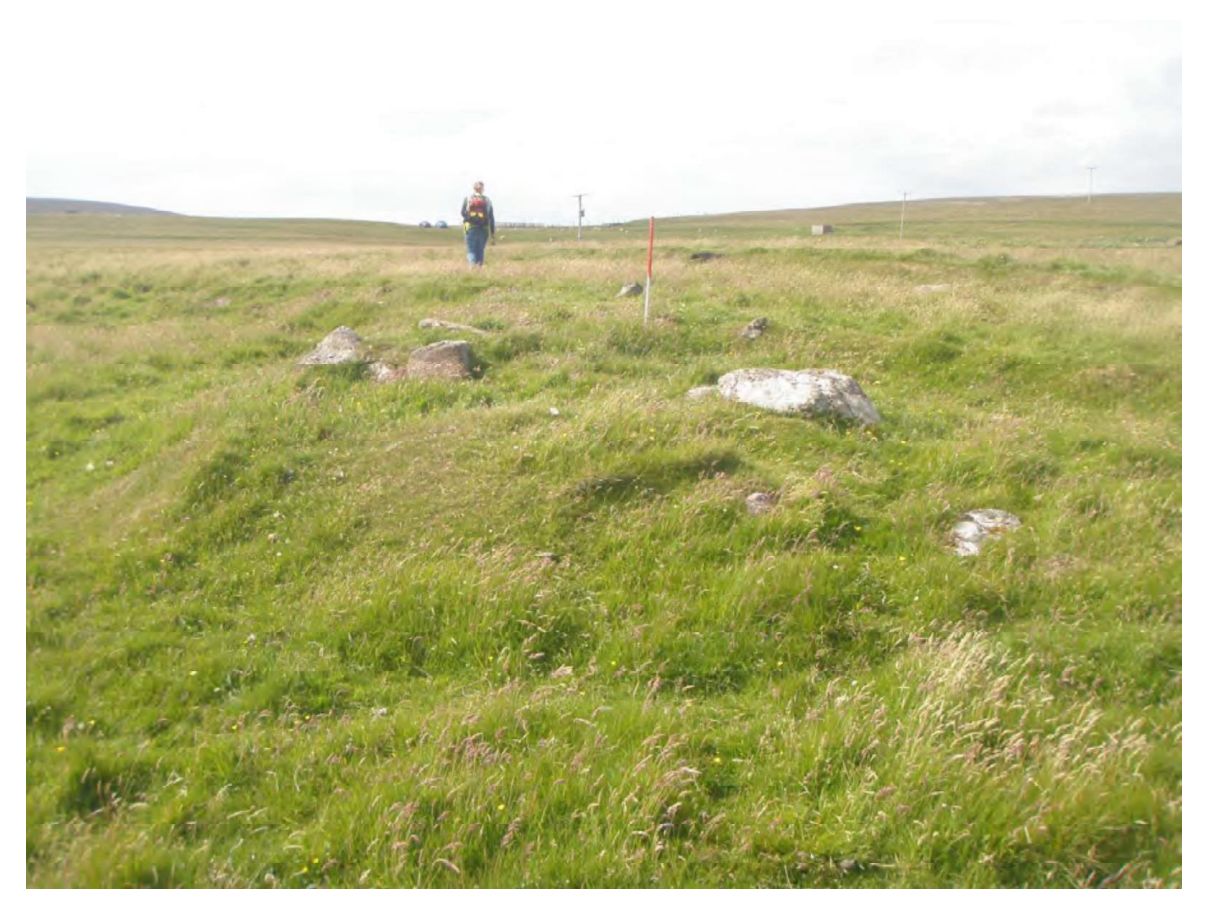
Plate 61: South-west facing view of a small cairn (Site 9)