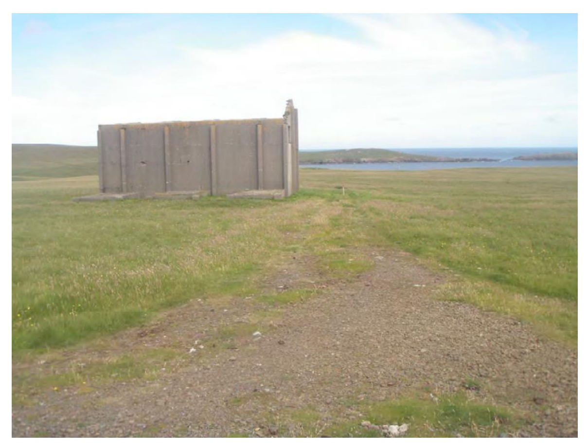
Plate 52: North facing view of the power house (Site 77), with its three concrete platforms and the northwards extending track (Site 77d)