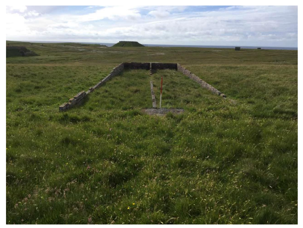
Plate 92: South-eastern view of a billet block (Site 86a)