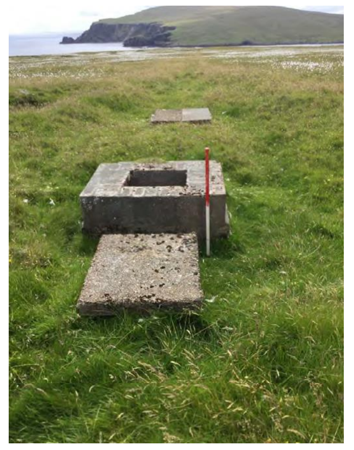
Plate 36: South facing view of concrete structures Sites 207, 208 & 210