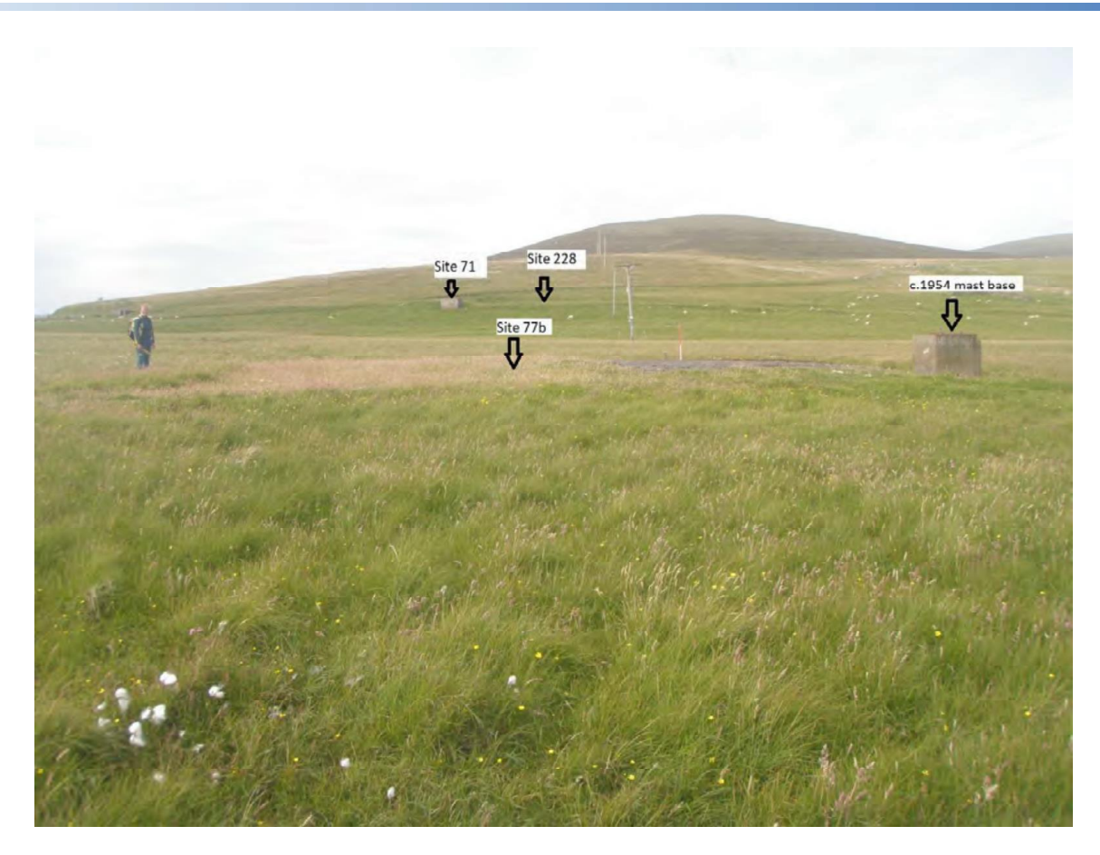
Plate 55: West facing view of Site 77b