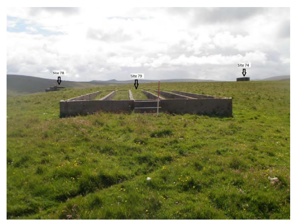
Plate 50: South-west facing view of a small domestic site (centred Site 79) with defensive structures