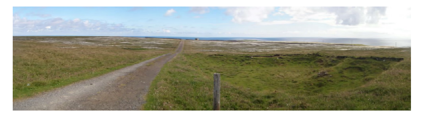
Plate 4: East facing view from the western boundary of the Vertical Launch Space Port. The quarry (Site 201) is visible, as it the dry stone wall (centred Site 104) and the decomtamination building (Site 130) is visible beyond the wall