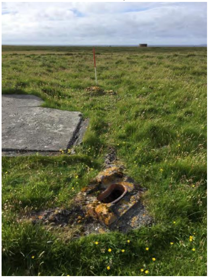
Plate 74: South-east facing view of pipe (Site 427) on the western side of a concrete pad (Site 84b)