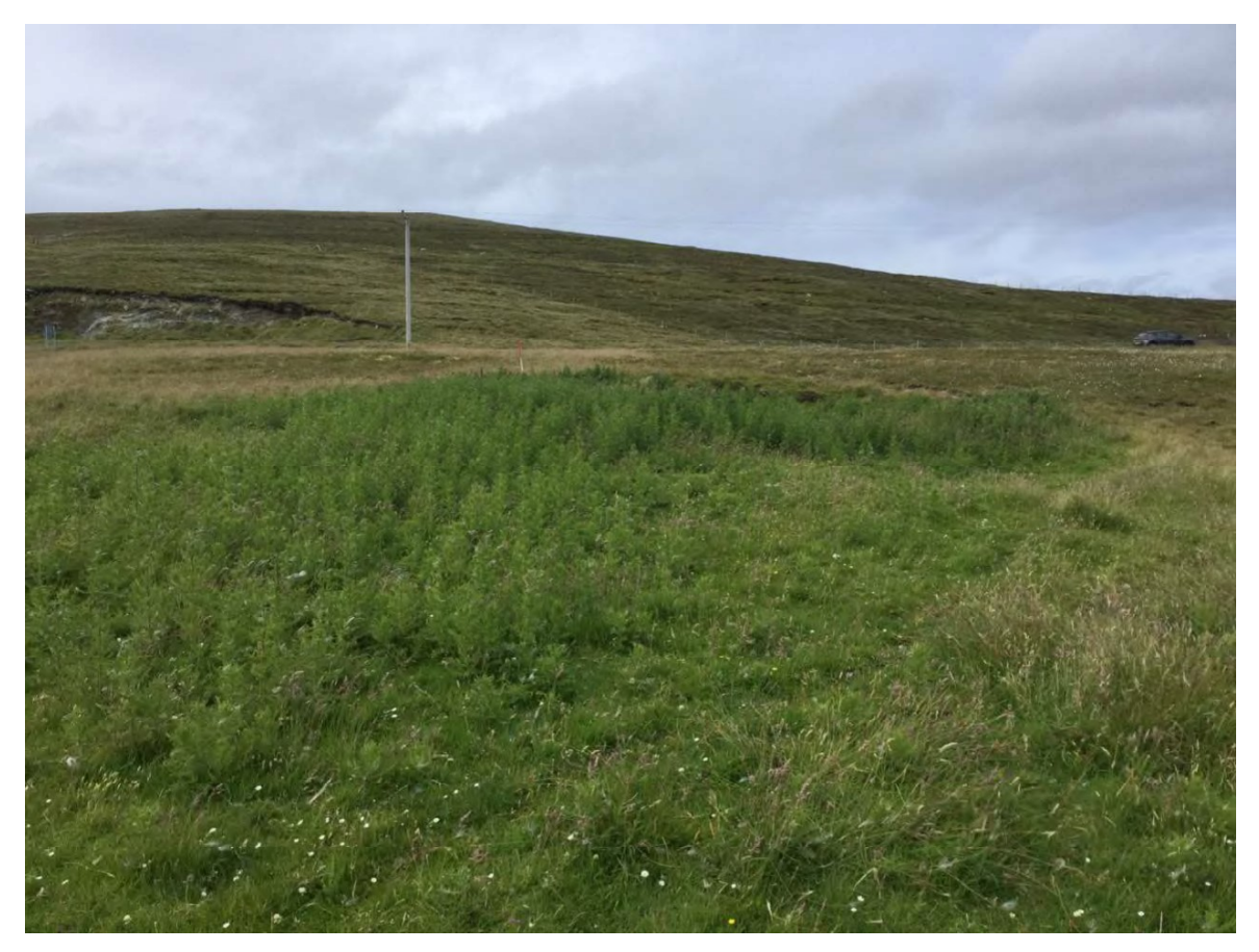
Plate 2: North-west facing view of the quarry or bomb crater north of the track (Site 445)