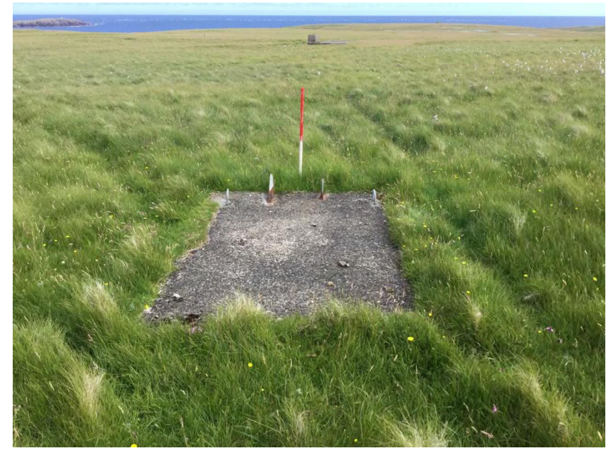
Plate 58: East facing view of concrete block (Site 443) towards Ste 77b. Site 443 is an example of the concrete blocks found to the west, north and east of a 1950s mast base