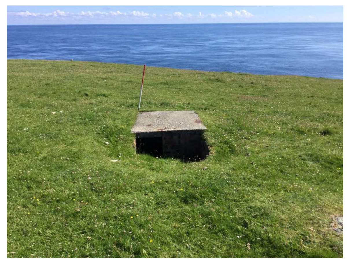
Plate 131: East facing view of probable light gun emplacement (Site 263)