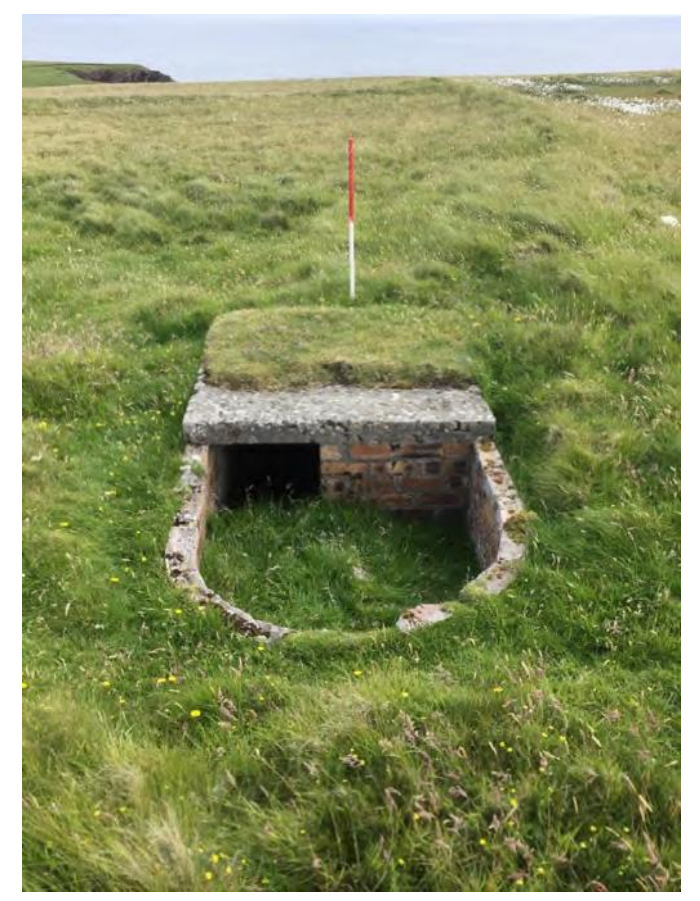
Plate 43: South-east facing view of brick, concrete capped struture (Site 218)