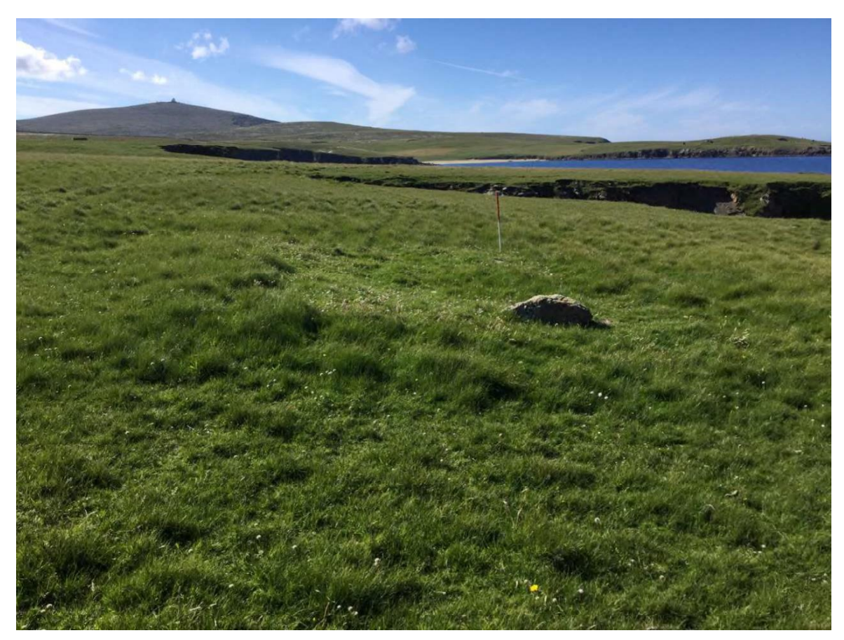
Plate 89: West facing view of potential gun emplacement (Site 288)