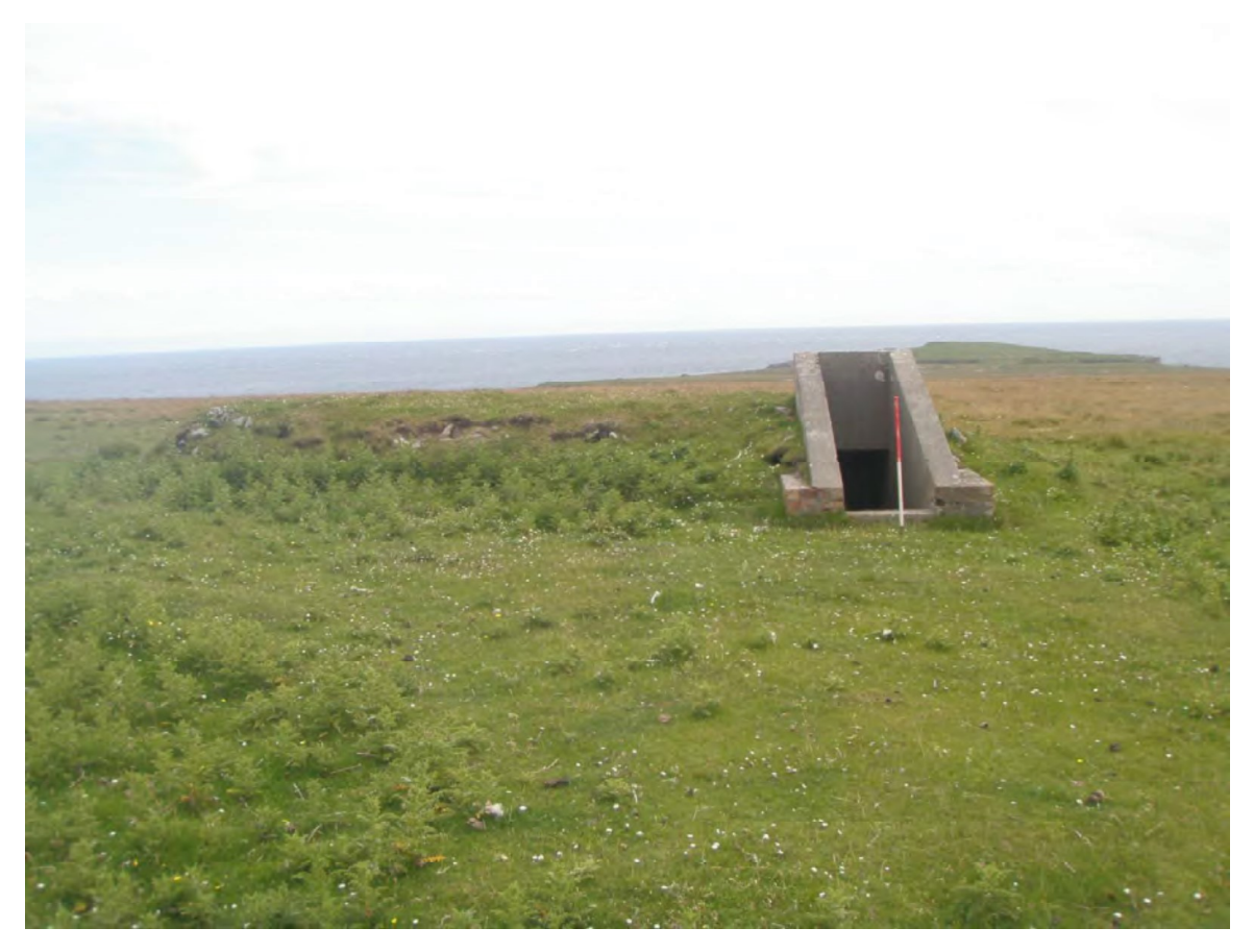
Plate 13: East facing view of a former air raid shleter (Site 135)